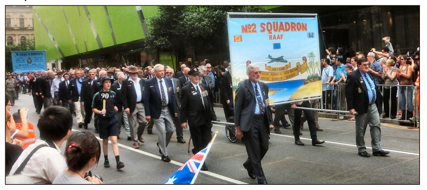
Eight of 2 Squadron's Canberras landed at Phan Rang in South Vietnam in April 1967. The Squadron had been in Butterworth since July 1958 when it relieved 1 Squadron so it was already 'tropicalised'. Phan Rang is about 250 klms north-east of Saigon and the base had only recently been completed when they arrived. It was the home of the United States Air Force's 35th Tactical Fighter Wing. 2 Sqn flew their first mission on the 23 April and left for home in June 1971.

For the first few months the squadron mostly few "combat sky spot" missions, where aircraft were guided by ground radar to a target and told when to drop their bombs. Most of the flights were flown at night and tended to be routine and boring. In September the squadron began low-level daylight bombing, hitting targets from low altitude, between 370 and 915 metres. The squadron had conducted similar bombing missions in Malaya but refined its accuracy in Vietnam to such an extent it consistently out-performed all other units of the 35th Tactical Fighter Wing.