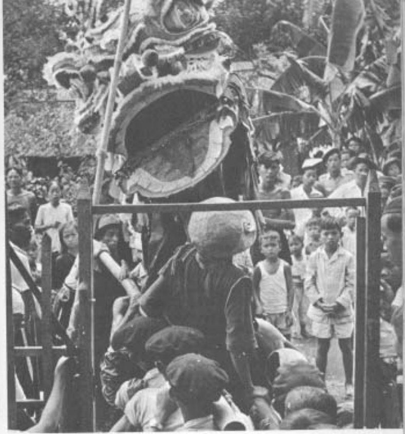
Tet Nguyen Dan is celebrated boisterously by others.