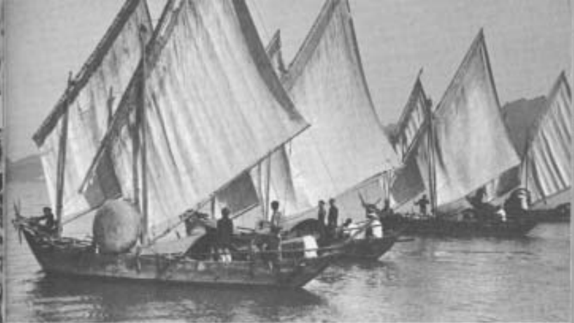
A Vietnamese Navy Junk Force patrol.

The Army. The South Vietnamese Regular Army and paramilitary forces number more than 500,000 men. All physically fit young men of 20 and 21 are normally required to perform two years of military service. This requirement is altered to include additional