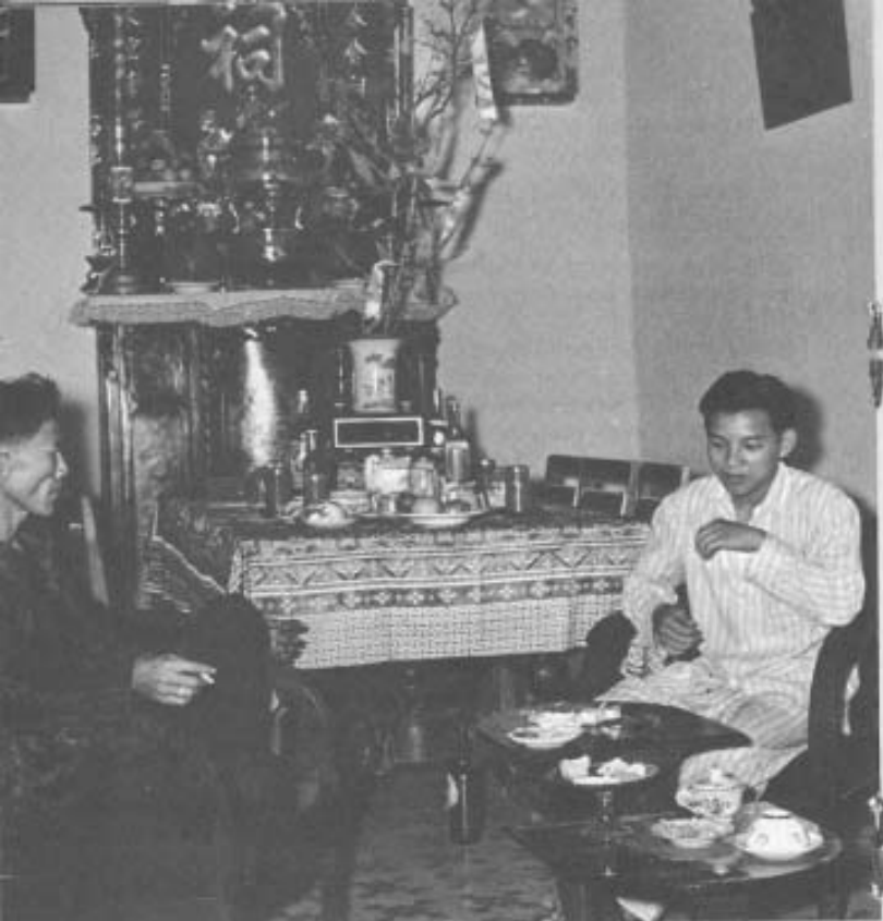
Tet Nguyen Dan (New Year) is observed quietly by some.