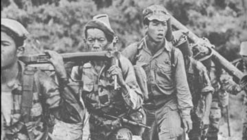
Montagnard "Strike Force" was trained by Americans.

largely of villagers who live and serve near their homes. Together with the Regional Force, they bear the brunt of the day-to-day fighting against the Viet Cong. In many ways these and other paramilitary groups could be compared to American minutemen during the Revolutionary War. They are being supplied with up-to-date weapons and field radios. The radios have filled a big communications gap. With them, help can be summoned fast or news of an impending attack flashed to the critical area.