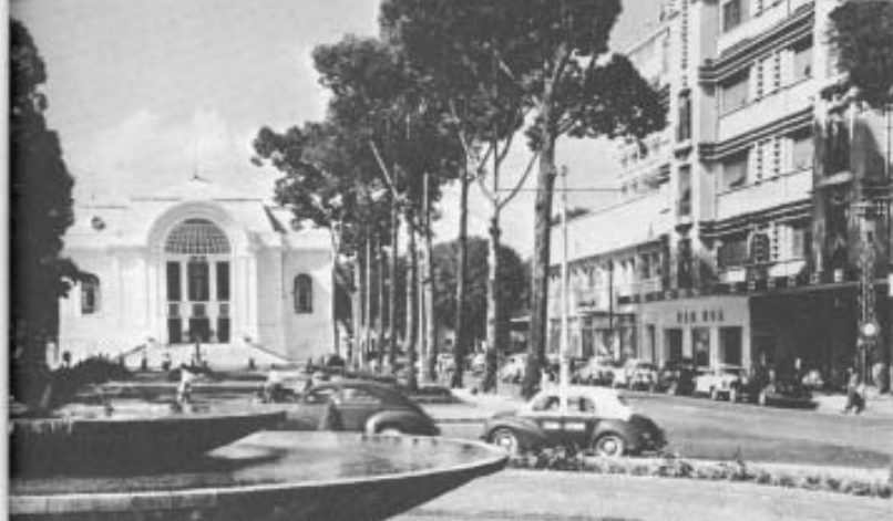
National Assembly meets in white building (left).

Saigon is the capital and largest city of Vietnam. With its predominantly Chinese city of Cholon (meaning "big market"), it lies