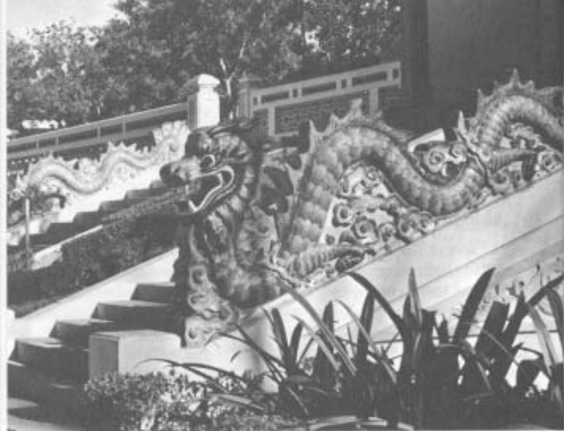
Dragons guard war memorial entrance in Saigon.

and often the design includes bats or butterflies in the corners of the rug to signify happiness.