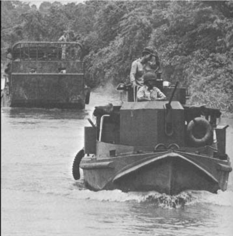
A armor protects Vietnamese Navy supply convoy.