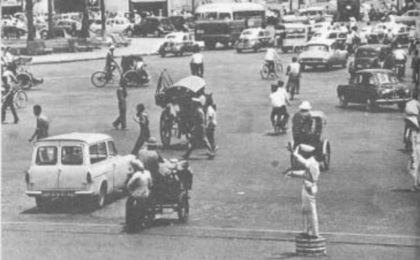
Variety of vehicles spices Saigon traffic.