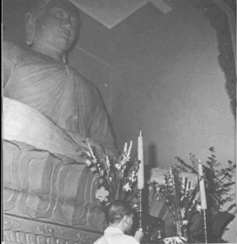
Buddhist rites are ages old.