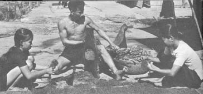
Farm family prepares tobacco for market.