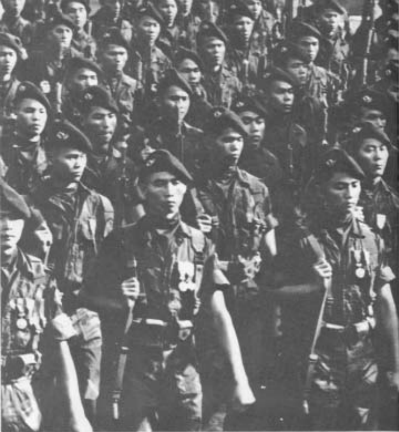
Determined-looking troops of Vietnamese Army.