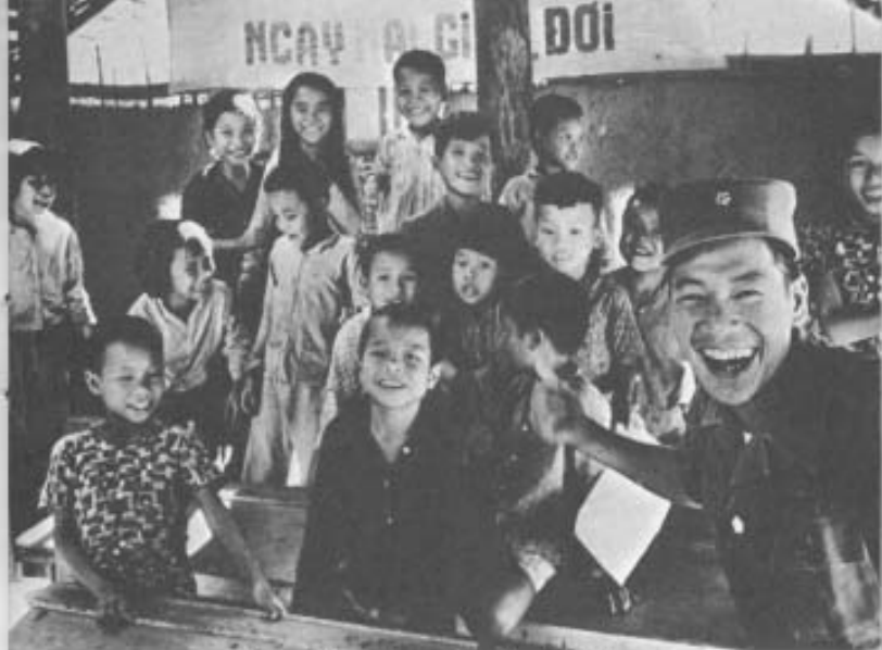
Army officer jokes with school children.

The Vietnamese village, lang and xa , is an administrative unit rather like a county in the United States. It is made up of a number of scattered hamlets or ap , each set against a backdrop of bamboo thickets and groves of areca (betel nut) and coconut palms. Located at the village seat of government are a school, athletic or parade