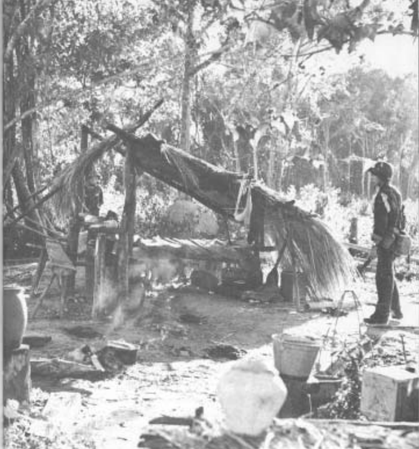
Viet Cong hideout is captured by Vietnamese troops.

Political activity has been confined chiefly to the cities and has had little impact on the great bulk of the population living in the countryside. These people—the villagers, the rice farmers, the rubber plantation workers—have had little feeling of identification with either the Viet Cong or the central Government. The Vietnamese