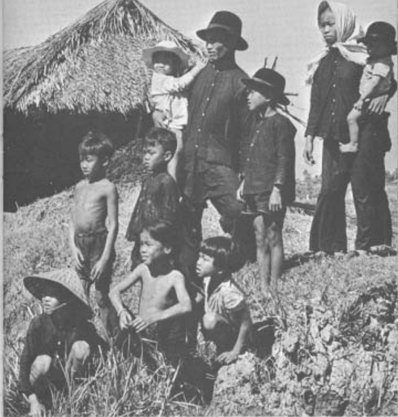
Portrait of a Vietnamese farmer and his family.

The traditional family unit includes living and dead members and members not yet born. On festival days and in family ceremonies the ancestors are revered, and at all times there is thought of the grandsons and great-grandsons yet to be born who will carry