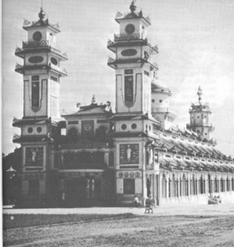
This elaborate Cao Dai temple is near Tay Ninh.

New Religions. In addition to the religions and philosophies brought to Vietnam from other countries, new ones were developed there.