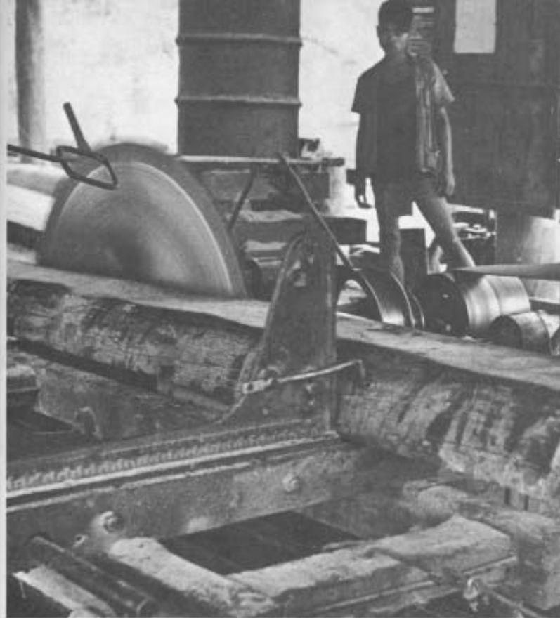
Timber is trimmed in Vietnamese sawmill.