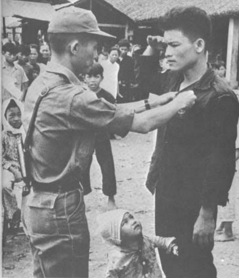
Vietnamese is decorated for defending his village.

The new Rural Life Hamlet program, part of the Rural Reconstruction or Pacification program, is designed to provide physical safety, effective local government, and a better life for the rural population. A typical hamlet has rudimentary fortifications and warning systems. The inhabitants are trained and armed to protect themselves against Viet Cong attack until reinforcements arrive. As security improves, Government services in such fields as health, education, and agriculture are provided, in many cases with U. S. assistance. Local officials, who are trained and paid by the Government and administer the hamlet, are usually chosen in hamlet elections. The program is designed to provide the improved security and economic conditions that encourage loyalty to the central Government.