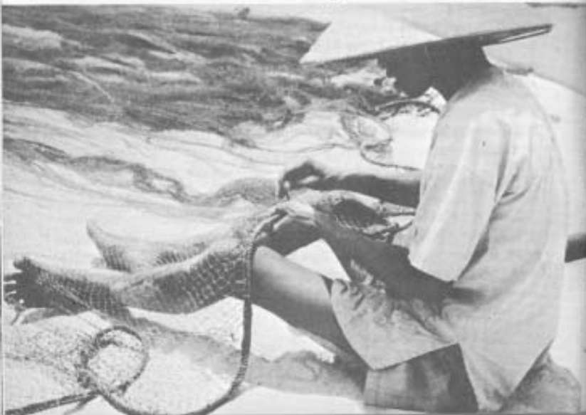
Fisherman mends his giant net.