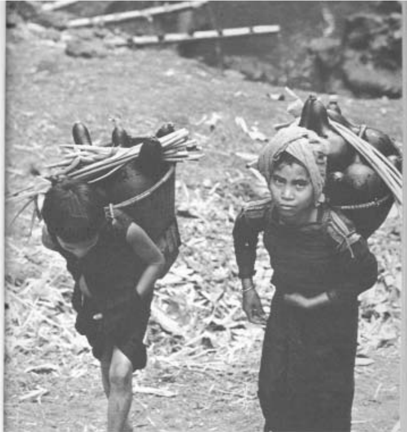
Rhade girls carry water home in gourds.

Also, none of these people ever had a written language of their own until French and American missionaries began devising them, mostly in this century. Comparatively few tribespeople know how to read, so if you want to study their language you do so by ear not by book.