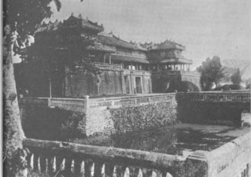
The former imperial Palace in Hué.

The Government has restored a few of the buildings. You can see the Emperor's Audience Hall with its gilt throne and red, dragon-