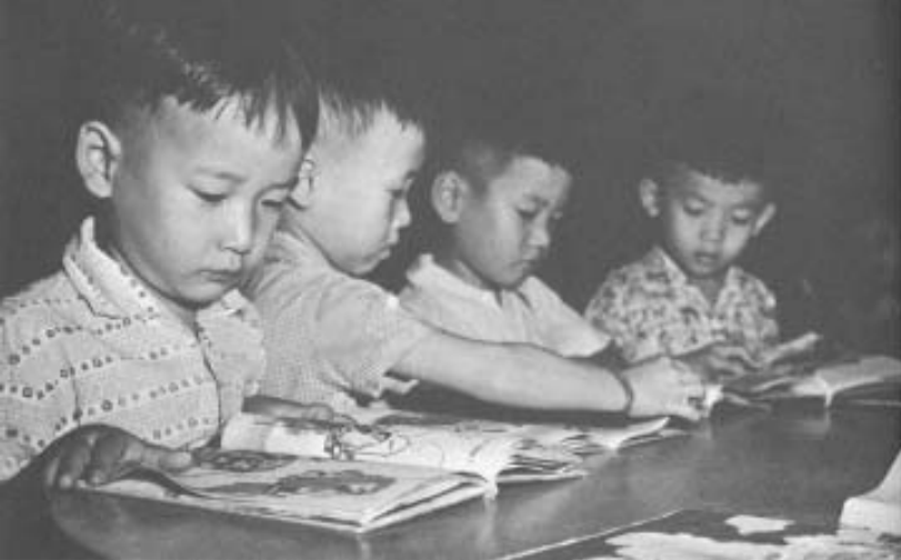
Schoolbooks capture the attention of young students.