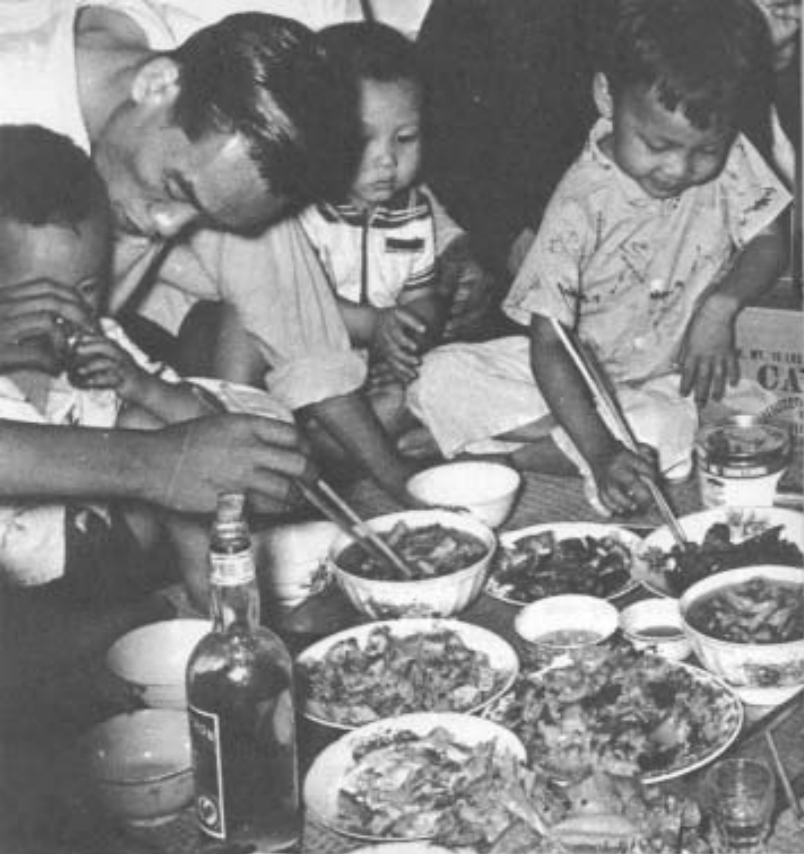
Vietnamese food delights both eye and palate.

nut." Among the vegetables are common ones like potatoes, turnips, carrots, onions, and beans; eggplant disguised under the name aubergine , and water bindweed, an herb that comes from the same family as our morning-glory flower.