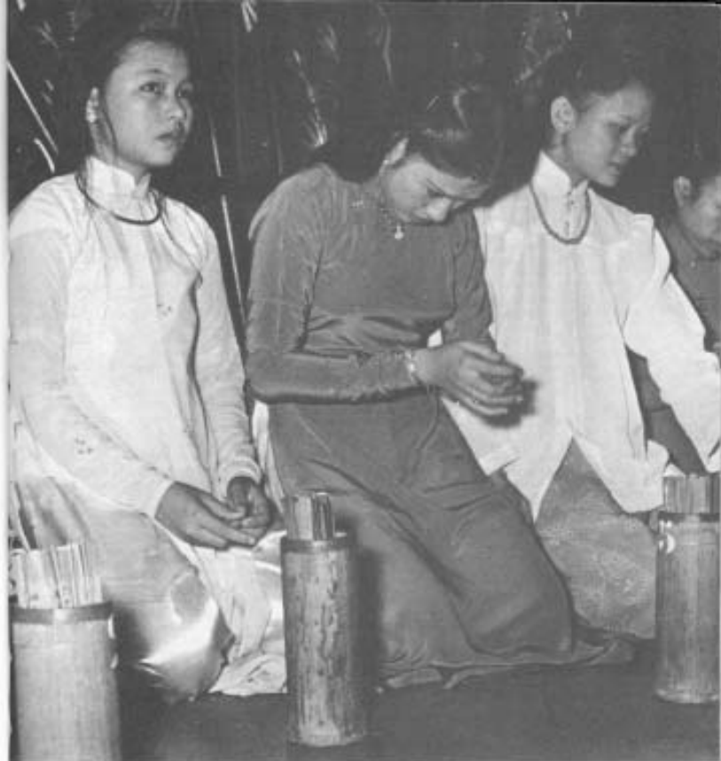
Religion is important to the Vietnamese.

Religion has been a significant factor in the Vietnam way of life throughout history. The present culture and customs of these proud and sensitive people are strongly conditioned by their religious beliefs. For example, feeling that the universe and man's place in it are essentially preordained and unchanging, they place high value on stoicism, patience, courage, and resiliency in the face of adversity.