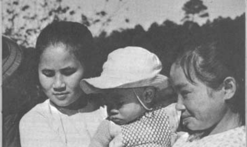
Young faces of Vietnam.

Since the purpose of marriage is to continue the family line, the parents believe that the selection of a proper wife for their son is their personal responsibility, a duty they owe both to their ancestors and to their son and his future children. Usually with the help of a "go-between," they search for a girl who is skillful at housework and who will be a good mother to many children. Beauty is not as desirable as good character. In fact, beauty is sometimes considered