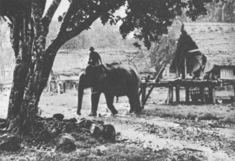
People of four mountain tribes live in this village.

There is also a village market. On market day, which is once or twice a week, people file out of the hamlets to follow the narrow paths or rice paddy banks to the marketplace. They come to sell, to buy, or just to gossip. Some balance baskets of fresh fruits and vegetables on their heads.