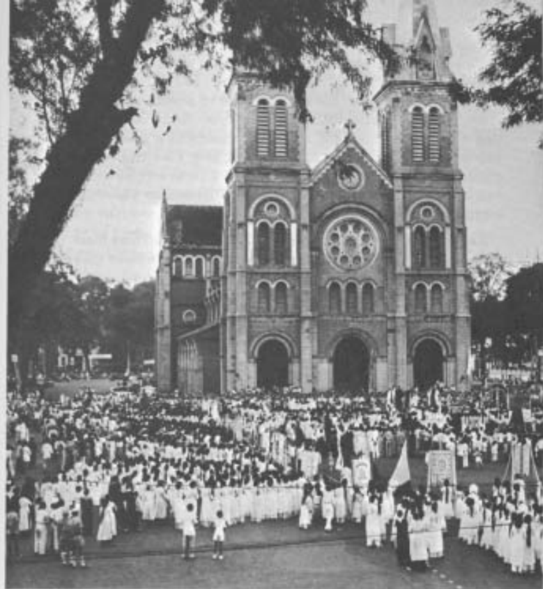
Procession before Saigon's Catholic Cathedral.