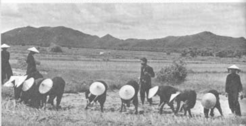
Farmers plant rice in Vietnam's lowlands.