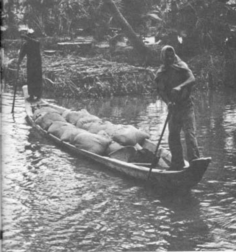
Muscle-powered sampans are typical of Mekong Delta.