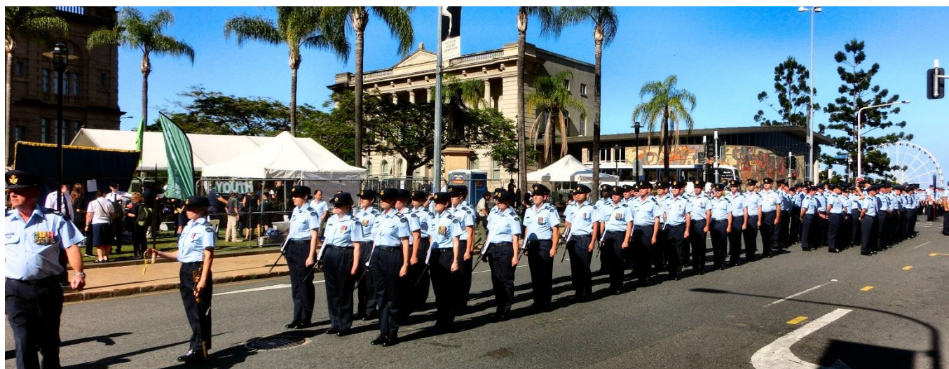
Some of the troops from Amberley, lining up prior to the march.