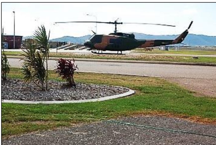
Iroquois A2 488 on display at the end of the strip where Duckworth Street meets Ingham Road

Accomplishments are made possible by your mother - failures are your own fault.