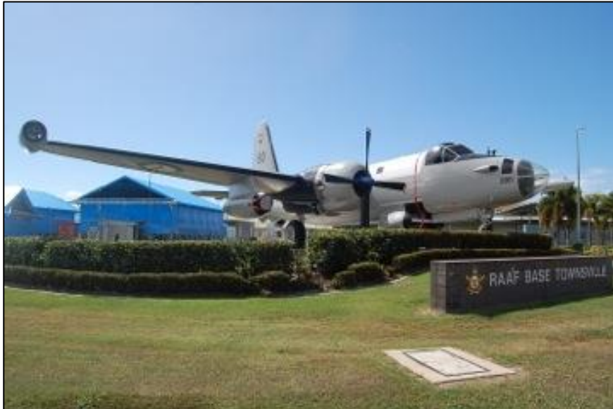
Lockheed P2V-7 (SP-2H) Neptune.

There were two Neptunes on display at RAAF Townsville until Cyclone Yasi in 2011 wiped out Aircraft 279 and then a tornado in March 2012 wiped out aircraft 280. This is the wonderful result of both aircraft re-assembled to make one and then displayed at the front gate.