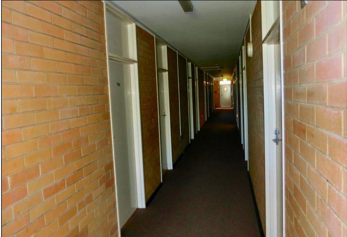
Inside the WRAAF quarters, this dark little corridor led to the girls single room 'cells'. This is the area that is supposed to be haunted.