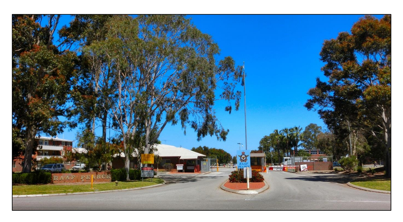
The new entrance to Pearce, like most other Australian bases, is now manned by Civvy contractors – no more guard duty for the naughty boys.