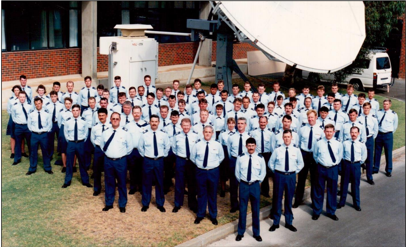
Point Cook Fireys, 1985.