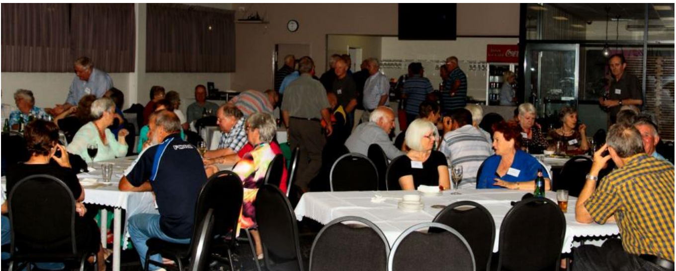
Part of the crowd at the Friday night's meet and greet.