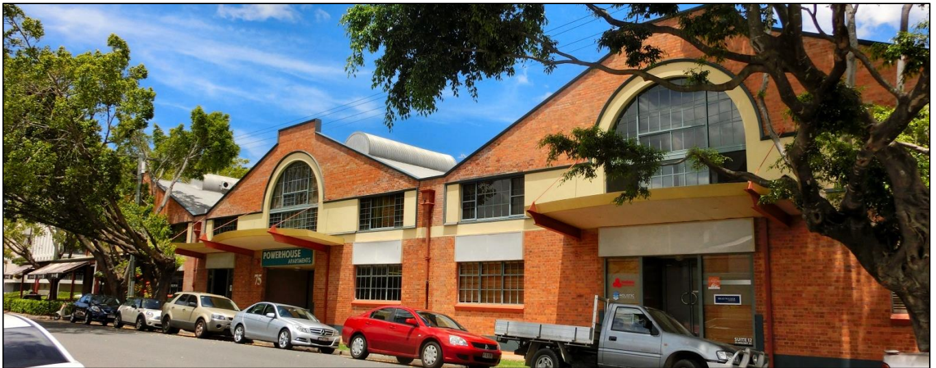
The building today is now the fashionable Powerhouse Apartments complex.

As the war moved into the Pacific just north of Australia, Brisbane became an important staging centre, which necessitated 3SD expanding rapidly. It needed more space, so in September 1941 the RAAF took over Austral Motors' mechanical workshops, a 1,500 square metre building in Wellsby Street, New Farm and this gave them more storage space and office accommodation.