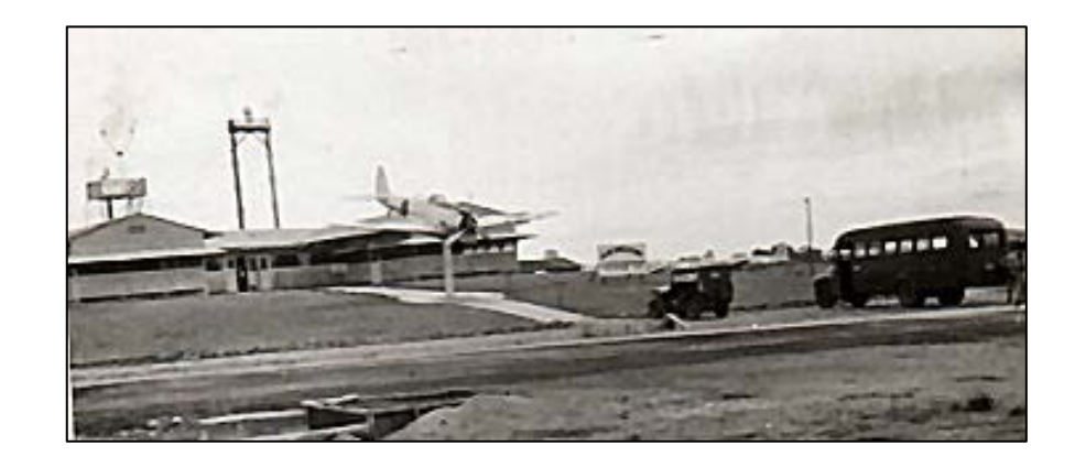
Entry to Clark Field airbase Manilla, 1948