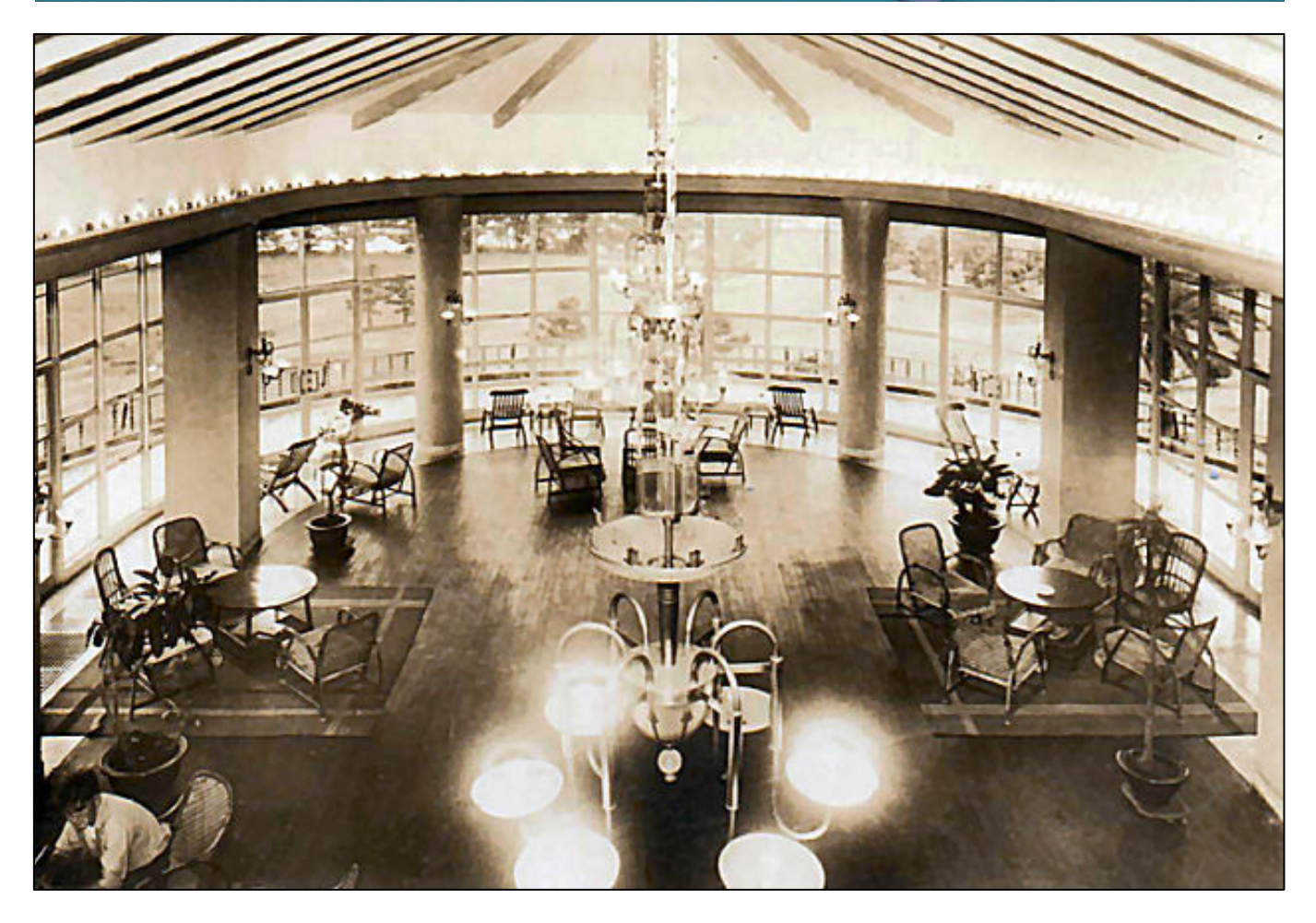
Kawana Resort for officers outside Tokyo.

Kawana was an old castle or palace and would be about 4/5 stars on today's hotel rankings. It included a first class golf course and professional instructor. Young girl caddies and all golf equipment included in $1 tariff, plus all meals and the usual hotel services. (You had to by your own beer). But alas all good things must come to an end, in this case prematurely. On the 28th of April 1952, WWII legally came to an end when all combatant nations signed a peace treaty and Japan regained its sovereignty. This gave them the right of access to all establishments. Consequently the RAAF had to leave.