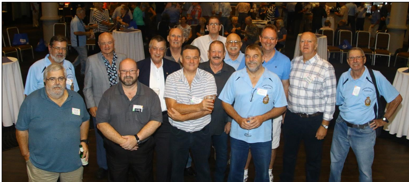
486 Mntce Sqn Radio were in attendance in strength.