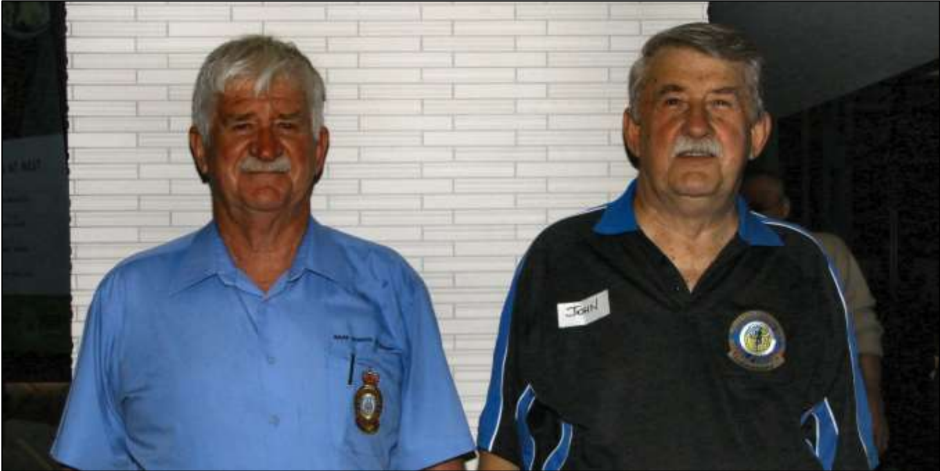
Radtechs Air – the A Team.