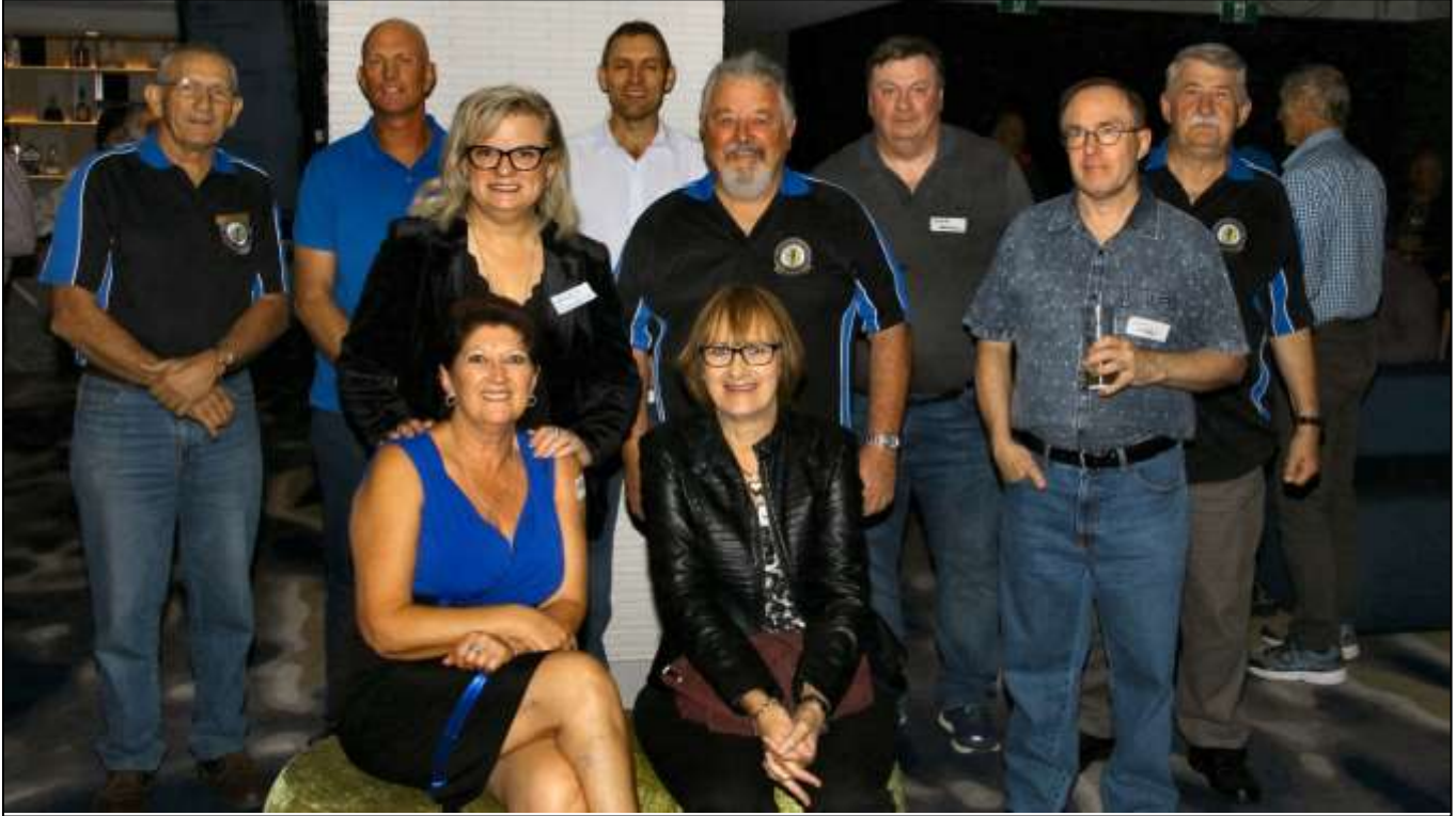
The Amberley mob.