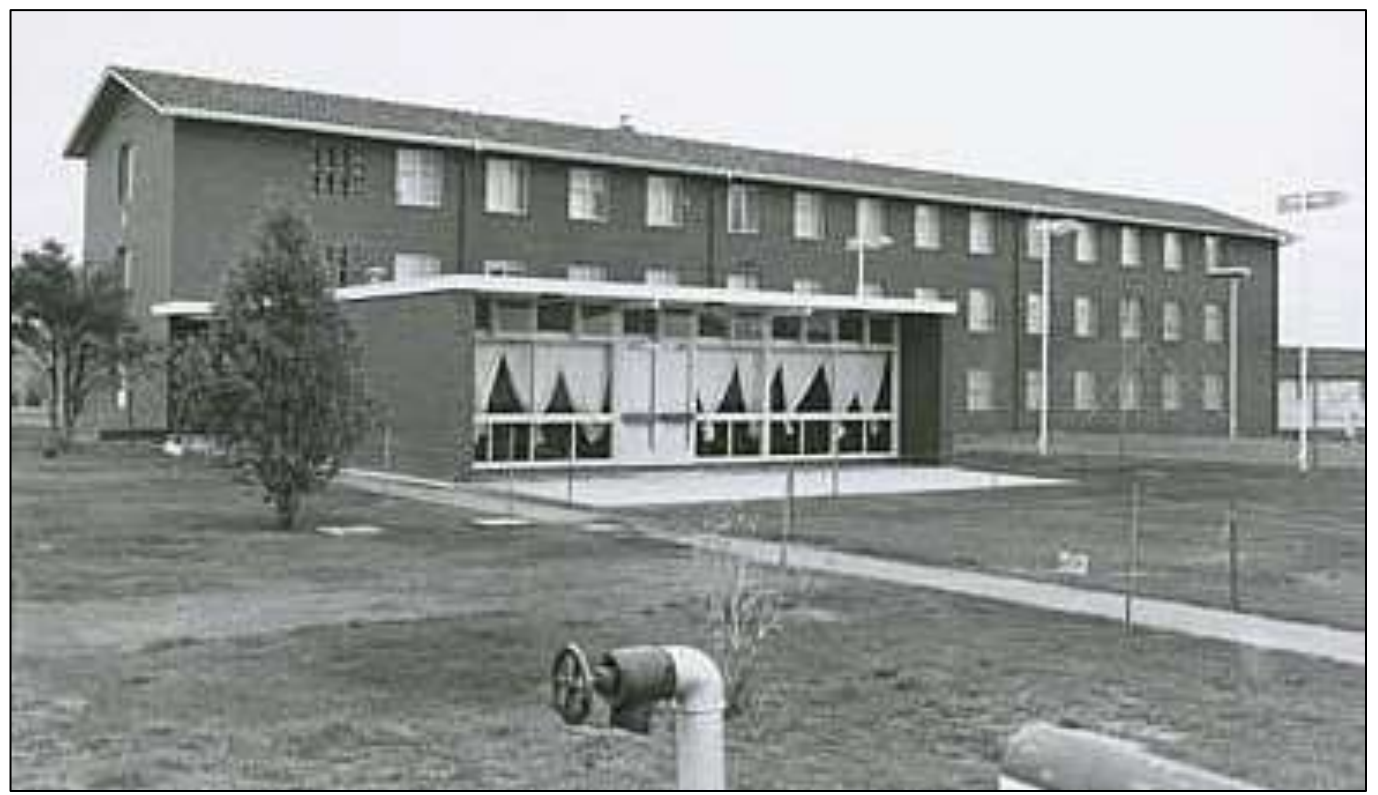
The Women's living quarters, Tottenham.

Today the main stores buildings are generally intact, apart from building no. 44 which has been mostly rebuilt. The rest has gone. The old Base has important historical associations with other Air Force facilities such as Laverton and Point Cook and assists in understanding the function and complex interdependence of the numerous defence and munitions supply facilities. The buildings have architectural interest as distinctive examples of functional Commonwealth Department of Works design, adapted to the particular use, in this case storage and inventory control of a vast range of military supplies and equipment. The place has local social significance as a major employer in the district following the Second World War.