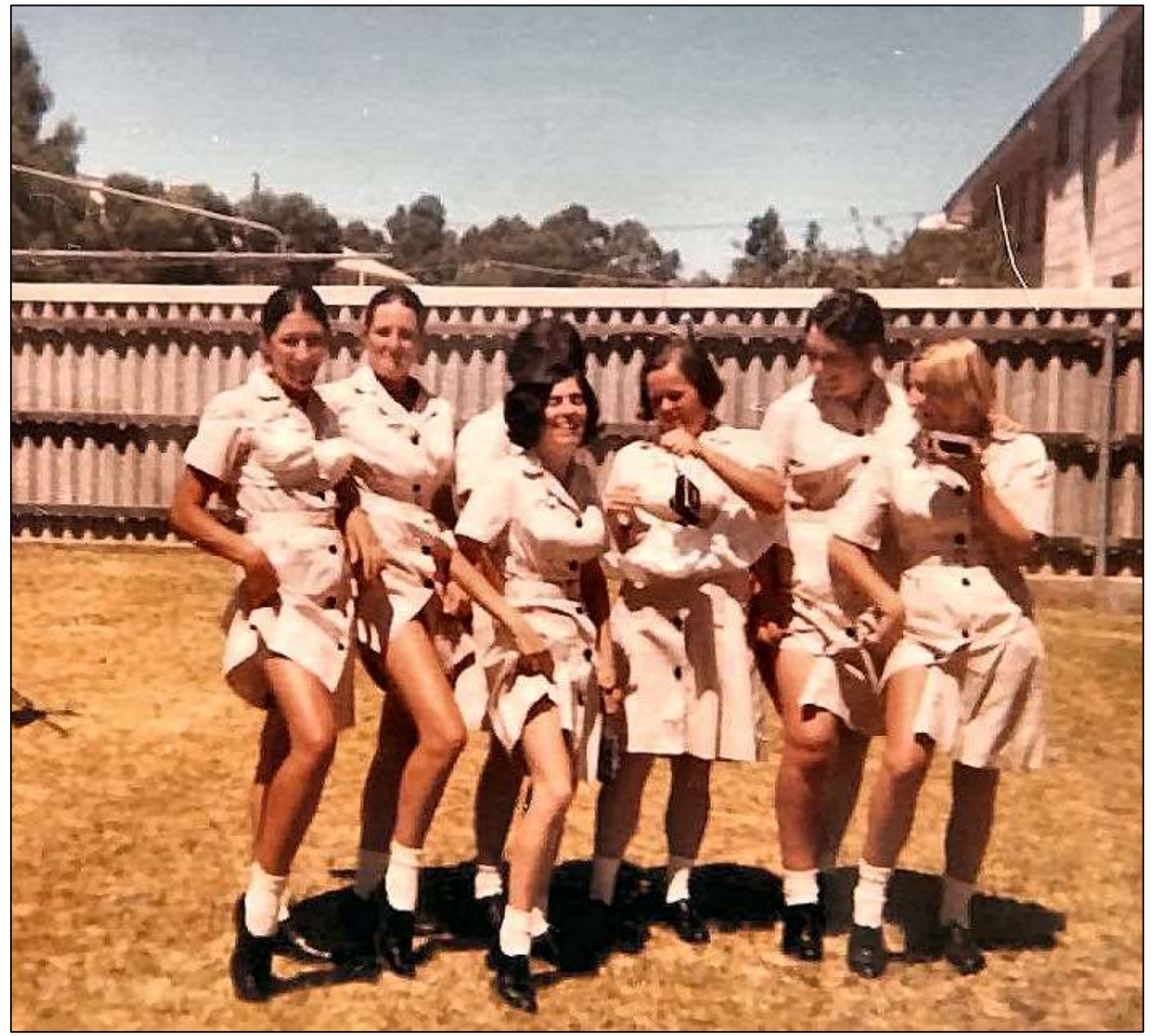
The above girls were on <u>205 Rookies</u> at Edinburgh, March 1972. Sorry gents – can't help you with names/phone numbers.....

If a woman says "Do what you want!" Do not do what you want, stand perfectly still, don't blink, don't answer, don't even breath. Just play dead!