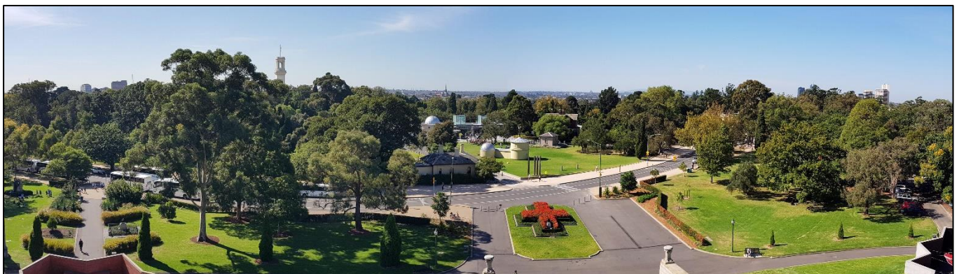
The Melbourne Observatory – with Government House in the background.

Looking towards the east you over look the 155 year old Melbourne Observatory which sits in the adjacent Royal Botanic Gardens.