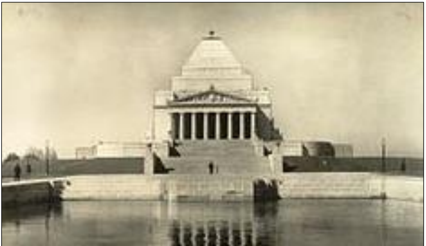
The Shrine in the 1930s showing the reflecting pool in front of the north face, where the World War II Forecourt is now located

Monash, who was also an engineer, took personal charge of the construction, which began in 1928 and was handled by the contractors Vaughan & Lodge. Monash died in 1931, before the Shrine was finished, but the Shrine was the cause "closest to his heart" in his later years. Work was finally completed in September 1934, and the Shrine was formally dedicated on 11 November 1934 by the Duke of Gloucester, witnessed by a crowd of over 300,000 people, a "massive turnout" given that Melbourne's population at the time was approximately 1 million and, was the "largest crowd ever to assemble in Australia to that date".