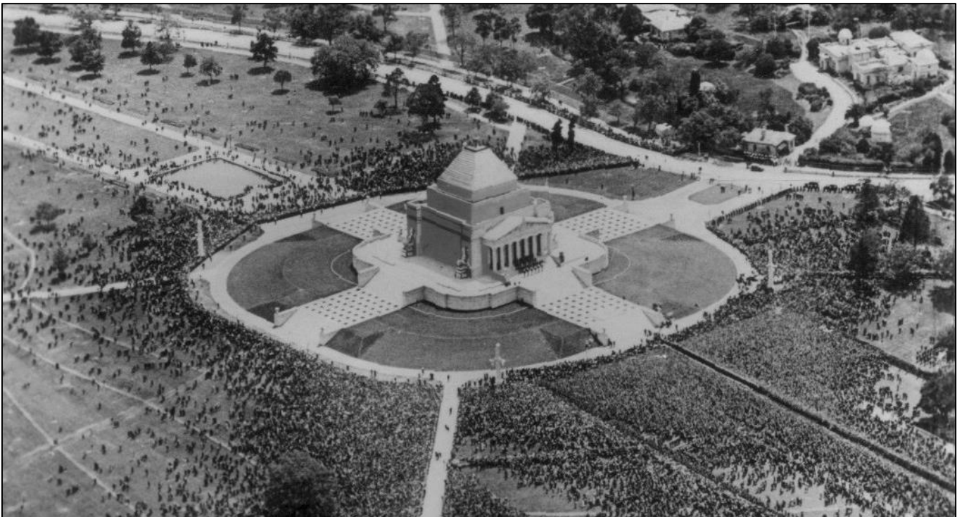
The dedication ceremony for the Shrine of Remembrance. Over 300,000 people were in attendance, approximately a third of Melbourne's population at the time.

Another early point of contention (although not explicitly related to the nature of the memorial) concerned the possibility of incorporating a "Tomb of the Unknown Soldier" into the memorial, an approach that was championed by the St. Kilda RSL, who revealed plans to bury a soldier from either Gallipoli or France on ANZAC Day, 25 April 1922. This proposal received considerable debate, and was countered by the argument that the Unknown Warrior in Westminster Abbey represented all of the dead of the British Empire. Monash was on the side of those against such a burial, as while he could see a place for an Unknown Soldier in a national memorial, he did not feel that it would be suitable at the Victorian Shrine. The Stone of Remembrance was later placed in the position where an Unknown Soldier might have been laid. An Australian Unknown Soldier was eventually interred at the Australian War Memorial by Prime Minister Paul Keating on 11 November 1993.