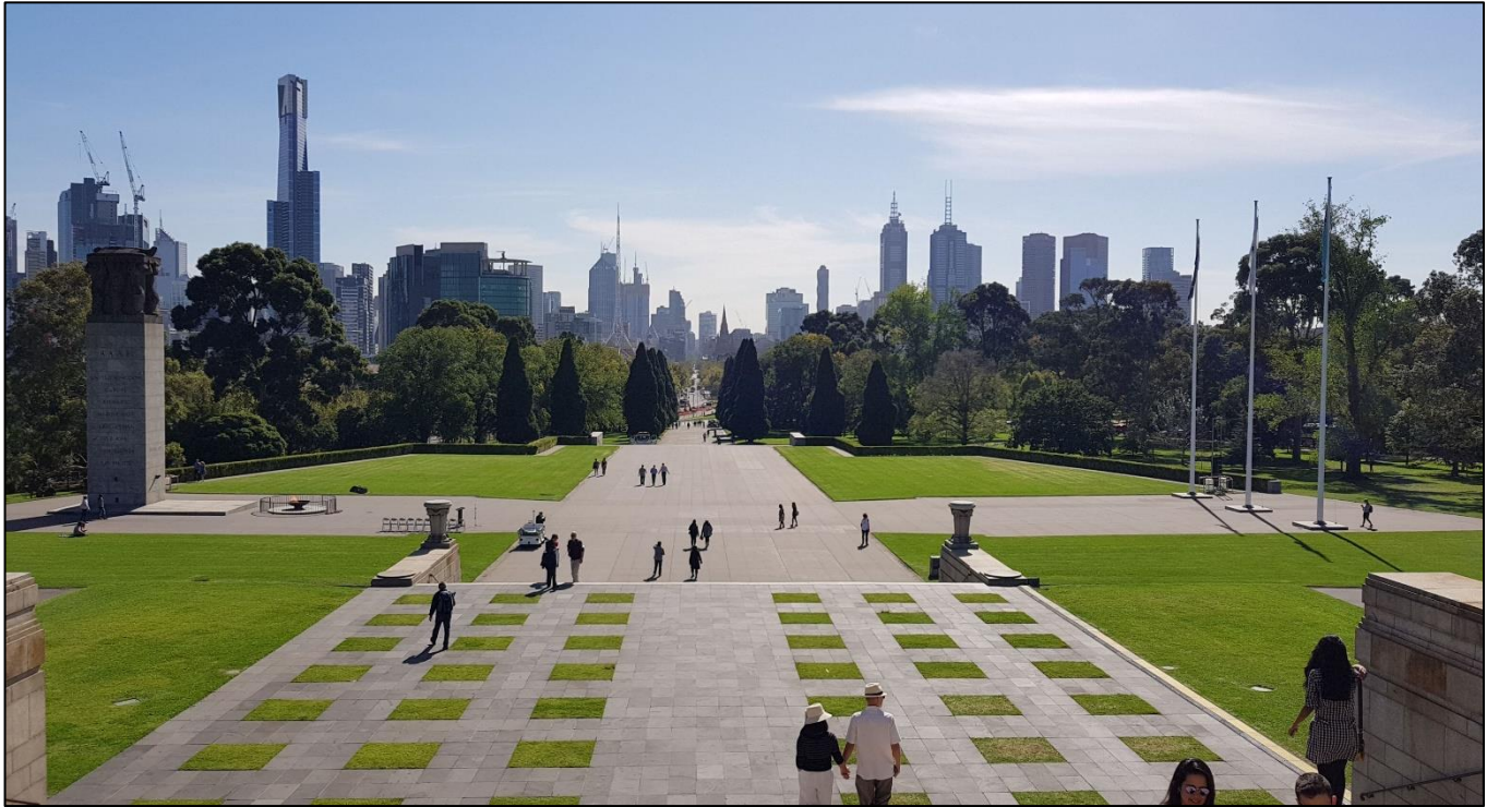
Ceremonial Avenue, looking back towards the city from the steps into the Shrine.

The Shrine went through a prolonged process of development which began in 1918 with the initial proposal to build a Victorian memorial. Two committees were formed, the second of which ran a competition for the memorial's design. The winner was announced in 1922, however, opposition to the proposal (led by Keith Murdoch and The Herald) forced the governments of the day to rethink the design and a number of alternatives were proposed, the most significant of which was the ANZAC Square and cenotaph proposal of 1926. In response, General Sir John Monash used the 1927 ANZAC Day march to garner support for the Shrine and finally won the support of the Victorian government later that year. The foundation stone was laid on 11 November 1927, and the Shrine was officially dedicated on 11 November 1934.