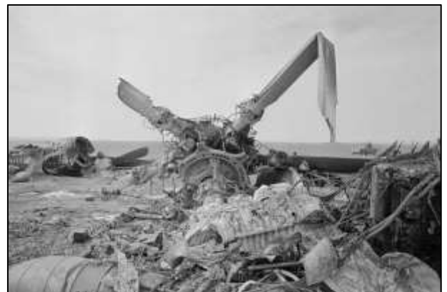
The wreckage of a RH-53D Sea Stallion helicopter abandoned after the aborted attempt to rescue American hostages in Iran, 1980.

Meanwhile, the U.S. was facing the scourge of the Iran hostage crisis. The 1980 failure of Operation Eagle Claw, the failed hostage rescue mission, was partially attributed to the short range of U.S. military helicopters. The U.S. Navy RH-53D helicopters, required to fly from the aircraft carrier USS Nimitz in the Persian Gulf to the Iranian capital of Tehran, lacked the range to make a nonstop trip. Troops and aircraft would secretly secure an airstrip in the Iranian desert to refuel the helicopters and ensure they had enough fuel for their mission. It was a dangerous tactic. A collision between a C-130 Hercules and RH-53D at the refuelling site caused the loss of aircraft and rescuers and forced the commander to abort the mission.