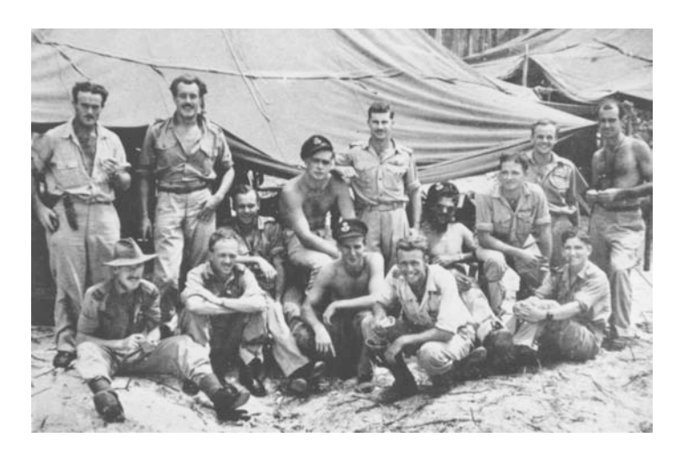
Pilots of 79 Fighter Squadron, Los Negros Island

Early start to the day. Weather fine. Our camp was a bloody shambles. Apart from an odd sheet of canvas seen here and there, no tents had come ashore from the ship. All that could be seen standing among the shot blasted palm trees, were sticks supporting personal ground sheets or mosquito nets, or bed positions burrowed into the sand. I wonder how long these conditions will last. Contact had been made with a neighbouring US Navy 'Sea Bee' unit (Constructional Battalion) who readily agreed to let us join their food queue. A hot meal served under civilised conditions was much appreciated, plus numerous cups of good coffee. We felt like very poor relations. With time on our hands, Tom, Jack Fisher and I inspected several nearby Japanese defence positions that had been put out of action by US Naval gun fire; coastal guns, searchlight batteries, nests of foxholes, and a cook house which stank to high heaven. Fighting was still taking place—small arms, guns and explosions from artillery shells can still be heard. Somehow, back in our camp area, I procured an American camp stretcher—which I will guard with my life. Understandably, living so close to the sea, the humidity at our beach camp is no where near as high as Kiriwina.