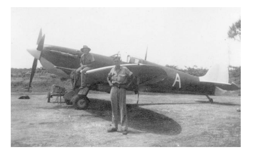
Kiriwina Island 1943 Tom Neill sitting on the mainplane, and myself in foreground of our Spitfire UP/A

14 Fighter Sector (Aircraft control, ground-to-air communication group) 26 RSU (Repair and Salvage Unit)