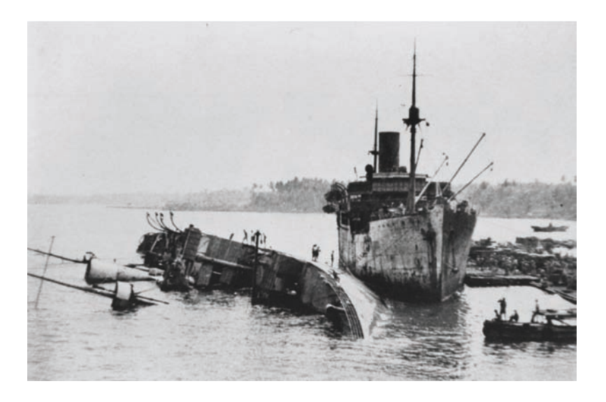
During the night of 6 September 1942, two Japanese warships slipped into Milne Bay and shelled the SS Anshun as it lay alongside the wharf at Gili Gili, unloading supplies for the army. The ship was badly damaged and later capsized. Lit up like a Christmas tree, the Australian Hospital Ship Manunda was also in the Bay, but the Japanese decided not to move against it.

Close to where we landed was a grim reminder of the war in the shape of the half sunken, half beached British merchant ship SS Anshun (3188 tons). It had been shelled while unloading war supplies by a cruiser which was part of a Japanese naval force that had slipped into Milne Bay on the evening of 6 September 1942. The Australian Hospital ship Manunda was also in Milne Bay at the time of the attack.