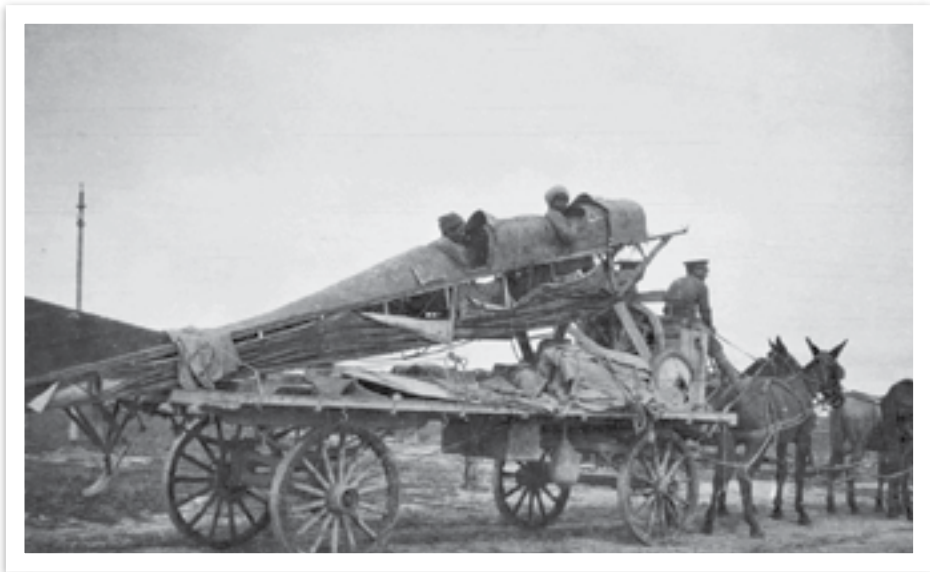
Combat support to the Half Flight included mule teams, seen here recovering a very broken BE2c aircraft, Mesopotamia, c. 1916