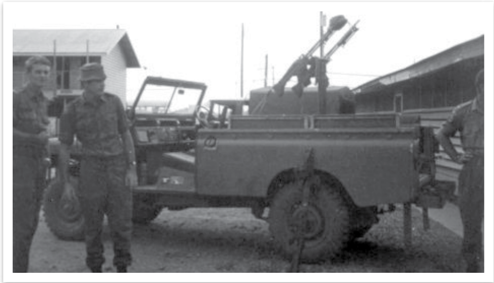
The original 'gun-buggy', Vietnam, c. 1969

sapper party, the first such medal to be awarded to a member of the RAAF since World War II. His leadership and courage under fire resulted in the injury and subsequent capture of a North Vietnamese artillery Major and possibly ended enemy plans for a two-company assault on the base. The only battle casualties of combat support staff in Vietnam were among the ADGs, which, including Iroquois gunship duties, totalled one killed and seven wounded in action. 27