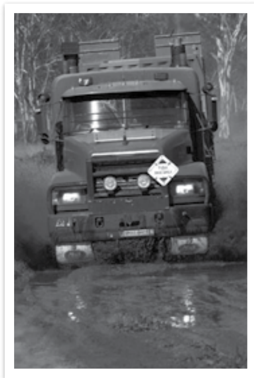
Prime mover on the Peninsular Development Road, Cape York, 2005 – CSG gained extra funding for equipment after East Timor

The exercise mentality had also pervaded personnel in their individual readiness to deploy. A few of CSG's people had refused, on conscience, to deploy to the war in East Timor and were later subject to administrative action leading to their discharge from the Service. They had not fully considered their role as combatants until asked to deploy, and the Air Force had no mechanism in place to identify anyone who might object to a warlike deployment. In contrast, others clambered to deploy and, seemingly, would go to almost any length, some spitefully, to be part of Australia's first major deployment in their career span. Some personnel had not passed their annual health, fitness or weapon handling tests and many had not considered their personal financial, legal or similar domestic arrangements. Individuals generally were ill-prepared for a long-term deployment, as were their families for their absence. Individual readiness requirements, which had been slowly developing since the early 1990s, were quickly progressed and formalised. By mid-2000, everyone in the Air Force was required to meet strict criteria to qualify annually for the Operational Readiness Badge, an indication, and in some sense a declaration, of an individual's readiness to deploy.