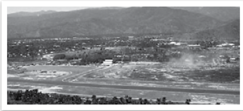
Comoro airfield, Dili, c. October 1999 – Before the helipads with dust rising (right) from 381 Expeditionary Combat Support Squadron works