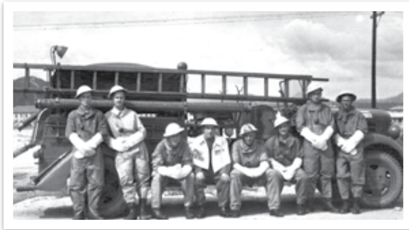
Fire Section, Bofu, Japan, 1948 – All base support responsibilities transferred to 77 Squadron in Japan, 12 months before the war in Korea

and pay, bulk fuels storage and distribution, guards and security, communications, transport and air terminal, messing and accommodation, off-base clubs, education and technical library, motor transport and Link Trainer (simulator) maintenance, and dependants' housing. 8 While the depth of the responsibilities would have diminished somewhat from the days of three RAAF fighter squadrons in Japan, the list of tasks transferred to 77 Squadron is still quite daunting; especially for a unit commander whose primary responsibility and skills were flying operations.