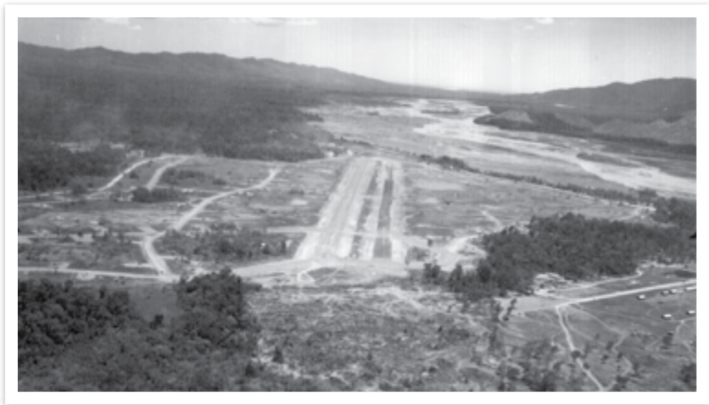
Airfield construction was critical to air operations – A ‘world record’ was claimed for the construction efforts at Nadzab, PNG, February 1944