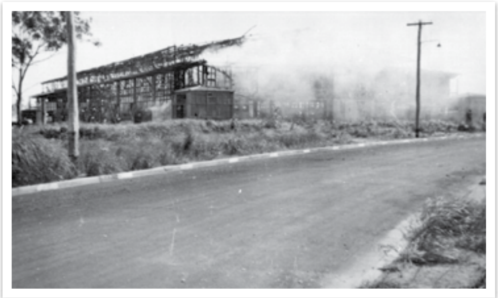
The main store on fire, RAAF Darwin, 19 February 1942 – Four days after the bombings, 278 men were still absent from the Base

evacuation, they followed everyone down the road for about a kilometre to set up a first aid post, and later returned to work from the nursing quarters before moving to the Darwin hospital, their own sick quarters being completely destroyed. 34