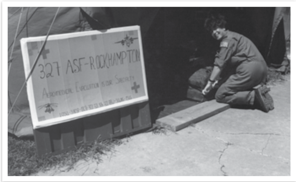
No 327 Contingency Air Base Wing Aeromedical Staging Facility (ASF), Exercise Tandem Thrust , Rockhampton, 1997 – Contingency Air Base Wings changed the support concept from reliance on a single unit

capability. 8 Besides, any one Force Element Group would rarely (if ever) deploy alone, making the suggestion of such an arrangement nonsensical.