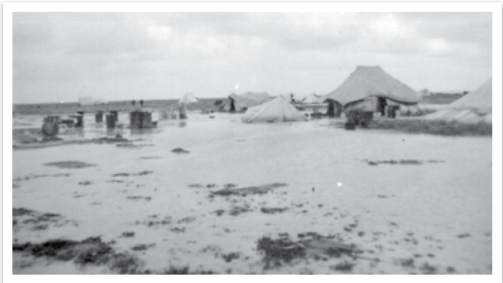
Mess area, North Africa, c. 1943 – Squadrons operated under adverse conditions and often moved at a few hours notice

Road moves were hazardous. Apart from the extreme climatic conditions of the desert, the roads were poor and often crowded, especially during a major move, movement off-road risked the danger of landmines and natural hazards, and the threat from enemy fighters and ground forces was always present. Squadrons often moved at a few hours notice, orienting at their new location from the operations tent, and forward airfields, or the roads to them, were frequently in close proximity to the battle.