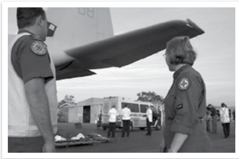
Patient transfer at Williamtown following the Bali bombings of October 2005