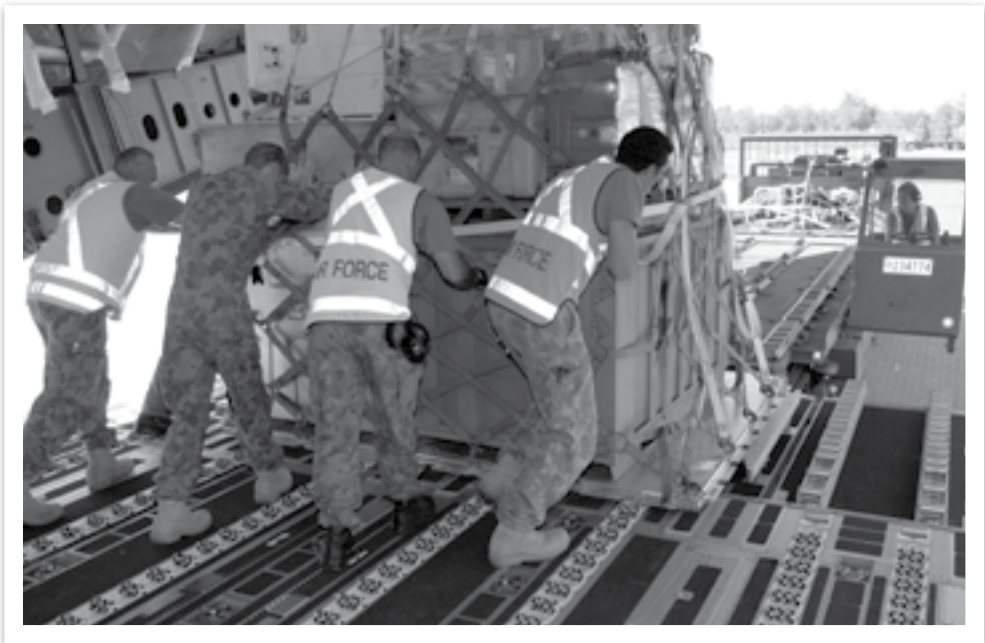
Unloading a C-17 Globemaster III, Williamtown, May 2007 – Air load teams frequently support short-notice disaster relief tasks

Short-notice, rapid response operations are fairly common for CSG, even outside of the major natural disasters and security breakdowns that attract international attention. Response times for cyclone and similar disaster relief efforts in Australia and the near region, which have long been conducted by RAAF C-130s, reduced to a 'near-immediate' response from the mid-1990s after Emergency Management Australia stockpiled stores in the Sydney area. Often, such as for the Australian relief effort to Iran following an earthquake on Boxing Day 2003, CSG involvement is limited to preparing and packing cargo and loading aircraft at Richmond. Air load teams though, frequently do travel with the relief aircraft to help unload, such as to the cyclone-ravaged Pacific island of Niue in early January 2004 where they unloaded the relief stores by hand. A few weeks later another air load team supported a C-130 relief effort to Vanuatu, devastated by Cyclone Ivy.