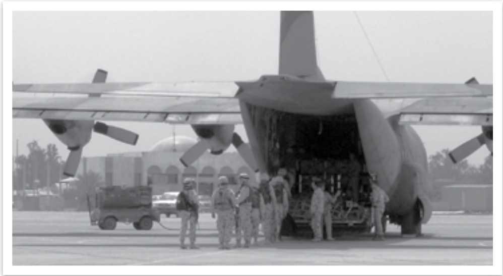
Loading C-130 passengers at Baghdad, 2004

Project Management Team, they delivered 43 buildings and associated utilities in just 53 days, working from November 2002 to February 2003. 4