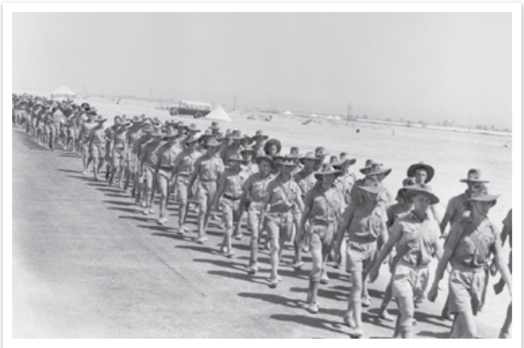
New arrivals in the Middle East, possibly 450 Squadron, May 1941 – No more Australian support staff joined the EATS squadrons after Japan entered the war