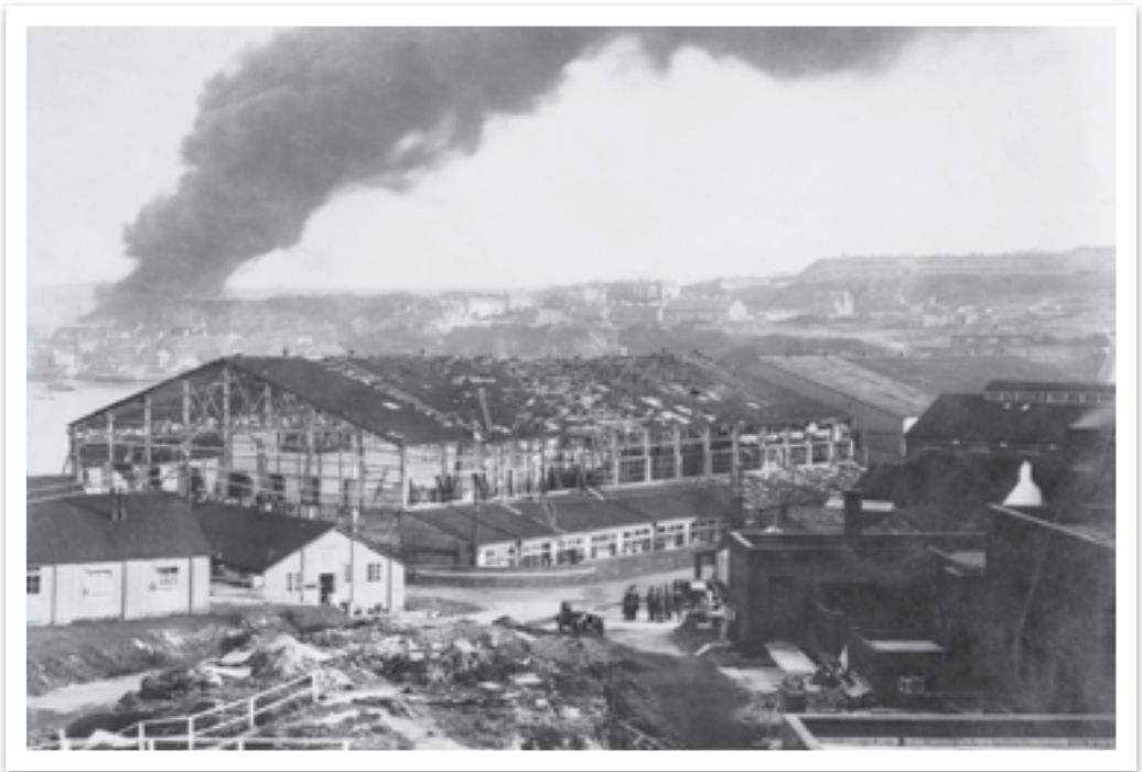
Response teams were mainly concerned with fires – The oil fire (background) closed 10 Squadron’s UK base for four days, RAF Mount Batten, Plymouth, November 1940