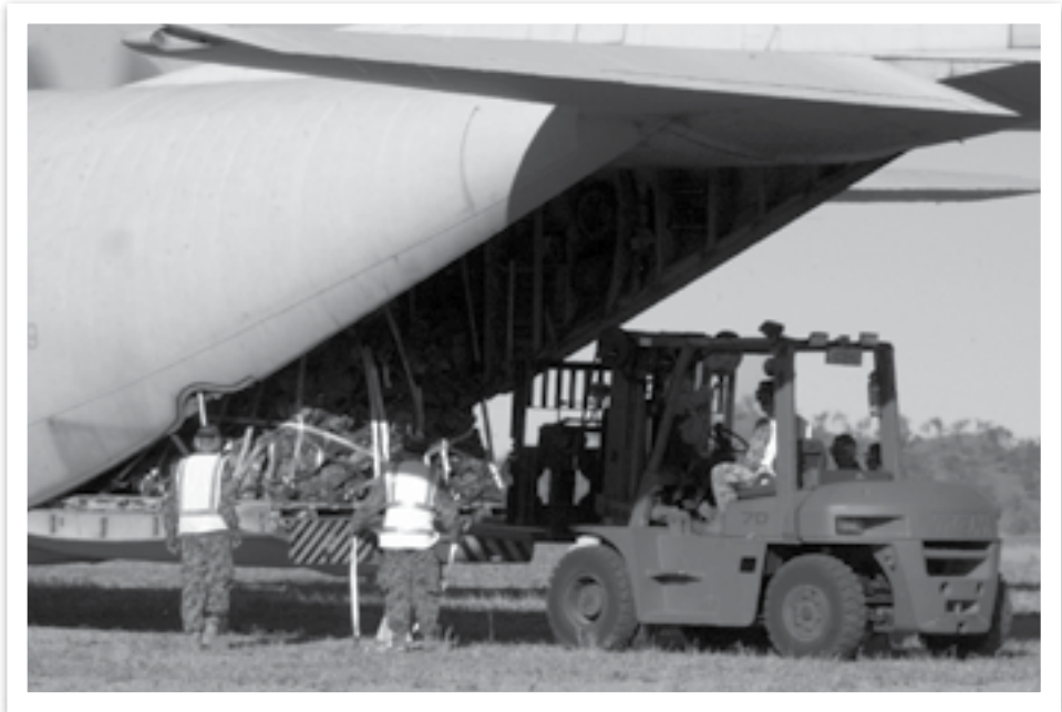
Unloading C-130, Exercise Northern Station, 2004 – CSG airworthiness certification was initially limited to airfield communications and navigation aids

arrangements on the bases, led to the inaugural airworthiness board for air base support services in late 2004. 22 Initially concerned with main base and non-expeditionary services only, the process was expected to extend eventually to all of the CSG-provided services and flow to combat support training. While not involving the airworthiness of an aircraft type, application of the process to combat support equipment and more widely to air bases, recognised that a failure on the ground can equally contribute to an aircraft or mission failure.