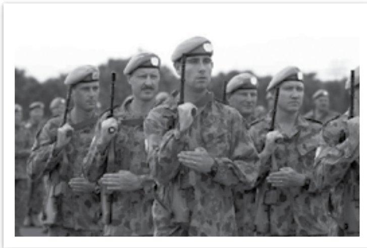
CSG personnel served in a variety of roles with UNTAET, Dili, December 2000

AME was the normal means of evacuation due to the rugged terrain and poor accessibility by road, and close proximity across East Timor by air. Initially, under INTERFET and UNTAET, teams from the Expeditionary Combat Support Squadron Aeromedical Staging Facility conducted AME both to Australia in C-130 and within East Timor on Caribou and UN rotary wing and Army Black Hawk aircraft. The primary role of the AME teams, located variously over time from Comoro, the UN Hospital in Dili, the heliport and later back to Comoro, was to support the UN forces but a high percentage of their work was evacuation of East Timorese civilians. 26