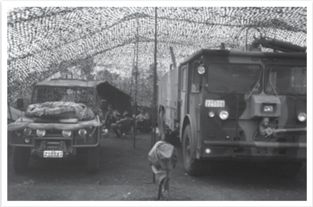
No 1 Operational Support Unit Fire Section with Oshkosh truck, Lakeland Downs, 1987 – The 1987 Defence White Paper and the Wrigley Review of 1990 made the first calls for outsourcing of base services