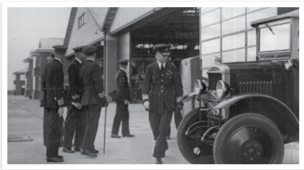
Chief of the Air Staff, Air Vice-Marshal Williams, inspects a Morris Cowley truck, Laverton, c. 1936

part-time, Citizen Air Force (CAF) positions. 18 Squadrons were not brought up to full permanent strength until dedicated CAF squadrons were formed from the mid-1930s.