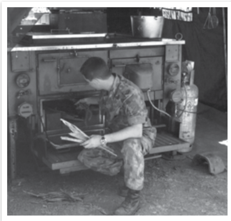
No 1 Operational Support Unit field catering course on the versatile mobile field kitchen, Townsville area, c. 1994 – Training of shadow-posted personnel was a major task for Operational Support Group

equipment, radio and command post procedures, logistic procedures and other critical skills, let alone the abilities needed to control and deploy a disjointed unit in an orderly fashion to operate in an unfamiliar and potentially hostile environment. Other than Exercise Annual Garrison for Airfield Defence Wing Reservist training from around 1995, wing exercises were not conducted as the Contingency Air Base Wings were only available for the larger joint exercises. Too frequently, bare base exercises dispensed with mobilisation training because of the added cost of flying several hundred people to Townsville and then again to the west coast base.