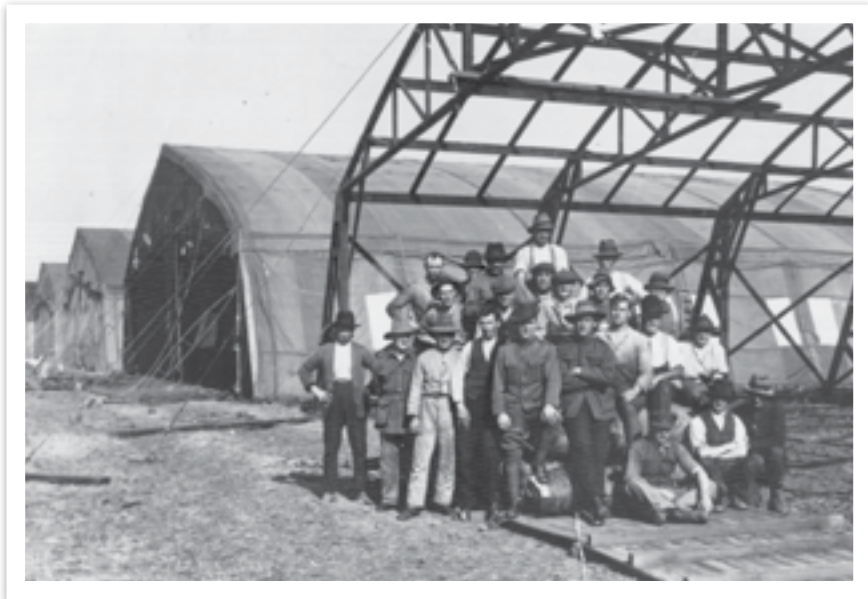
Equipment gifted from Britain for the new Air Force included vehicles and airfield equipment like these Bessoneau hangars, Point Cook, early 1920s

The aircraft and some of the equipment were stored in the canvas Bessoneau hangars with wooden frames erected at Point Cook, though most of the gift equipment was stored in open woolsheds in the railway yards of suburban Melbourne, at Spotswood and Flemington, or in vacant brewery buildings at North Fitzroy where the MT repair shop was located. Accounting for the stores and maintaining them proved difficult, even though a large proportion of the Air Force, on paper at least, was dedicated to the task. 14