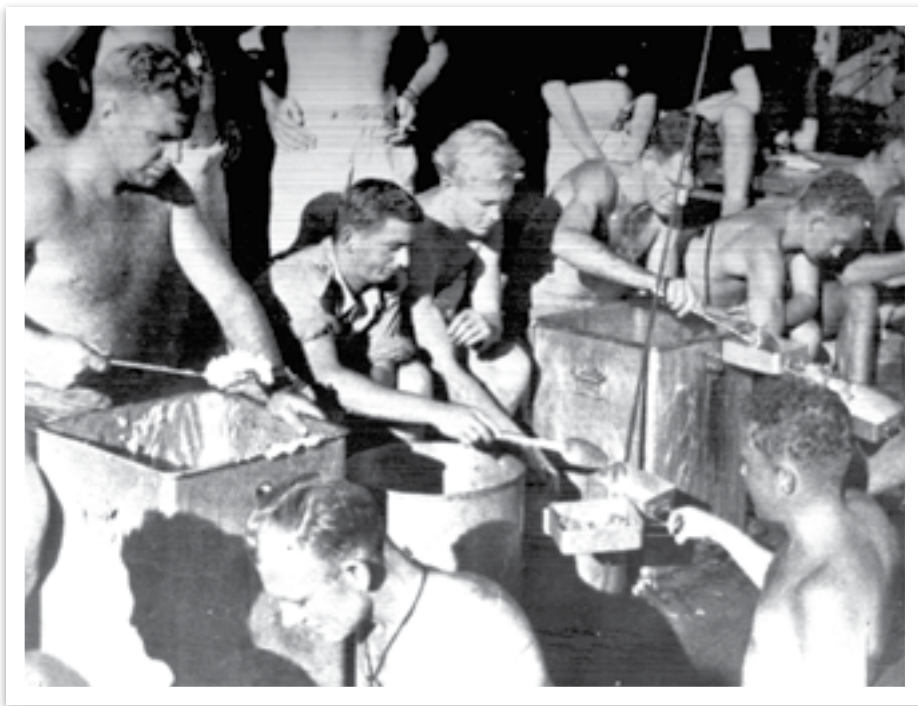
Mealtime, South-West Pacific, c. 1944 – Specialist support units were integrated into self-supporting wings for operations in the South-West Pacific

After victories at Milne Bay and elsewhere—the Battle of the Coral Sea a few months earlier, Guadalcanal in the Solomon Islands, on the Owen Stanley Range (Kokoda) in late 1942, and in the Bismarck Sea where the RAAF contributed to a stunning victory in March 1943—stopped the Japanese advance, the Allies began to move forward. From one island airfield to another, the sequence—capture the airfield, repair it or build anew, support the aircraft fighting to secure the next airfield—was repetitive and the time line ever-changing but always tight. Rapid mobility, usually by amphibious landing craft, introduced new challenges for the RAAF in New Guinea.