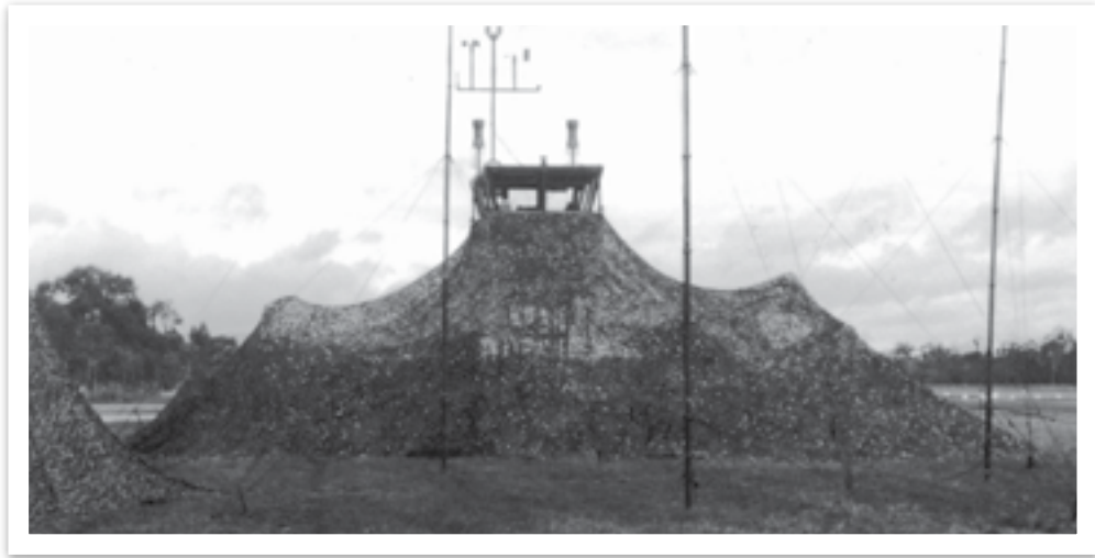
Mobile air traffic control tower under camouflage, Scherger, 1998 – CSG adopted the ‘300 series’ numbering system used by the RAAF post–World War II

of composite wings, used primarily for a combined strike and fighter force for exercises, was short-lived in favour of joint and combined task groups, the numbers were retained for the CSG wings. The Tindal-based wing, 322 Combat Support Wing and its subordinate 322 Combat Support Squadron, adopted the number of the former Tindal-based Air Base Wing.