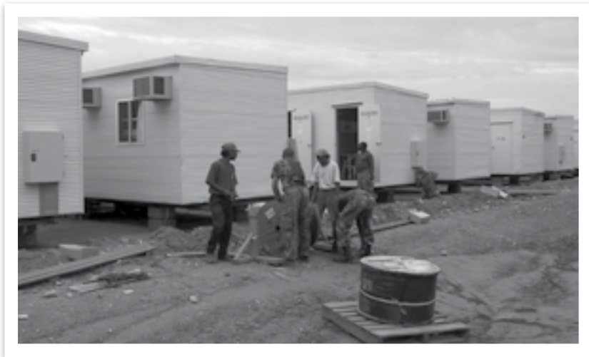
Corporal Roger Shordan installs mains power with help from Kenyan engineers and local civilians, Comoro, 2000 – Accommodation progressed to buildings

By December 1999 the Comoro airfield began to look like a normal civilian airport again—a desire stated strongly by Air Commodore McLennan—with security fencing and lighting around the tarmac constructed by the airfield engineers. They also helped construct a landing zone for UN helicopters, slowly improved airport buildings, restored local power, painted the runway centre-line and installed portable runway approach lighting, known as PAPI, in January. 18 It was the first operational deployment of PAPI, previously only installed for trials at Richmond, and was initially powered by a generator but later remotely operated from the air traffic control tower. By January, site clearance for a new 250-man camp and air-conditioned accommodation buildings, portable hut style, to replace the tents was well underway. The camp was perhaps the most significant construction task undertaken by CSG in East Timor and certainly the largest, all stages supervised by 381 Expeditionary Combat Support Squadron airfield engineers, though Australian Army engineers undertook the site preparation while Kenyan Army engineers and some local East Timorese tradesmen helped with the fit-out. 19