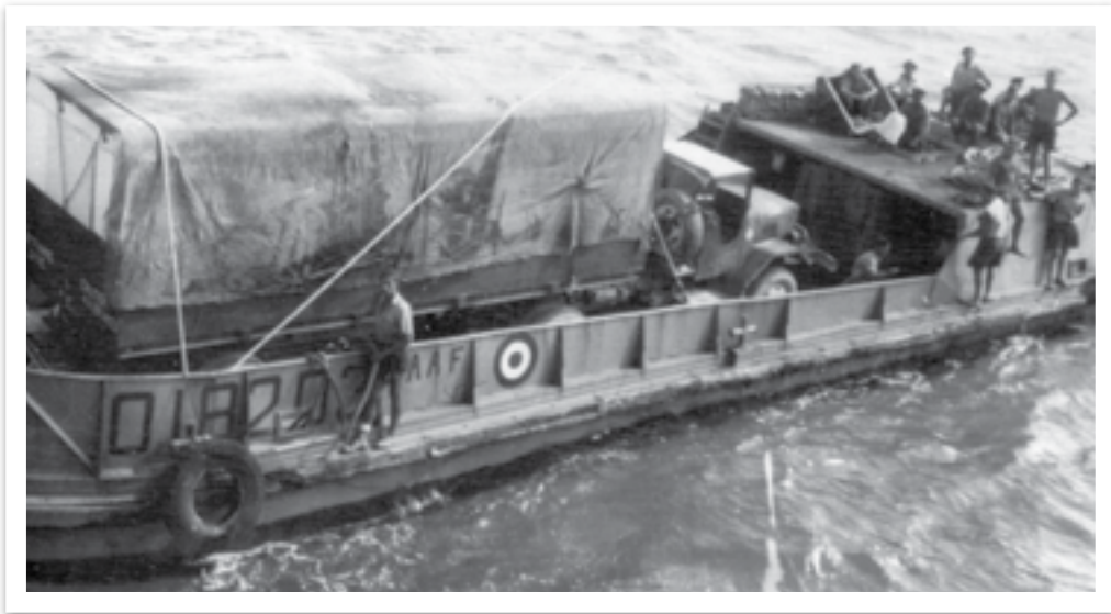
Unloading 2 Airfield Construction Squadron equipment, ship to shore by RAAF barge, Cocos Island, c. 1951