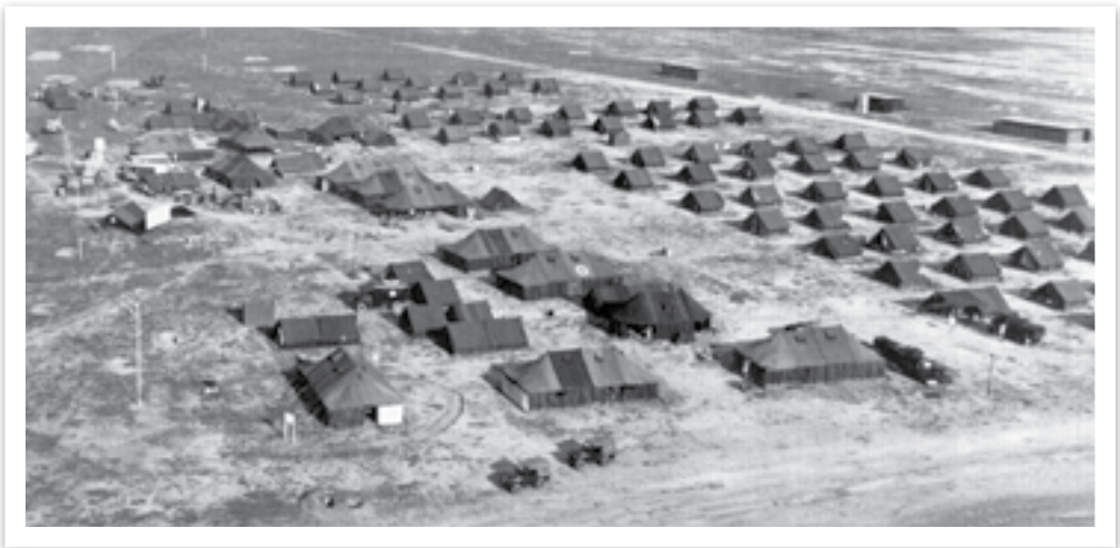
RAAF Ubon domestic area, Thailand, 1962 – Ubon was supported from Butterworth until Base Squadron Ubon was raised

Command of Ubon, a Thai air base but a RAAF base in all except name for much of the Air Force's time there, was by a small headquarters called RAAF Ubon. No 79 Squadron and supporting staff deployed there in May 1962 under arrangements of the South-East Asia Treaty Organisation (SEATO) to counter concerns of a growing communist insurgency in Laos and for the air defence of Thailand. Effectively a station headquarters with national responsibilities, RAAF Ubon was based on 79 Squadron at first and then, from mid-1964, on the Base Squadron. 17 Base command arrangements remained unchanged even after the USAF deployed 12 F-4 Phantom ground attack aircraft, which operated into Vietnam, and around 500 personnel to the base in April 1965, more than doubling the Australian numbers. Eventually, towards the end of the RAAF presence in August 1968 as the war in Vietnam escalated and US numbers increased to over 3500 personnel, Ubon became a USAF base.