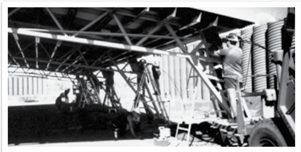
Strach hangar construction, Curtin, 1994 – The Operational Facilities Flight formed to retain works trades in uniform

Telecommunications Unit—grew to a strength of around 120 each as an Operational Facilities Flight (OFF) formed within 1 Operational Support Unit in April 1994 to retain the works trades in uniform. The Operational Facilities Flight provided an airfield engineering capability with detachments of works supervisors, carpenters, plumbers, electricians and general hands (later to become plant operators) at Tindal, Townsville and Richmond, with a Headquarters Flight at Townsville. 10 The Operational Facilities Flight leased or borrowed much of its equipment, particularly heavy plant, when it was needed for the numerous works they undertook to develop and maintain currency. 11 Mobile Air Terminal Unit (MATU) was transferred to Operational Support Wing from Air Lift Group in July 1997, while 323 Air Base Wing (Townsville) and Support Unit Butterworth transferred to Operational Support Group as part of the overall change of command for the Air Base Wings in 1996, though their roles were unchanged.