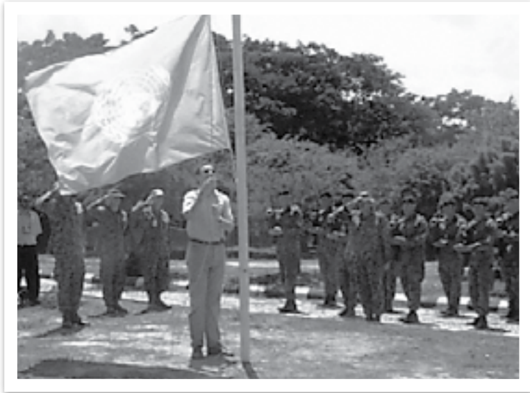
Change of the flag ceremony, Comoro, January 2000 – No 381 Expeditionary Combat Support Squadron was retitled as the CASG for transfer to the UN

after a fact-finding mission, two Portuguese companies were awarded UN contracts to maintain the airfield but it would take them well over a year to be ready. Meanwhile, 381 Expeditionary Combat Support Squadron was labelled the Comoro Air Support Group (CASG) in mid-January 2000, to prepare for the eventual withdrawal of INTERFET and transition to the UN, which occurred on 23 February 2000.