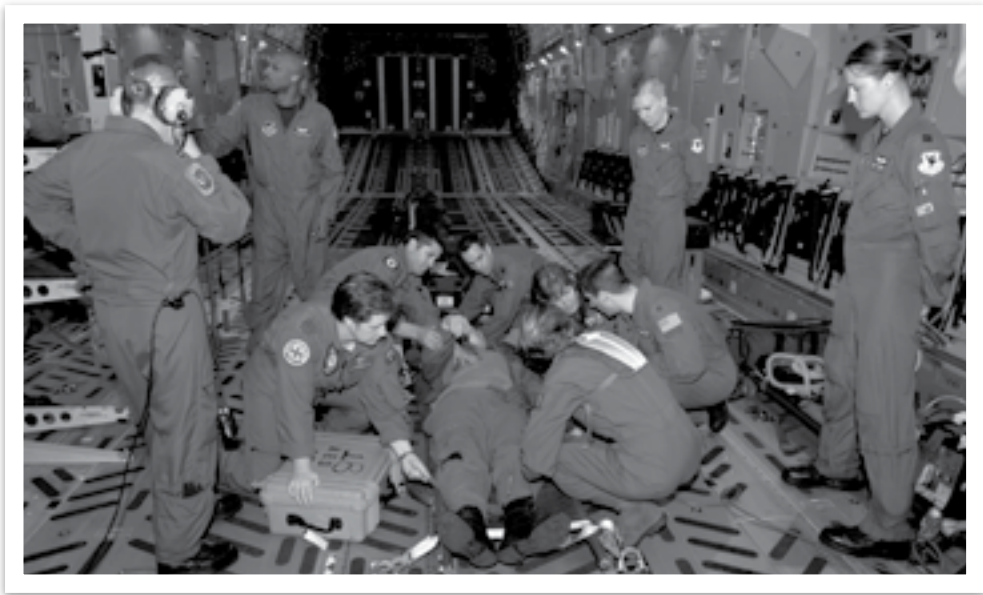
AME training on the C-17 for Health Services Wing with the US 18th Aeromedical Evacuation Squadron, Kadena, Japan, 2007