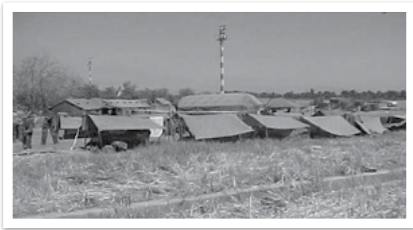
Early accommodation at Comoro, Dili, September 1999

(Images of East Timor – Air Component INTERFET) 11