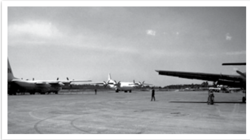
The Dili tarmac was always congested with a variety of aircraft types, Dili, c. August 2000 (From left: UN C-130, Antonov An-12. UN helicopter (far background), commercial airliner and Caribou)

trained on the civilian aids, with some long-distance help from Airservices Australia technicians. A later offer by the Indonesians to sell the equipment to INTERFET was rejected on the grounds that the Indonesians would soon depart and the equipment would remain. 22