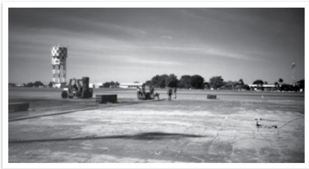
Laying AM2 matting, Darwin, with the landmark water tower in the background, 1994 – No 396 Combat Support Wing was formed two years after CSG to command the northern bases

The basic concept would endure but its implementation would prove to be a challenge, particularly the consolidation of personnel on a few bases to maintain their skills as the new Defence service provider groups assumed responsibility for home base services and support.