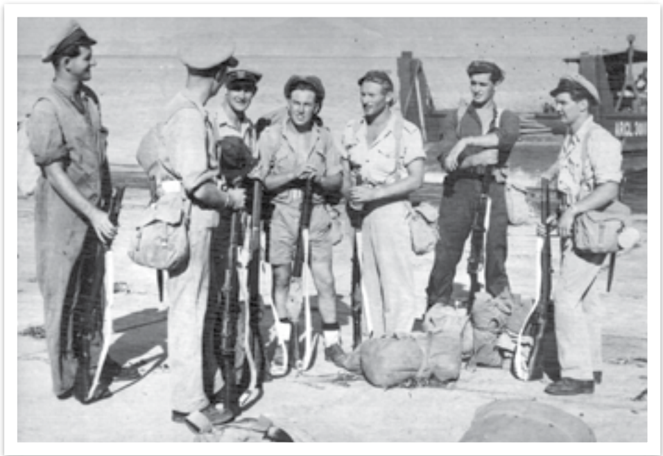
First arrivals in Japan with the Occupation Force, Bofu, 1945 – Base Squadrons replaced multiple units in the self-supporting wings of the postwar Mobile Task Force

Base Squadrons became the mainstay combat support unit of the Air Force for the better part of 40 years following World War II. The wartime specialist support units were disbanded with demobilisation, except for two of the Airfield Construction Squadrons, and the all too familiar Station Headquarters reinstated for command and the provision of all base support on the home bases. Base Squadrons, combining all of the support roles into a single unit, had an expeditionary role initially and just a limited tenure on the home bases.