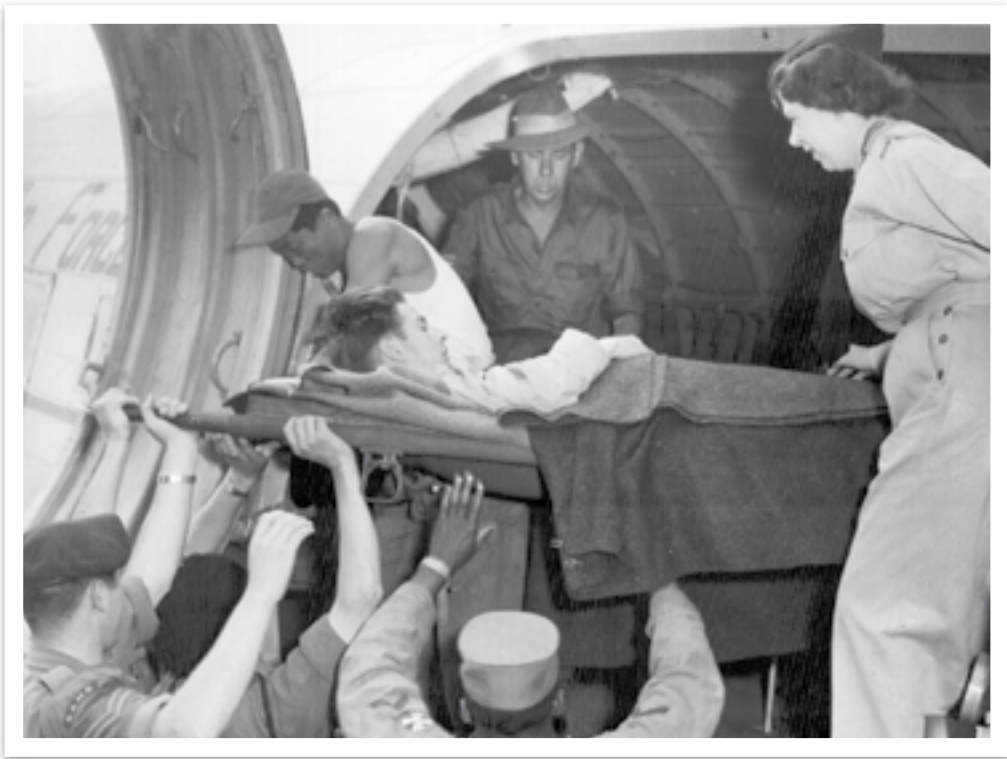
Loading aeromedical evacuation patient, Kimpo, Korea, c. 1953 – No 391 Base Squadron supported several national contingents in Japan and maintained two forward detachments in Korea