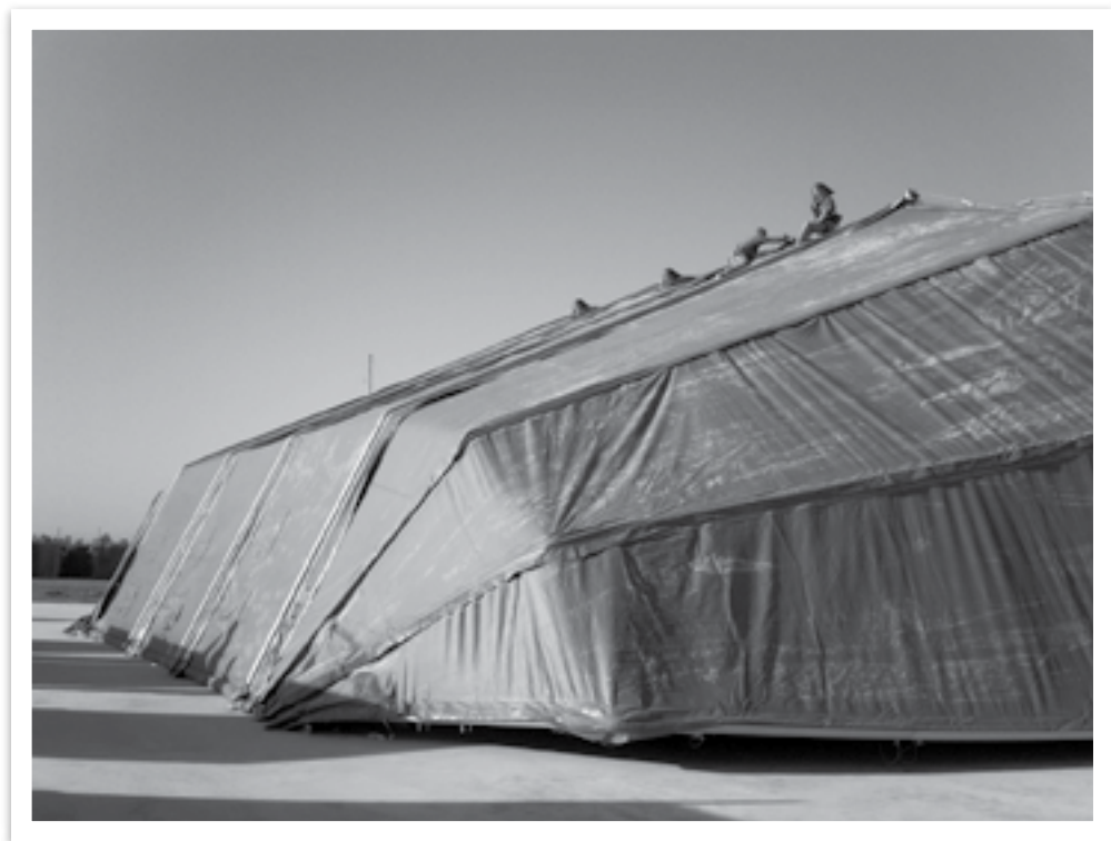
Unidentified tradesmen aloft on military shelter, Kandahar, Afghanistan, 2007 – Concerns over occupational health and safety regulations delayed the delivery of the military shelters