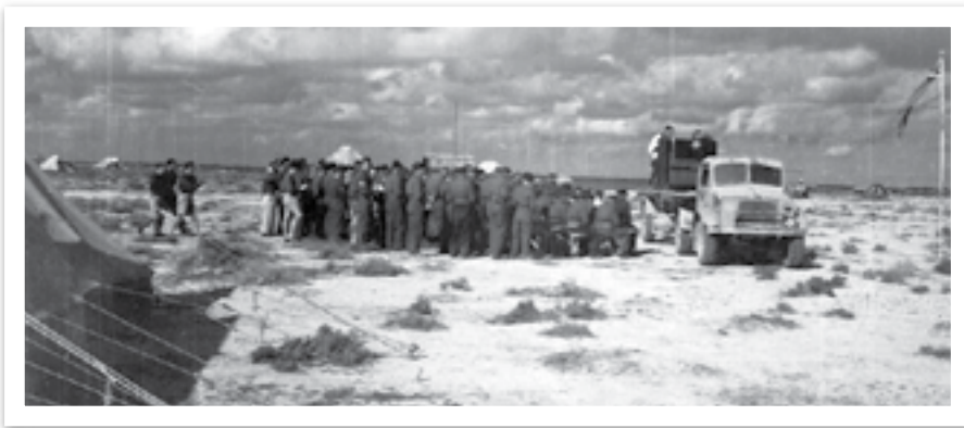
Christmas church service, Gambut, December 1942 – Chaplains raised morale among the airmen serving in the Middle East

One positive outcome of the 1942 initiative was an increase to the establishment of the Overseas Headquarters. Extra administrative staff, provosts and three chaplains were posted to London and Cairo, an indication perhaps that the initial offer in 1939 of a Base Depot as part of Australia's contribution to the Empire's air war effort may not have been such a bad idea after all. Indeed, the original offer of an expeditionary air force would have maintained an Australian and RAAF identity, impossible under the EATS arrangements, and would have been easier to administer and not dissimilar in size to the eventual contribution under EATS.