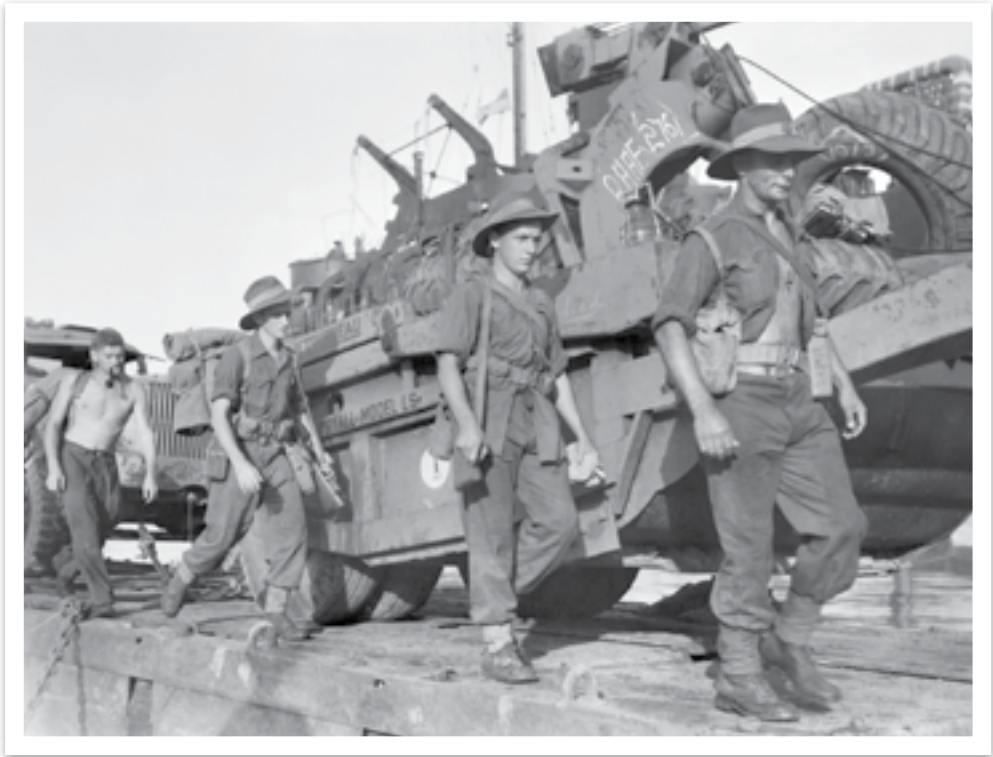
No 2 Airfield Defence Squadron and Airfield Construction Squadron personnel go ashore at Tarakan, Borneo, May 1945 – Airfield Defence Squadrons were formed late in World War II