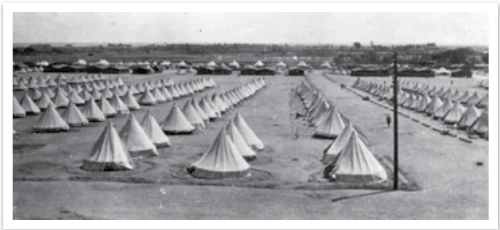
AFC base camp with airfield in the background, Middle East, c. 1917

the Commanding Officer of 3 Squadron, later described that ‘the Germans landed with their engine still ticking over, and appeared to be on the point of taking off again, when the situation was saved by the corporal of the guard, the only armed man in the vicinity, who ran up with his revolver and presented it at the head of the pilot with the order, “Hands up!” They did.’ 9