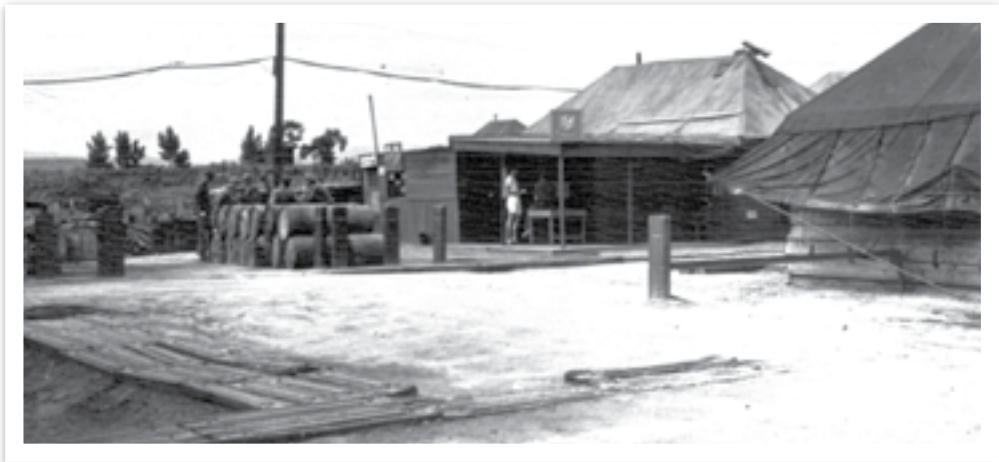
Forward area, Korea, c. 1955 – Field equipment was outdated and unsuited to the cold climate

Several factors compounded with the introduction of the Meteor from a supply support perspective. Firstly, unlike the Mustang and many of the other items of equipment such as clothing and tents, the Meteor was a British aircraft. Spare parts and munitions, sourced from the UK, were not available locally from the reliable US Fifth Air Force sources that had solved many of the previous shortages. The lines of supply were long and complex, from Britain to a RAAF Stores Depot in Australia and then to 391 Base Squadron in Japan for storage and eventual delivery on demand to 77 Squadron in Korea. Urgently needed demands placed on the Stores Depot would invariably suffer delays while the item was again placed on demand from the RAF in Britain. Eventually, in December 1953 after much dissatisfaction with the responsiveness of the supply chain, 391 Base Squadron became the RAAF master depot for Meteor spares, allowing higher stockholdings and the direct ordering and delivery of spares from the UK. Some spares, such as external tanks and some scarce armament parts, were obtained locally through Base Squadron raised and administered contracts for manufacture in Japan. Local contracts had also been raised for modifications to clothing and other personal-issue equipment sourced from the US or Britain.