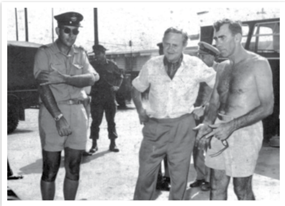
Prime Minister John Gorton visits 1 Operational Support Unit, Vung Tau, Vietnam, c. 1968 – 1OSU formed as a separate unit in Vietnam when the numbers at Vung Tau expanded

While 2 Squadron and its support flight remained relatively stable in size until withdrawn in 1971, the numbers at Vung Tau grew from an initial strength of 280 personnel in 1966, to 455 by August 1968. Base Support Flight responsibilities and strength expanded accordingly, from 82 to 169 (including a small number of RAAF Headquarters staff). In acknowledgement of its expanded responsibilities and increased size, Base Support Flight Vung Tau was retitled to No 1 Operational Support Unit (1OSU) on 19 September 1968.