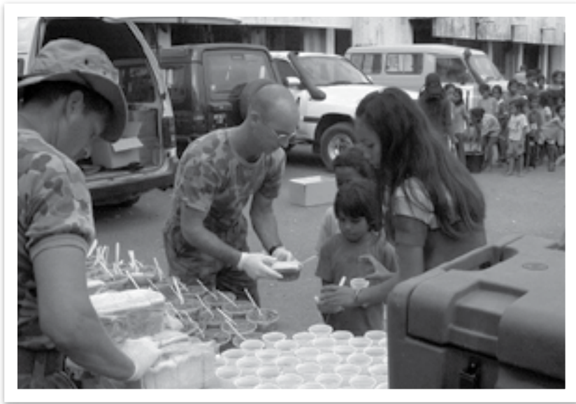
Meals for the needy, Dili, 2000 – Each of the CSG units in turn provided aid to the local community