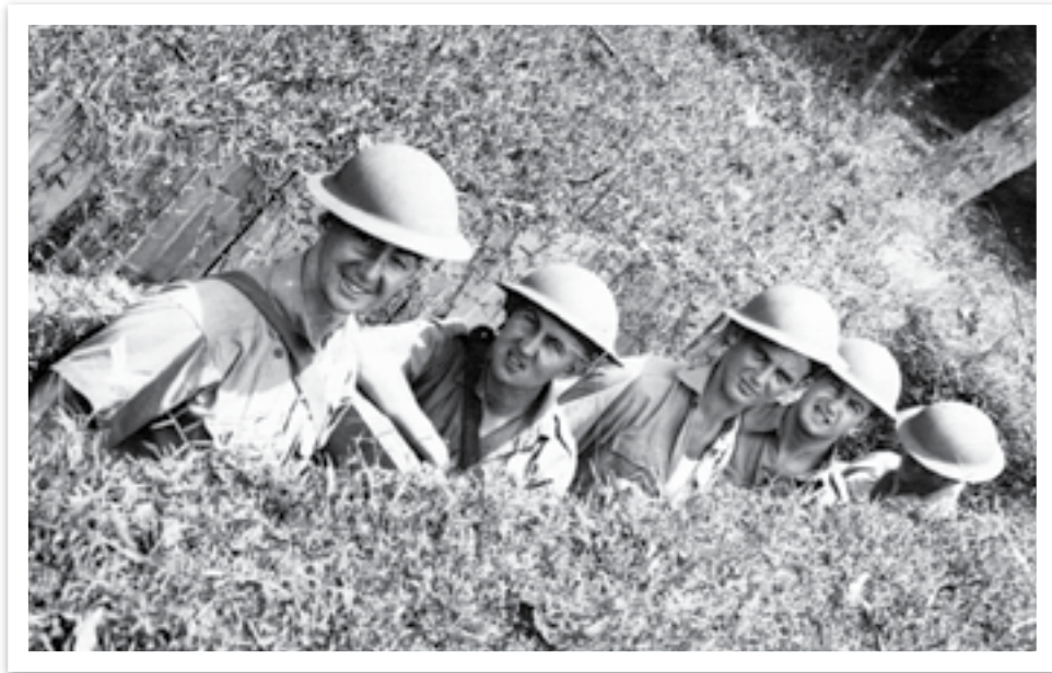
Slit trenches and dispersal reduced the damage for the RAAF at Singapore. The Station Headquarters was the first combat support unit sent overseas, Sembawang, c. 1941

administrative and equipment staff, on average less than 25 airmen, and were under command of the Station Headquarters for operations and support. Their operational effectiveness relied heavily on the efficiency of the station staff, especially when the airfield was under attack. 21