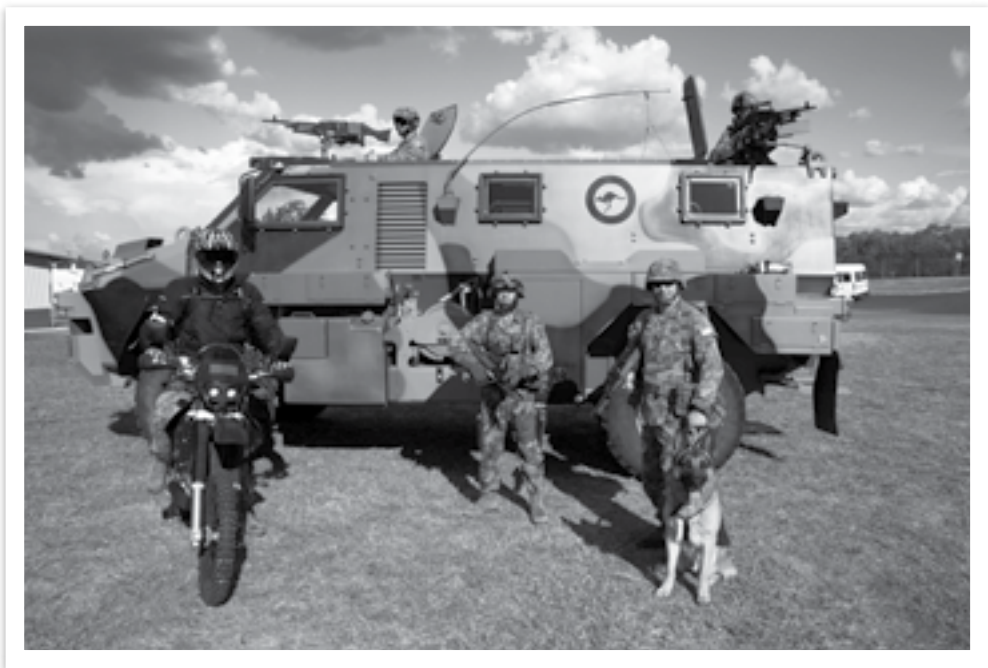
Bushmaster protected mobility vehicles were among the new equipment delivered by joint projects in 2007–08

A number of other major projects managed by the Defence Materiel Organisation delivered new equipment, or neared the delivery phase, for CSG during 2007–08. The Airfield Defence Squadrons received new Bushmaster protected mobility vehicles through Project Bushranger after a prolonged wait and extended use of interim solutions for most of a decade for the quick reaction force role and air base mobility of the airfield defence guards (ADGs). The first of the new ‘next generation’ Rosenbauer Panther aircraft rescue and firefighting vehicles, replacing the Trident vehicles, with potential for expeditionary use according to the Defence Materiel Organisation, were delivered in March 2008 with further deliveries expected through to 2009, in time for the arrival of the KC-30A aircraft later that year. Improved material handling equipment and mobile cranes were delivered under the Joint Theatre Distribution System project, while future field vehicles are due later in the decade under Project Overlander . This latter project will gradually replace the current fleet of Land Rovers and Mercedes Unimog medium trucks starting with the Amberley-based squadrons and, possibly, will eventually replace some of the commercial vehicles purchased as an interim measure under the CSG remediation projects.