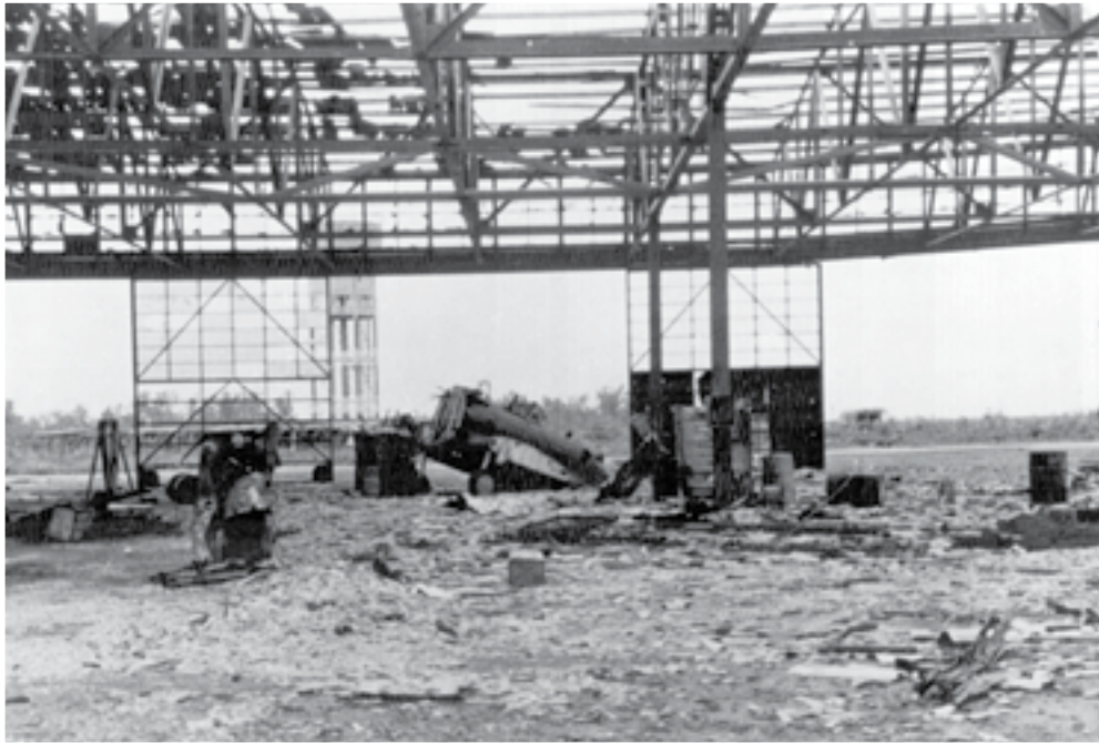
Damaged hangar at RAAF Darwin, with the landmark water tower in the background, 19 February 1942 – Darwin was ill-prepared for the bombings