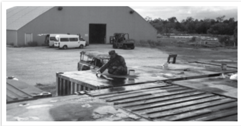
Bare base caches were upgraded and needed protection from the weather, Exercise Remote Trek , 1998

Portable accommodation buildings bought originally for expeditionary purposes, an air movements and medical sections, and associated cabling, wiring and plumbing were erected at Learmonth by 1 Combat Logistics Squadron during 2003–04, while funding was allocated for minor improvements at some of the main bases and the other bare bases. 16 The buildings erected at Learmonth, called ITSA (insulated tropical shed accommodation), were purchased to be stored until needed and were ideal for Learmonth which, despite recent upgrades, still lacked accommodation. The concept of holding buildings such as the ITSA in store awaiting a deployment was replaced by a ‘purchase or lease when needed’ concept. The remaining ITSA were in high demand and were eventually deployed to the Solomon Islands as accommodation for Operation Anode personnel, not to be returned to Australia.