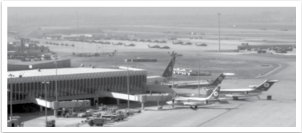
A hazy day at Baghdad showing the variety of traffic handled by the air traffic control detachment, with military aircraft in the background, June 2003