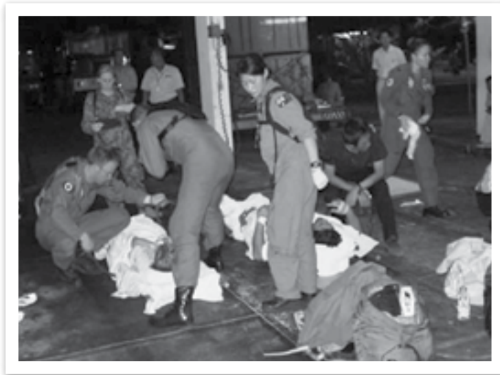
AME teams prepare patients for evacuation, Denpasar, Bali, October 2005 – Health Services Wing developed new concepts as a result of the Bali bombings

Bali was again subject to terrorist bombing on 1 October 2005, and again AME teams from Health Services Wing responded. Twenty-one patients with injuries as horrific as those suffered in the 2002 bombings were evacuated during Operation Bali Assist 2, in two C-130J flights to Darwin. Nine of the patients were further evacuated south to Williamstown after treatment and stabilisation in the Royal Darwin Hospital. 26