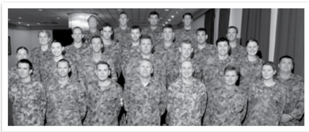
CSG provided one of two ADF EHC teams to assist evacuate Australians from war-torn Lebanon, Operation Ramp , 2007