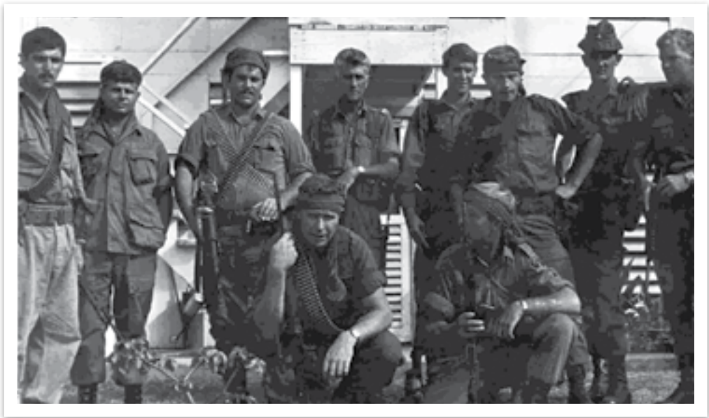
ADG Section (Watch-Dog 23) of 2 Squadron, Vietnam, March 1970 – Phan Rang was subject to frequent ground attacks

75 metres inside the perimeter, accompanied by a barrage of some 60 mortars and at least five rockets, injured 16 American personnel, destroyed two US fighter aircraft and damaged another fifteen. Again, on 22 February, at least 80 mortar rounds bombarded Phan Rang, injuring six USAF personnel and damaging 17 aircraft and base facilities. 25 Seven more attacks occurred through to the end of March with less damage. Other than minor damage to a vehicle and several near misses to buildings and aircraft, RAAF equipment suffered little damage throughout the indirect fire attacks, which continued sporadically until late 1970. 26