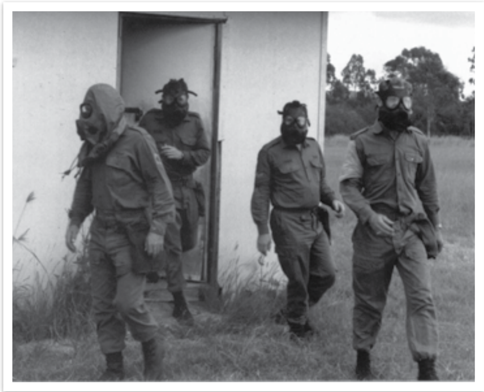
Nuclear, biological and chemical defence training, Exercise Green Exposure , Toowoomba, 1989 – Shadow-posted personnel supplemented 1 Operational Support Unit for expeditionary support during the 1980s

any prolonged period without a long preparation and warning period, could be questioned.