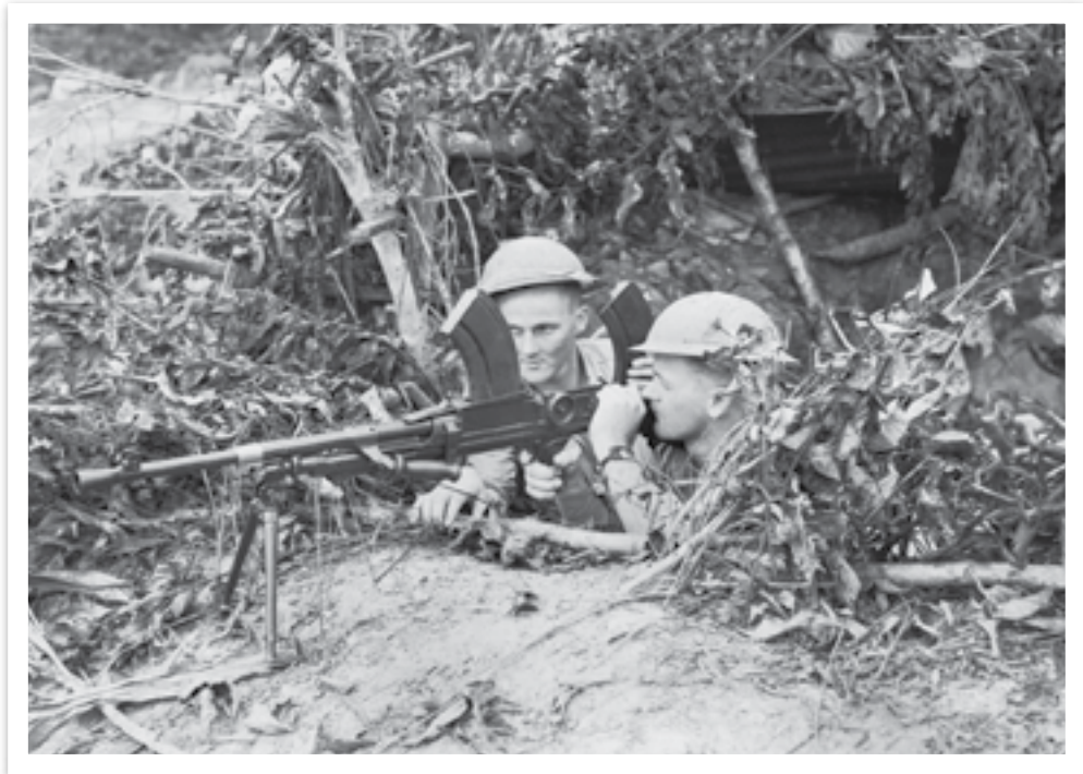
Bren gun crew, Noemfoor, August 1944 – Ground attacks on the bases were frequent during the Oboe operations on Borneo

In the latter stages of the war during the Borneo operations, Japanese soldiers made numerous desperate attempts to inflict damage on airfield and construction equipment. Nightly attacks by ground parties occurred on the airfield at Tarakan during May 1945, with occasional shelling by 75 mm guns and air raids, but with little damage. Ground attackers were usually armed with grenades, fuzed shells or bombs and knives, rarely with small arms. Under these conditions, floodlighting of cleared lines of fire on the perimeter and approach paths, combined with defensive posts each manned by four men with machine guns, was most effective, although some attackers still penetrated the perimeter.