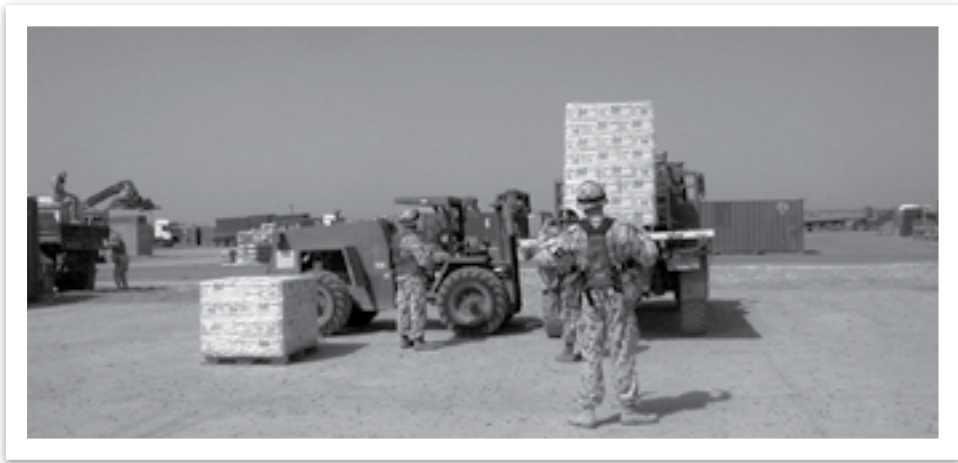
Unloading stores in the Middle East, 2004 – CSG provided national support and supplemented Coalition base services for Operation Falconer

There is little sense in a direct comparison of the INTERFET and Bastille/Falconer operations because they are quite different, even for CSG which was far better prepared for operational deployments by 2003. Coalition air bases were used in the Middle East and thus the more demanding tasks of establishing and commanding the air base, overall air base protection, airfield movement areas and infrastructure maintenance and similar air base tasks were not an Australian responsibility. But Falconer was an air war with more demanding air combat squadrons to support. The preparation time was much greater for the Middle East deployments and the bases were located away from the combat zone, although the potential threat, even on the ground outside of Iraq, was equally as high albeit more difficult to define.