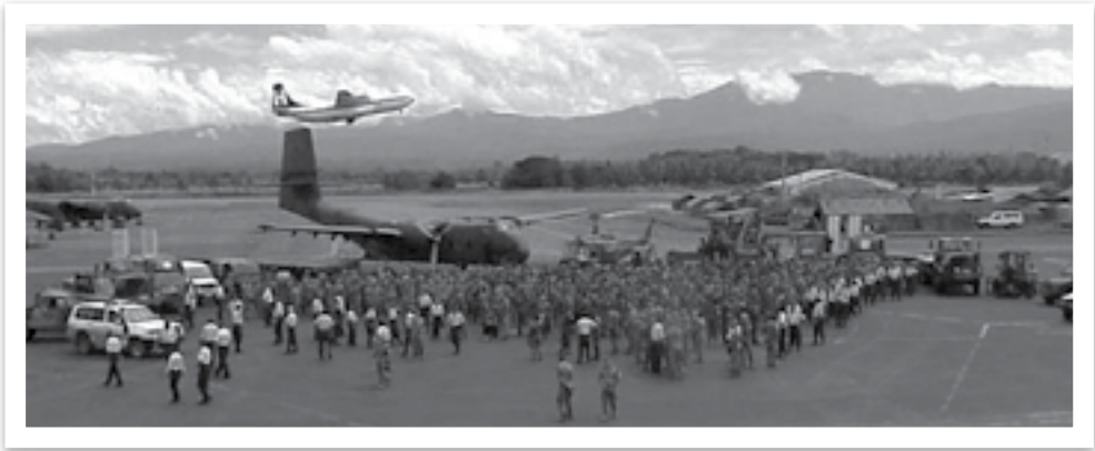
On the tarmac at Henderson Field, Operation Anode , Honiara, c. 2004 (the personnel in light-coloured shirts are Australian Federal Police officers) – The Expeditionary Combat Support Squadron domestic area is to the rear right

(No 395 Expeditionary Combat Support Wing)