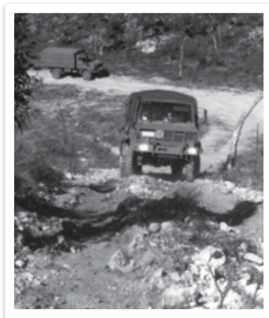
Driver training with the new Unimog trucks, Wide Bay, QLD, 1988 – Joint projects updated field equipment from the late 1980s

Equipment was held centrally by 1 Operational Support Unit (Air Transportable Telecommunications Unit for communications equipment) and was adequate for the short-duration training exercises when sustainment and thus more substantial facilities and infrastructure were not a consideration. The tactical vehicle fleet, though small as it was established under the earlier concept of a single Airfield Defence Squadron and an expanded 1 Operational Support Unit, and not four Contingency Air Base Wings, was modernised under Joint Project Perentie in 1988 with new Mercedes Unimog medium trucks providing a badly needed self-lift capability and new Land Rovers to replace the ageing fleet of Toyotas following a year or so later. Operational Support Group's deployable airfield fire and rescue capability was upgraded in 1996 when the Titan fire vehicles replaced the ageing Oshkosh trucks. The larger portion of Operational Support Group's vehicle fleet, known as the Deployment Support Fleet, was on a semi-permanent loan to the main bases for their everyday use and recalled when needed for deployments. Although an effective use of resources that would otherwise have sat idle, the downside was that maintenance of the vehicles was a low priority for the bases and vehicle serviceability was often poor. There was a large overhead too, in managing the scattered fleet of vehicles and their frequent movement for deployments.