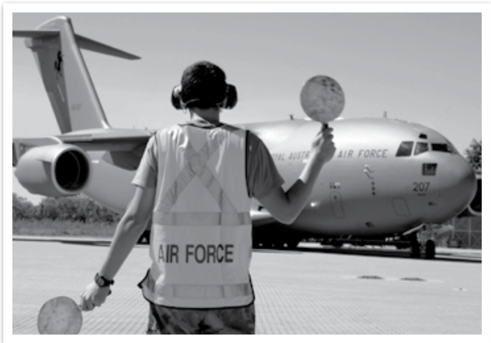
No 1 Air Operations Support Squadron marshaller, May 2007 – The C-17 and other major equipment plans caused the Air Force to rebalance and reshape for the future