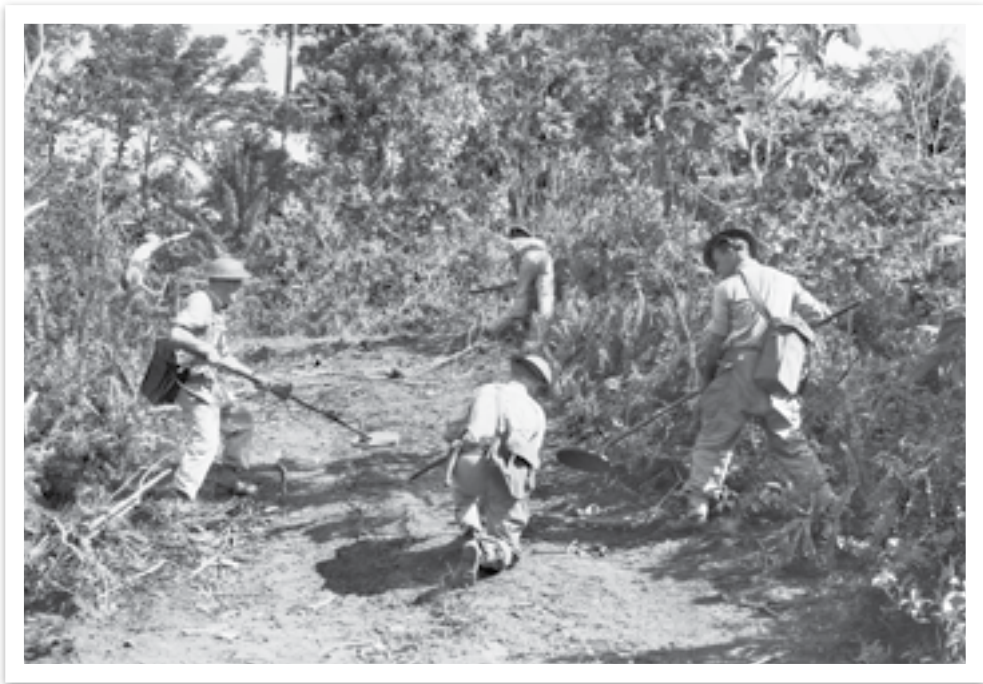
Clearing the airfield road with protection party, Noemfoor, PNG, November 1944 – Bomb Disposal Units worked as squads attached to other units

(Australian War Memorial Negative No. OG1744)