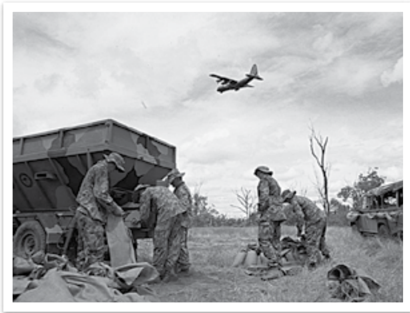
Filling sandbags, Exercise Northern Awakening , Scherger, 1999 – CSG’s training needs were met through the Northern series of exercises