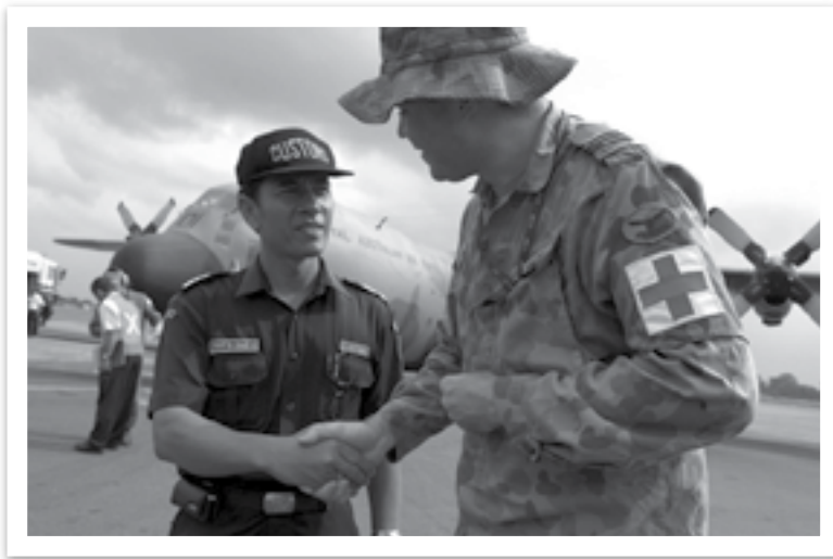
Health Services Wing medical staff deploy to Sumatra following the Asian tsunami, 2004 – No 3 Combat Support Hospital was part of 395 Expeditionary Combat Support Wing until Health Services Wing formed in December 2001

Squadron, as did every CSG specialisation to differing extents. The downside of specialist units, even when part of an Expeditionary Combat Support Squadron, was that they sometimes had difficulty in assimilating with their deployed unit and breaking the strong command links to their home headquarters, though that was a small price to pay when compared to the confusion becoming evident on home bases where unity of command had been overlooked. In reviewing the command arrangements on the main bases soon after his appointment as Chief of Air Force in June 2001, Air Marshal Angus Houston made it quite clear that the Air Force would continue to adhere to the basic organisational tenet of 'structure for war' and directed a review of the main base organisation to address unity of command. 39