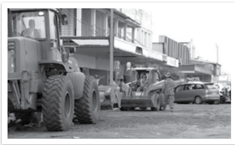
Helping to clean up Innisfail after Cyclone Larry, 2006