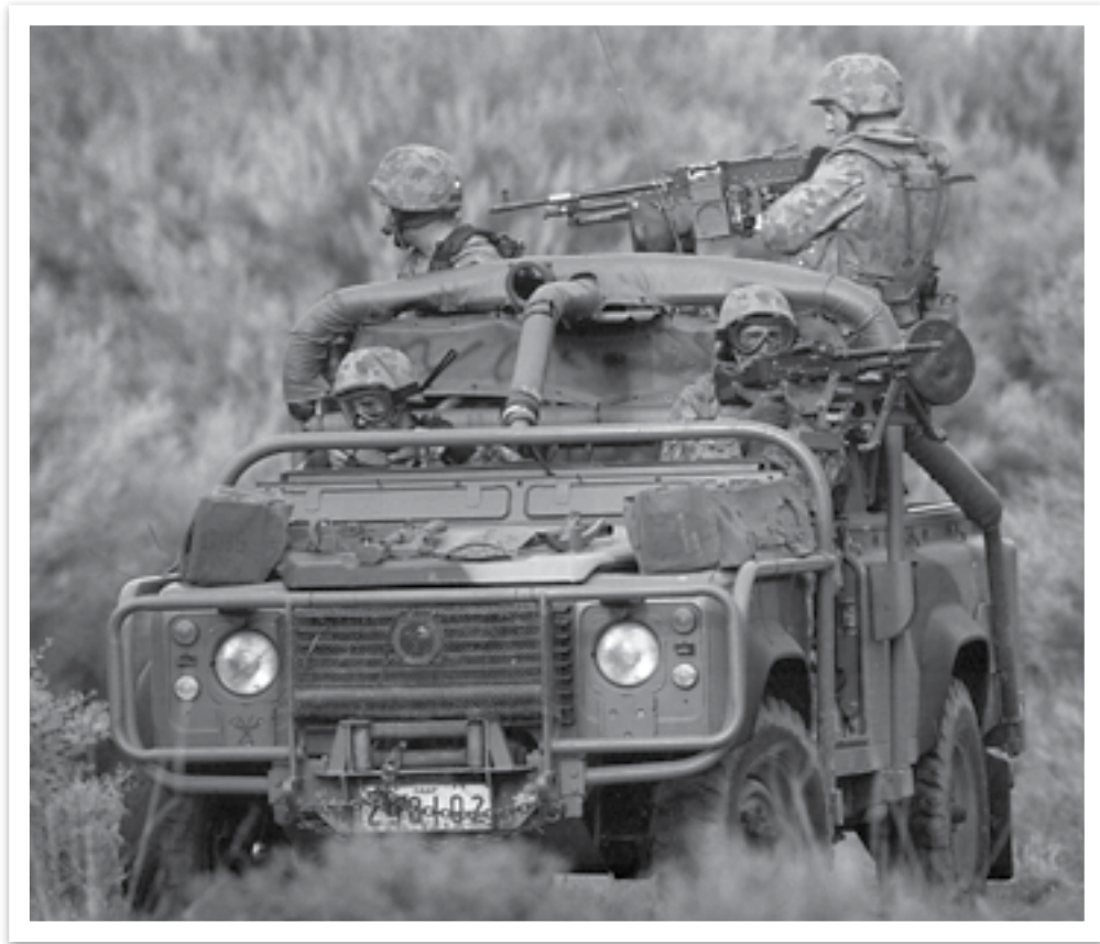
Airfield Defence Wing practised joint air base protection on Exercise Winter Sun , Quilpie, 1998

headquarters responsible for all of the planning and conduct of the unit exercises and the ongoing joint exercise program, there was little time spare to write instructions. 40 In lieu, 395 Expeditionary Combat Support Wing published an interim pocketbook ready reference to aid combat support executives with the relevant doctrine and procedures.