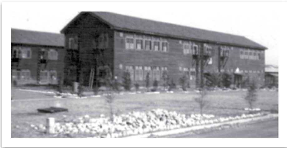
Bofu barracks, Japan, c. 1946 – No 381 Base Squadron personnel lost their personal belongings in a barracks fire soon after arrival in Japan

Neither 386 nor 378 Base Squadron reached close to even half of their personnel establishment before disbandment in April 1948 (No 378) and March 1949 (No 386), each re-forming as a Station Headquarters. 4 At Amberley, where 82 Wing had moved in April 1946, No 3 Aircraft Depot in lieu of a Base Squadron provided base services until the Station Headquarters formed in 1947. 5 The preferred organisation of permanently established, self-supporting wings never developed much beyond a concept, at least so far as standing self-support was concerned. For future deployments, and there would be quite a few, Base Squadrons were raised to purpose and manned with personnel drawn from across the Air Force.