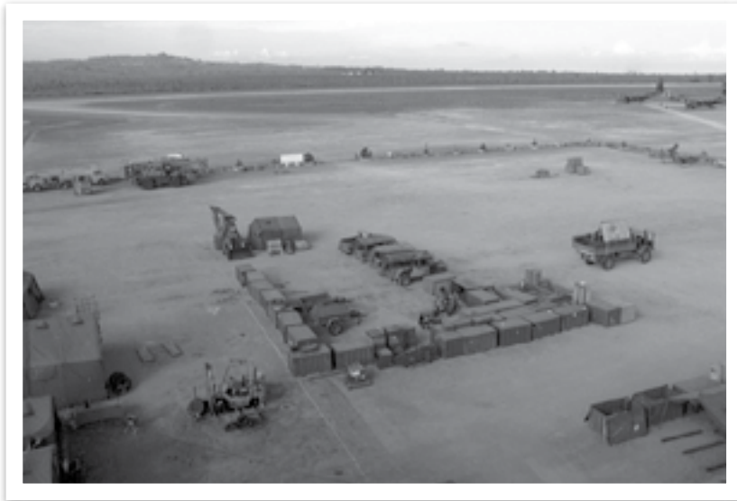
Baucau offered greater tarmac space and a longer runway, November 1999