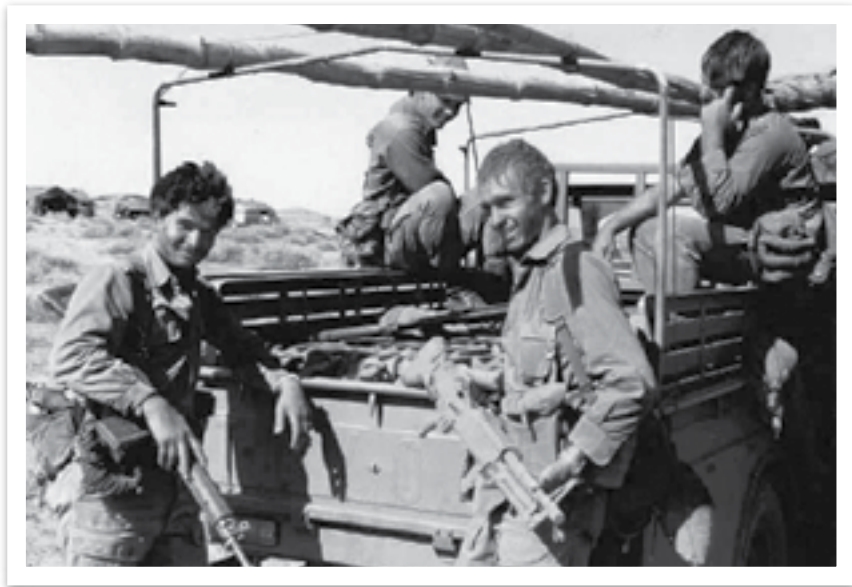
No 2 Airfield Defence Squadron personnel, Exercise Kangaroo 83 , Roebourne, WA, 1983 – The squadron was re-formed from independent defence flights of the Base Squadrons

Lessons from the joint exercise program and a growing need to operate as a formed unit rather than dispersed flights resulted in No 2 Airfield Defence Squadron being re-formed in March 1983 under the command of Squadron Leader J.B.H. Brown, also at Richmond. Like the remainder of the support force though, 2 Airfield Defence Squadron remained dislocated from its Rifle Flights at Williamtown, Amberley, Fairbairn and Richmond until 1989, when all flights and the Squadron Headquarters were collocated at Amberley.