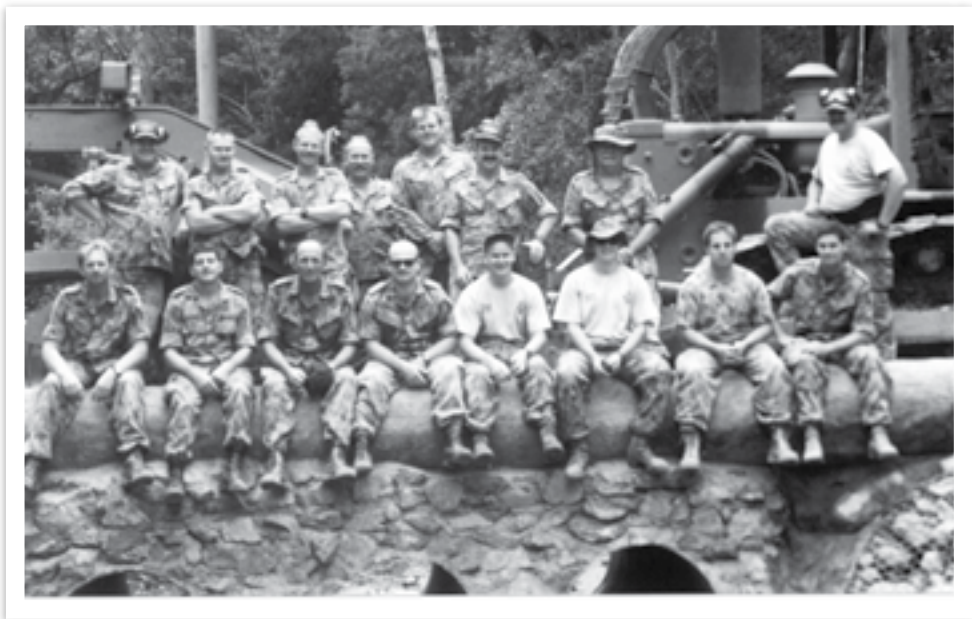
Building bridges, Bluewater training area (Townsville), 1997 – DRP fundamentally changed the Defence organisation

Combat support replaced operational support as the Air Force term to describe forward or deployed support to give added emphasis to the role and to identify it clearly as a combat related function. Although DRP always considered Operational Support Group and its function as part of the combat force and never once considered it for outsourcing, it was less than convinced about the shadow-posted units where the larger numbers lay. While Air Force, throughout the MRU and CAP studies, had based its numbers on the 'Defence of Australia' concept, new government strategic guidance released in the 'Strategic Review 97' document placed an increasing emphasis on deployment for the lesser task of 'forward cooperation' with minimal rotation thus requiring substantially fewer numbers than the MRU had determined. The difference, around 2000 (nearly all in base support), would be made up from the Reserve or recruited, trained and qualified in the longer warning period expected for any attacks on Australia. 18