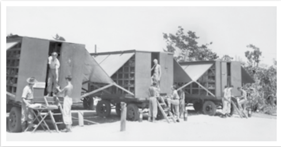
Mobile stores, probably of 25 Air Stores Park, at Noemfoor, PNG, October 1944 – Mobility improved with some hard-learned lessons