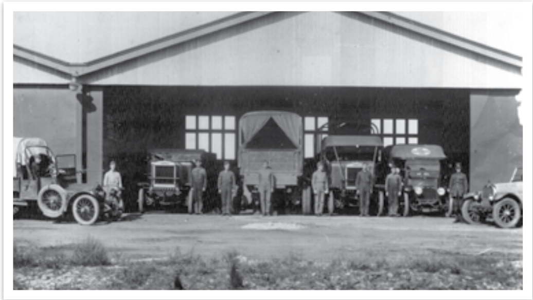
Motor Transport Section, RAAF Point Cook, 1928

Army and Navy cooperation exercises, usually conducted from established bases or barracks, were frequent in the 1930s, particularly in the latter half of the decade. Training deployments to forward bases for operational or war training were almost unheard of, although No 1 Squadron deployed to Cootamundra for two weeks under field conditions during 1935. No 3 Squadron had organised an Aerodrome Defence Section from its ranks as early as July 1931 and conducted a field exercise to Scone in November 1937. 17