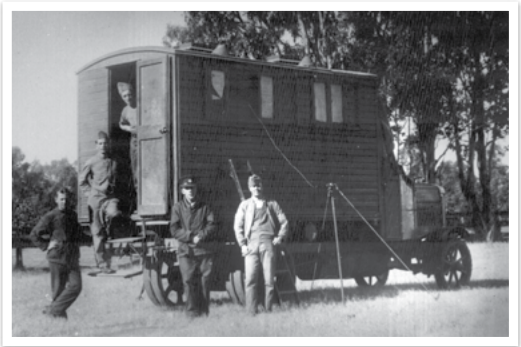
Mobile radio workshop, late 1920s