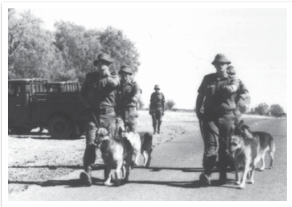
ANZAC Day 1986, Exercise Pelicans Progress , Windorah, QLD – Air Transportable Telecommunications Unit, 2 Airfield Defence Squadron and 1 Operational Support Unit operated independently until the Force Element Groups formed in 1988

Command arrangements for each of the deployable support units—Air Transportable Telecommunications Unit, 1 Operational Support Unit, 2 Airfield Defence Squadron and Mobile Air Terminal Unit—differed, either to Air Force Headquarters, Operational Command or to their home Base Headquarters. While they shared a great deal of synergy in operations at forward or bare bases, they had few opportunities to train together outside of the major exercises and there was no centralised development of their capabilities or standardisation of the quite comprehensive procedures that each of the units had developed. Not until the introduction of Force Element Groups in the late 1980s, around the time that Operational Command became Air Command with operational responsibility directly to the Chief of the Defence Force, did the synergies begin to be realised. All of the deployable support units except for Mobile Air Terminal Unit, which transferred to Air Lift Group, came under the single command of the new Tactical Transport Group from June 1988, but it was by no means the ideal command relationship and it had little time to mature.