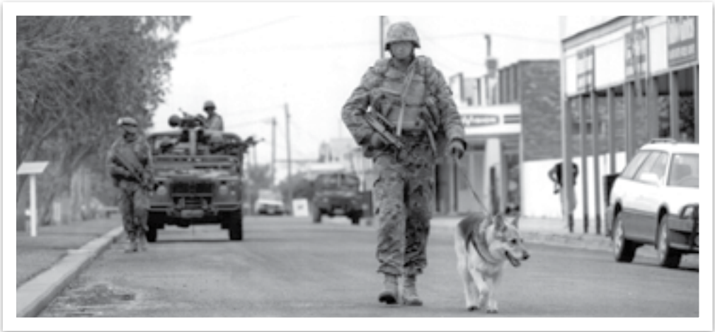
Personnel of 2 Airfield Defence Squadron patrolling through town, Quilpie, QLD, 1998 – Military working dogs joined ADG patrols under the military working dog rejuvenation project in the mid-1990s