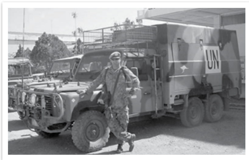
Unidentified fitter of the CASG with maintenance vehicle in UN markings, Baucau, c. September 2000 – Baucau was activated from Dili after 382 Expeditionary Combat Support Squadron withdrew

Additional firefighters with three Titan fire vehicles deployed from Australia to supplement 383 Expeditionary Combat Support Squadron at Baucau during August 2000 for several wide-bodied aircraft movements during UN force rotations. Two Security Police investigators served with the Army's Military Police on crime scene investigations, assisting to exhume bodies for further investigation and with interviews of suspected militia members. Military working dog teams served with Australian infantry battalions deployed to the western border regions near Maliana and Balibo during 2001 and 2002, employing the dog tracking skills developed with Airfield Defence Wing around air bases over the preceding decade. A number of other CSG specialist staff, ranging from cooks to electronics technicians, clerks, works supervisors and tradesmen, deployed to the Australian National Command Element (ASNCE) and other joint units.