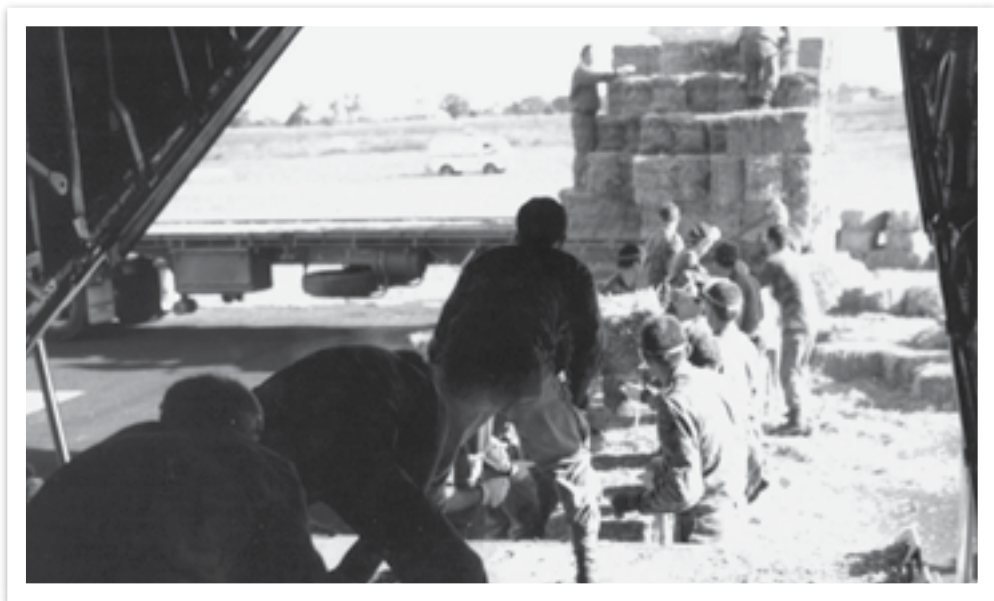
Loading fodder for airdrop, Narromine, c. 1994 – The challenge was to maintain a balance between expeditionary and fixed base support needs

Operational Support Group briefing teams were dispatched to mobilise units at their home bases when Townsville was discounted for concentration on future bare base exercises. Executive tutorials and command post exercises (CPXs) too became part of the annual training program, while basic instructions were published as a guide for unit executives. But the problem was more fundamental than procedures that could be addressed through standing instructions, briefings or even training. It lay in the concept of part-time units and the commitment to two jobs for much of the deployable workforce, a dilemma that had existed since the end of World War II.