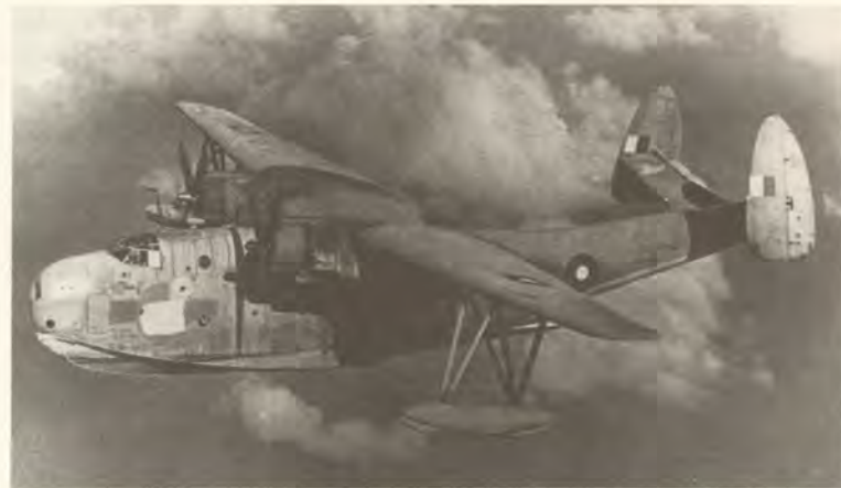
The last 12 Martin Mariner PBM-3s. A70-12 delivered early 1944 to No. 41 Squadron, still in its well-worn US Navy blue-grey colour scheme. As each Mariner underwent a major inspection it was painted matte jungle green.

We are having some bonzer weather, the heat being tempered by an off-shore breeze and the nights are mild. We have to sleep under nets as there are a few mozzies around, even though the area is now supposed to be malaria-free. I saw a picture-book sight today: two pearling luggers with all canvas spread and a crew of fuzzy-haired islanders sailed up the estuary.