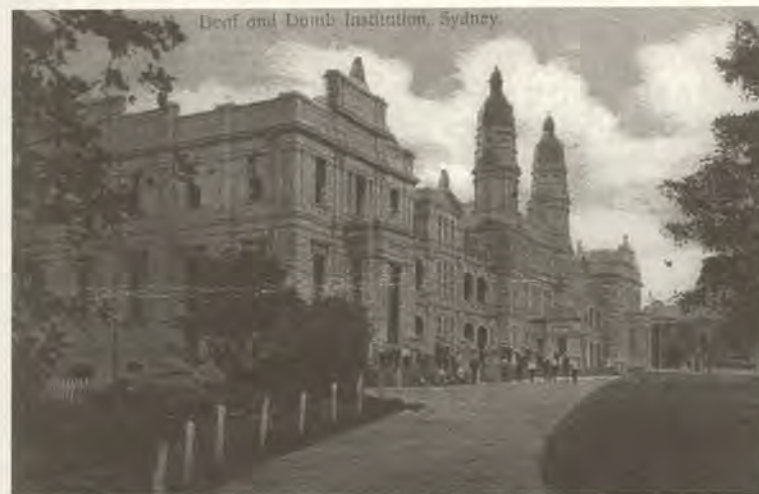
An early photograph of the NSW Institute for the Deaf and Dumb and the Blind in City Road, Darlington, an inner Sydney suburb.

We are now quartered in the old Institute for the Deaf, Dumb and Blind in City Road, Newtown. I am on the top