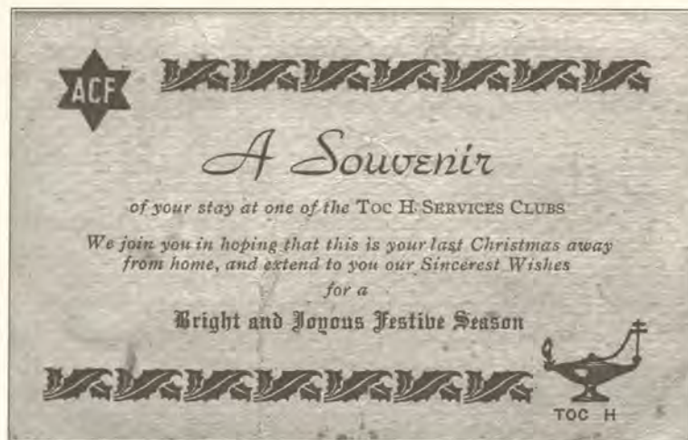
Souvenir of the last war-time Christmas dinner.

There has been a good song going round camp about the Catalina flying boats which used to be based here, sung to the tune of "The Daring Young Man on the Flying Trapeze". I managed to scrounge a copy and will enclose it.