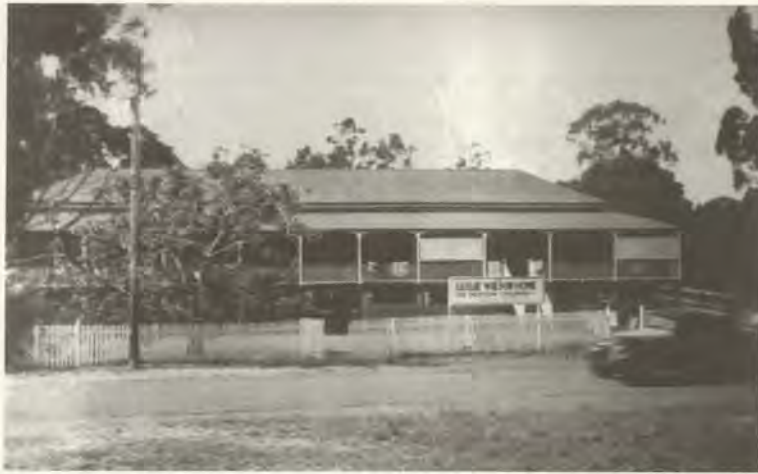
The Sir Leslie Wilson Home for Western Children, Torquay, Queensland, used by RAAF as a convalescent home, then as a leave centre.

An RAAF chap said he and some mates had been kicked out of a compartment leaving only three Yanks in it, so I guess they had given the conductor a good tip. We had to wait 45 minutes just out of Brisbane for a hospital train to go through.