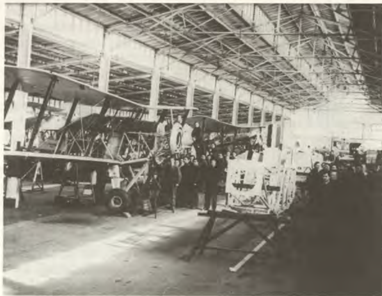
Westland Wapiti aircraft in Rigging Section, No.1 Engineering School, Ascot Vale Showgrounds.