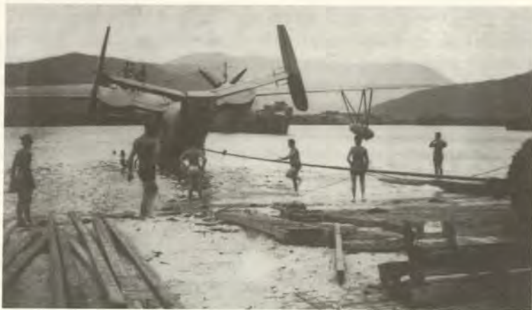
Beaching party preparing Martin Mariner A70-11 for slipping, Trinity Inlet, Cairns. US Army Landing Craft Infantry in background.