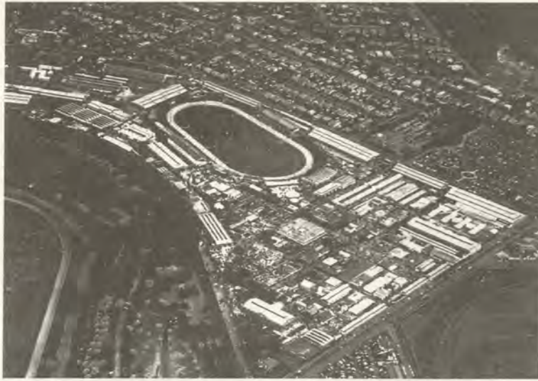
The Royal Agricultural Society of Victoria Showgrounds at Ascot Vale, as they were for the first post-war show, 1946.

Albury's flies. The Victorian train looked almost antiquated, and the country down to Melbourne was mostly dead flat and monotonous. We arrived at Spencer Street Station at 2.45 p.m., very hungry and travel-weary.