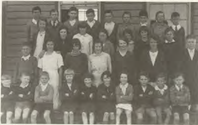
Clybucca Public School pupils. Author is back row, third from left.