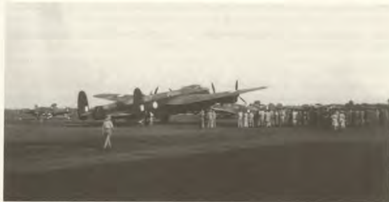
Avro Lancaster, Q-Queenie, at Maryborough on Victory Loan Tour.

By the end of March 1944, the 43 Wacketts on strength had been joined by 8 Avro Ansons, 5 DH84 Dragons and a Tiger Moth which flew, in order, 1,629, 109, 260 and 18 hours for the month. Earlier in that month, 117 trainees had been posted to No.1 Embarkation Depot and 23 arrived to begin No.48 WAG Course. On 17 April there were two forced landings when A3-71 force-landed near Pialba due to engine failure, and