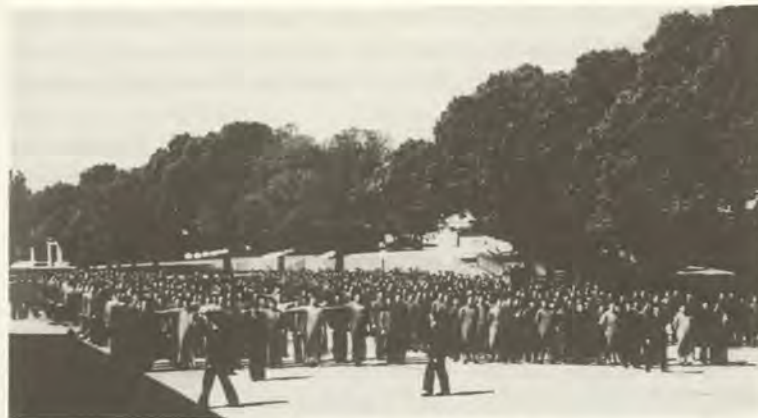
Morning roll-call parade in car park, Flemington Racecourse. Book-makers' stands at rear.

Yesterday we had to parade in our best blue uniform for over an hour at lunch time. Then, at 4.30 p.m., there was another "blues parade", on a closed camp night when all we can do is get undressed again! It began to rain, so all the boys just walked off and beat the Sergeant to the main gate before he could close it on us. Then we were supposed to stand by our beds at 6.15 p.m. for an inspection, but at 6.15