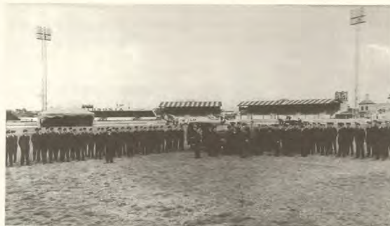
Presentation of an ambulance purchased with money raised by trainees at 1 ES, c. 1944.

We have finished the first phase of the course and I came just about top, with a 78% average and got 81% for the spanner, so you can bet it will fit the nuts neatly. We are now in theory of flight, where we learn about the Wirraway, Kittyhawk and Beaufort. I like the theory and as I have a good memory and have had more practice than the others at exams, there is no excuse if I don't do well.