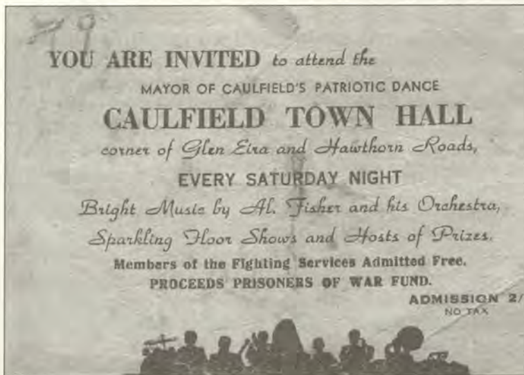
Services free pass to one of many Town Hall dances in Melbourne.

I can stand the Yanks so long as they don't start on that "we've come here to save you" business.