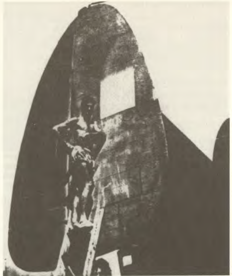
Author inspecting fin and rudder during 240-hourly inspection of A70-11 on the slipway.

The war in Europe is very close to the end, with one million German troops in north-west Germany, Holland and Denmark surrendering to "Monty" [Field Marshal Sir Bernard Montgomery]. Peace negotiations are going on in Czechoslovakia and Austria, as well as in Norway. Hitler's