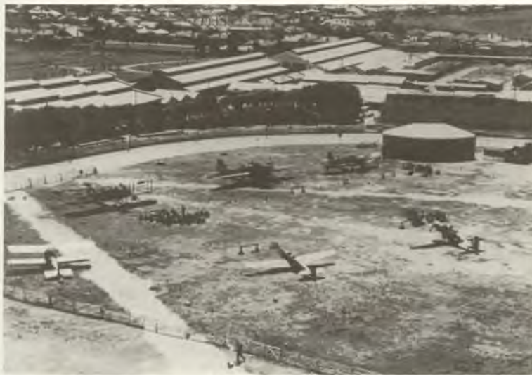
In Maintenance Phase trainees practised starting (from lower left) Avro Cadet, Westland Wapiti, Fairey Battle, CAC Wirraway, Wacket trainer, Moth Minor. The cattle pavilions in the background were used as barracks.

The Corporal sits in the cockpit and says, "Switches