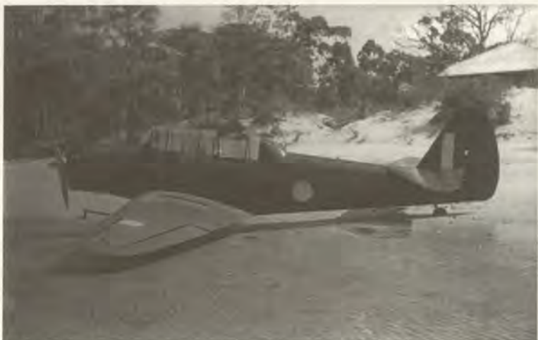
Wackett A3-200 (last to be manufactured) after forced-landing on beach at Hervey Bay, Queensland.

forced landing on a beach only 5 metres wide, ran into the sea. A3-195 was involved in a landing accident on 16 May. Accidents and tragedy were not confined to the sky and the roads; on 5 August, a Sergeant fell down dead in the Sergeants' Mess.