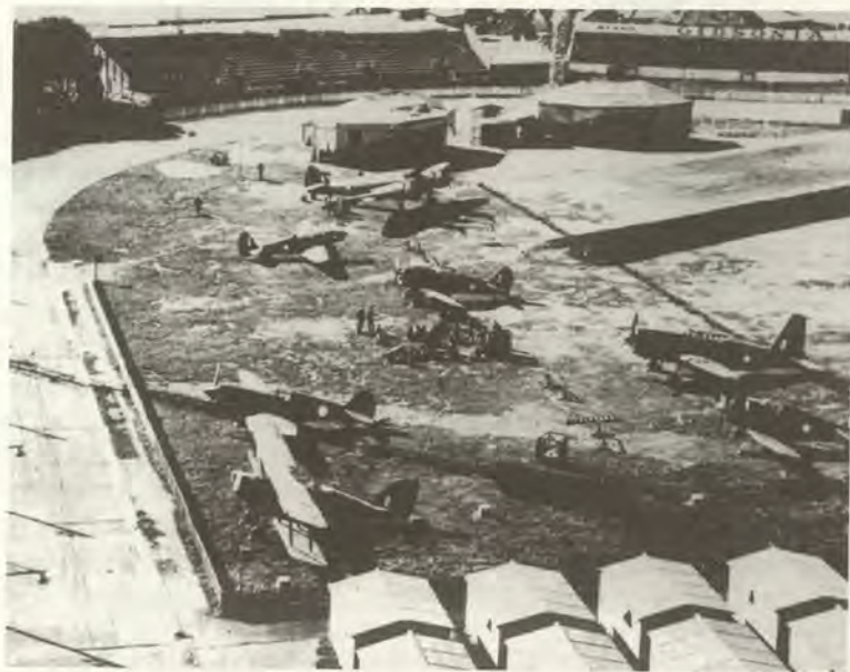
By 1944 some current operational aircraft had replaced obsolete pre-war aircraft. Clockwise from lower left: Westland Wapiti, Curtis P-40 Kittyhawk, CAC Wirraway, Wackett trainer, Bristol Beaufighter, Vultee Vengeance, CAC Boomerang.

Strangely enough, the little I did know about Melbourne and Victoria came from listening to the powerful AWA radio Dad had bought in 1938. With its long, high, outside aerial, we could clearly pick up the Melbourne stations, 3DB and 3LK, "The Herald Stations", and on Saturday night listened to live dance music on 3DB. At school, in geography, I had learned the names of the north-flowing tributaries of the Murray River, knew that brown coal was mined at Yallourn and black coal at Wonthaggi, and that fruit was grown in the irrigation area at Shepparton. In history, I had learned that John Batman had paid the aborigines for the site of Melbourne with blankets and trinkets, and that Surveyor Mitchell, the explorer, had discovered "Australia Felix" in the west. I had