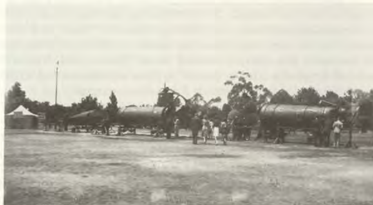
A Japanese midget submarine assembled from the parts of two sunk in an attack by three in Sydney Harbour, 31 May 1942, on display in Melbourne, January 1943.

sunk. Having nothing else to do, we went out to what is called The Power House Club, which on Sunday afternoons has dancing and free meals, with big salads, ice-cream, cakes and tea. The Melbourne people would do anything to make the boys feel at home. They must give up a good deal of their time. The girls at the Power House all have to be specially selected for it, so they were an extra nice lot. It was formerly a rowing club on Albert Park Lake, right in the city. By queuing up at Kodak's I was able to get a film, so will send you some photos of the city, so you will know where I've been.