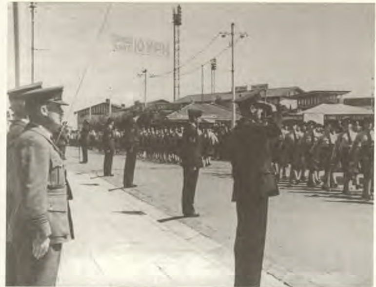
WAAAF march past saluting base, No.1 Engineering School, with a smart "eyes right" to the Commanding Officer.