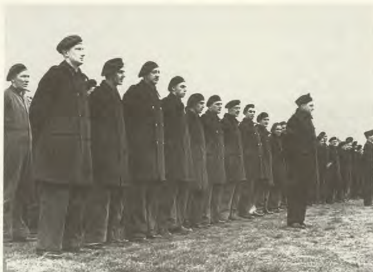
A mid-winter parade on the Showgrounds Main Arena.

I have been buying morning and afternoon papers in anticipation of invasion news in Europe, but it is all quiet apart from a landing on Pantellaria. Newspaper boys come right through the camp, even into the toilets in case they miss someone.