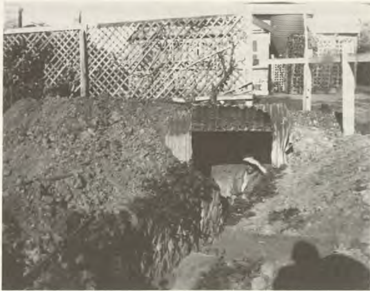
Air raid shelter in backyard of 92 Taylor Street, Armidale, NSW, built by student boarders during the "big panic", June 1942.

yard which we hacked in half vertically to form the roof over a four metre long by one and a half metres deep slit trench. By crouching and huddling over each other's backs we found that we could all just squeeze in to it. Goodness knows why the Japs would want to bomb Armidale, which was known as the city of schools and churches, unless they had heard of our contribution to the war effort at the Teachers' College.