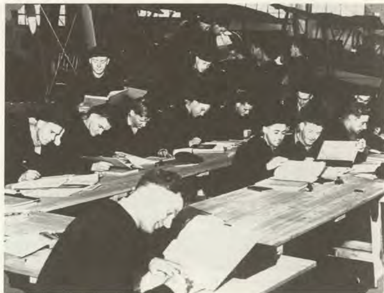
Trainee flight riggers in Theory of Flight classroom (poultry pavilion) with Tiger Moth instructional aircraft. The NA-16 Wirraway prototype, also used as an instructional airframe, is just visible, top centre.

Our instructor is very good, and a hard case, and the boys are always side-tracking him. He told us that when we get to the maintenance phase and have to start the planes out on the arena, we will need a change of underwear afterwards. Some of the boys are finding the theory a bit hard to pick up, but I have a good start with what I learned building models.