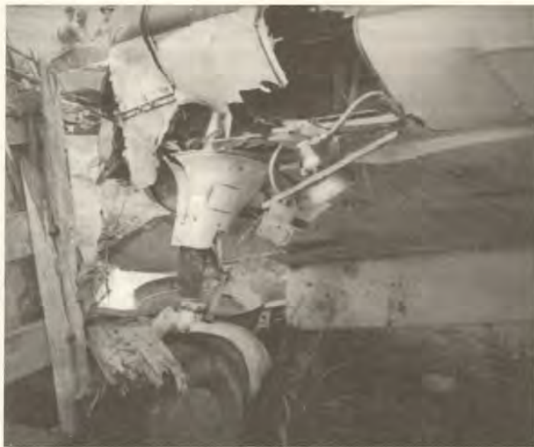
Result of Wackett collision with farm gate-post after forced-landing, Mary River area.

tonight was stew, turnip and potato and a watery soup. I have lost over eight pounds since I left Melbourne, but it could be the climate.