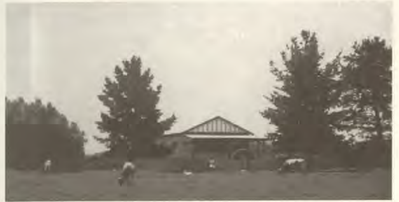
The Sullivan farmhouse at Clybucca, near Kempsey, in 1940.

One of my jobs each afternoon was to prepare the lamps for the night, filling them with kerosene, cleaning the glass mantles and trimming the wicks. The WC was a 40-foot (13-metre) walk down to the corner of the backyard and another of my jobs each week was to dig a hole in the loamy soil of the orchard where Dad buried the night-soil.