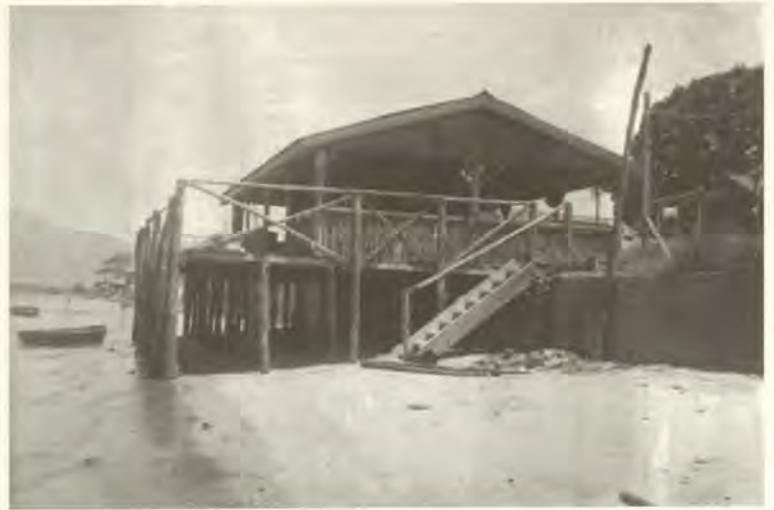
Airmen's beer garden on Esplanade, Cairns, Queensland, built by airmen of Catalina squadrons.

I was up at 4.15 to catch the high tide and put two Mariners back in the water, and hoped there weren't any "Noahs Arks" nosing around the slipway as I took the beaching gear off. When I was working out on the water last week I saw a seven foot hammerhead shark cruising around below. It sure makes you careful not to drop any tools in the water, as we have to pay for any we lose and I wouldn't be diving in after them.