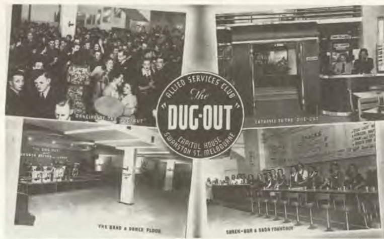
The "Dug-out" Allied Services Club in the basement of Capitol House, staffed by Myer.

an Englishwoman from Liverpool, and she had an older male boarder. One son was a civilian and another a sergeant pilot in the RAAF. She had a very attractive daughter, but she dropped the hint for us to keep our distance and told us she had over 40 airmen stay there, so we didn't stand a chance with that competition. It is a nice suburb, with some decent-sized two storey houses like this one, but the beach is very narrow and it was too cold to swim. We enjoyed being able to sleep in until 10.30 a.m. on Sunday, and sleeping in a bed with white sheets was welcome after the palliase and grey blankets.