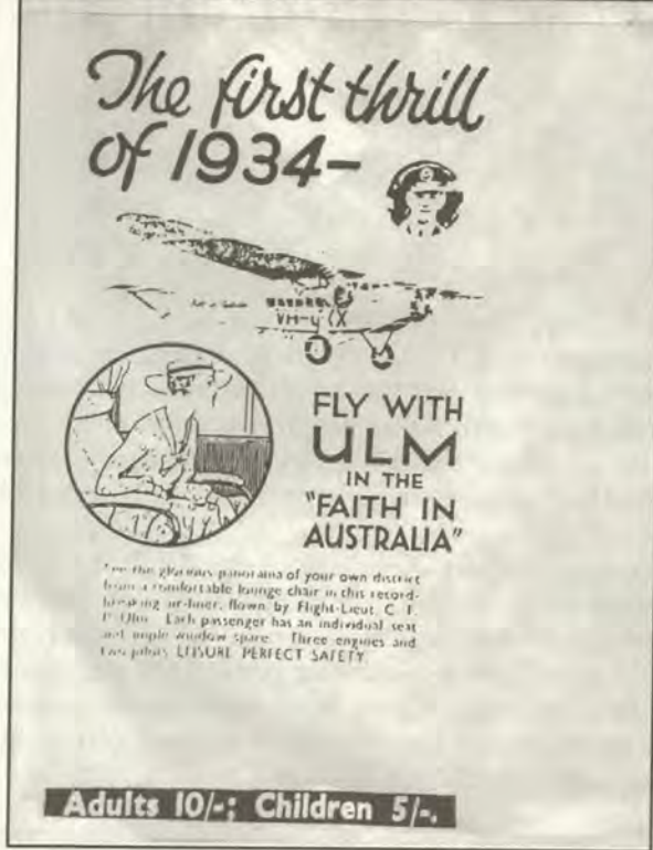
Handbill for joy rides in VH-UXX, Faith in Australia. Avro Ten depicted is Southern Sun. VH-UXX was originally Southern Moon.