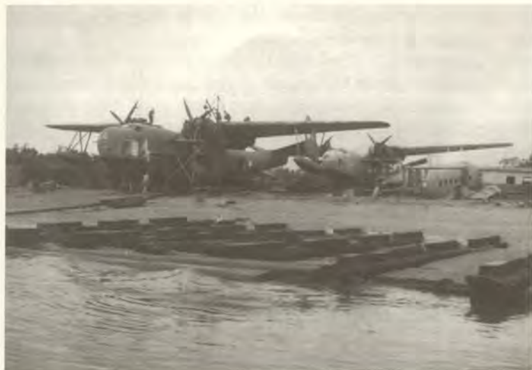
On the slipway: Mariners A70-8 (rear) and A70-11 (front) which is having the port propellor changed. US Army Air Force C-47 fuselage was used for storage.