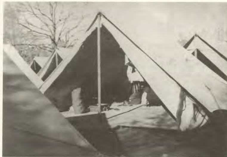
Six-man tents in Member's Car Park, Flemington Racecourse, (where author spent winter 1943), took overflow from the showgrounds.

Living conditions are primitive after the comparative luxury of Ballarat. The tents are A-style army tents with a fly and wooden pallets for the floor, only four inches above the gravel of the Members' Car Park. With six palliasses spread out on the floor, there is hardly room to put a foot between them. So if you want to get up during the night you have to avoid treading on your mate's face. From a wire strung between the poles hang six blue and six drab uniforms, six greatcoats and six wet towels. A lantern provides extraordinary light and shadow effects at night. As the sun doesn't rise until 7.30 a.m, you can imagine what it's