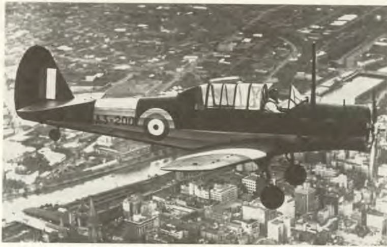
CA-6 Wackett trainer A3-200, the last of 200 built by the Commonwealth Aircraft Corporation at Fishermans Bend, Victoria, on test flight over Melbourne.