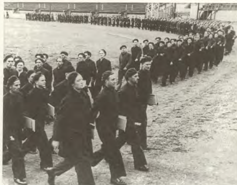
Trainees march from main arena parade ground to lecturers. Airman nearest camera in great coat is probably a Queenslander!