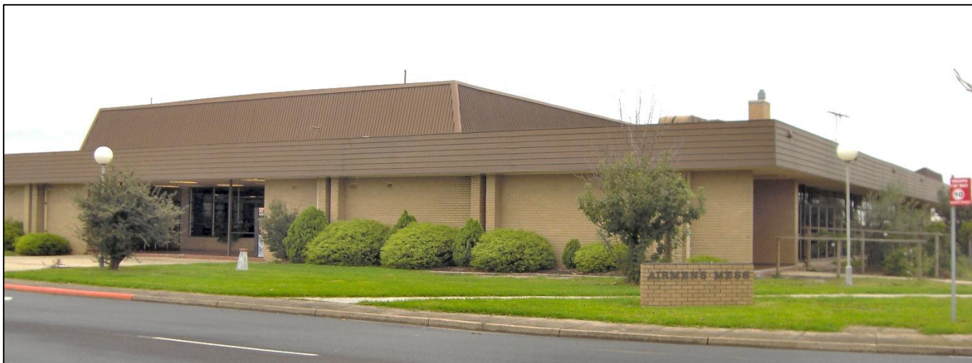
The New Airmans' Mess, over the road from where the old mess used to be – from memory, this was the site of the base service station.