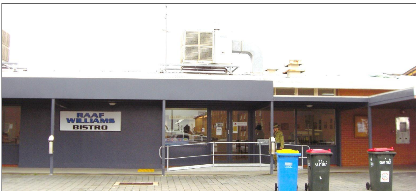
The old ASCO canteen, now called the RAAF Williams Bistro???