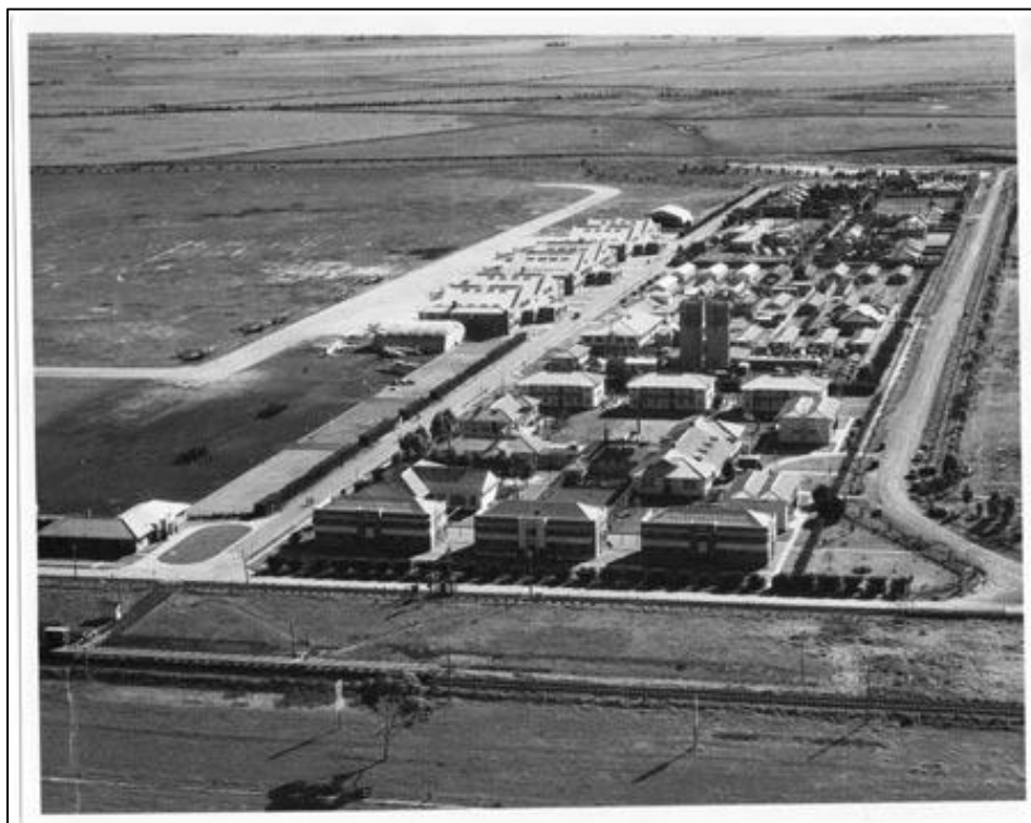
This photo was taken many years ago.