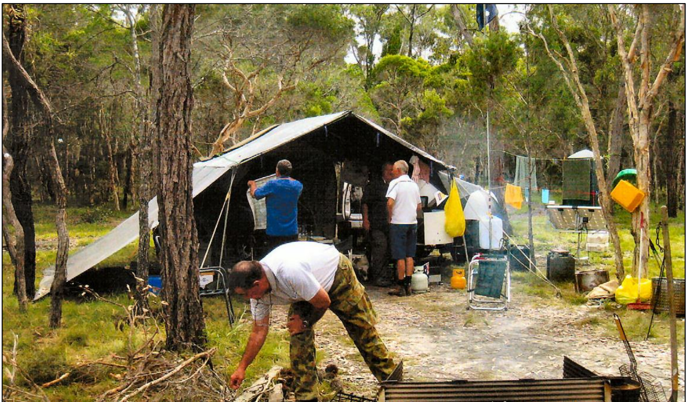
Top, part of the camping area and below, some blokes setting up for a leisurely stay.