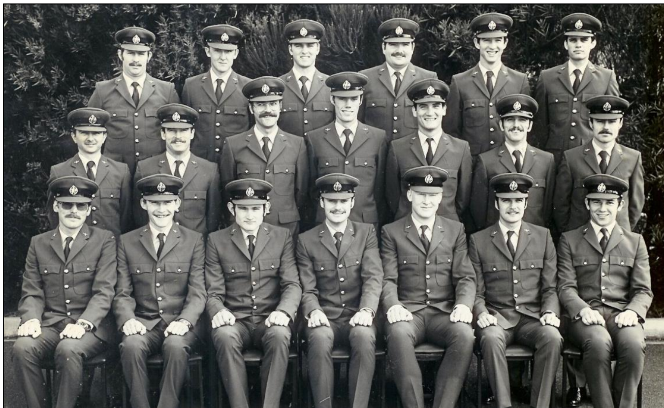
Course 2-87 Medical Assistants.