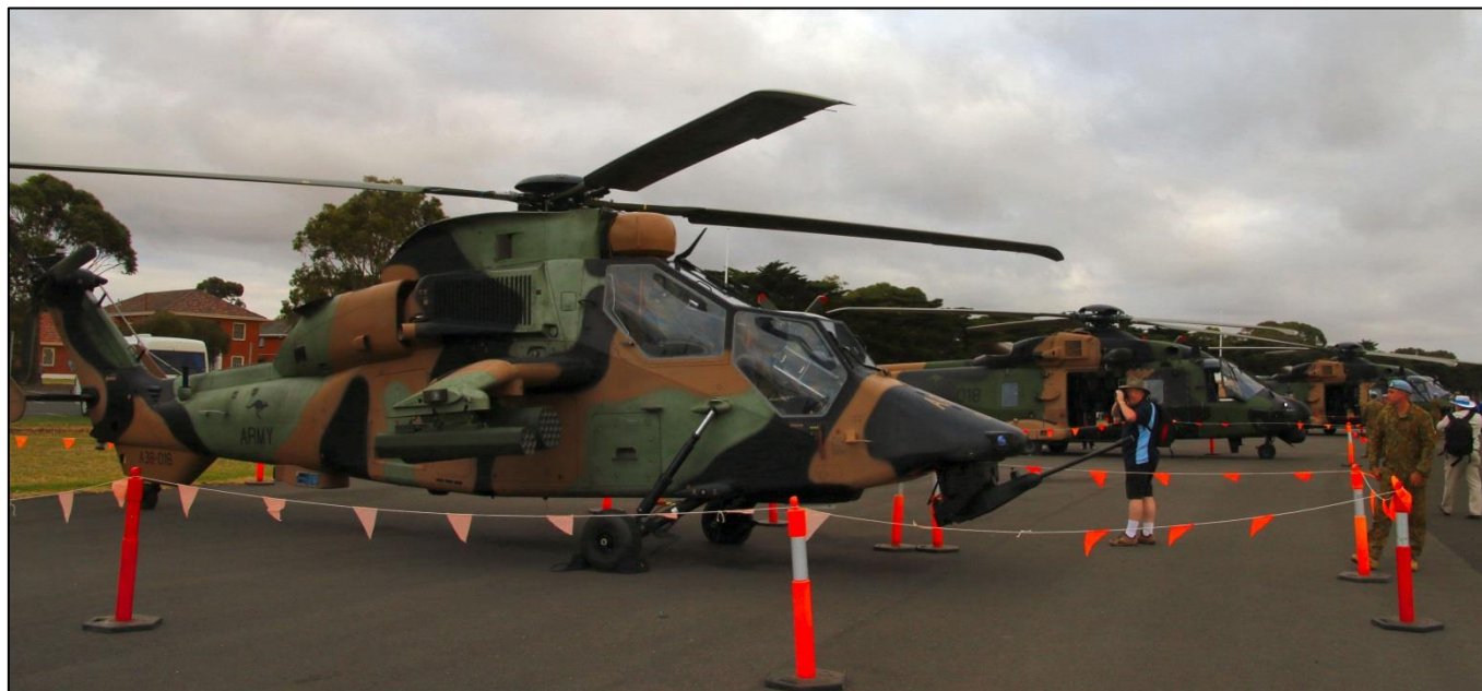
Foreground the Tiger ARH and in the background, two MRH.

internal load of up to 2,500kg. The Navy will also receive 16 of the type to replace their ancient Sea Kings.