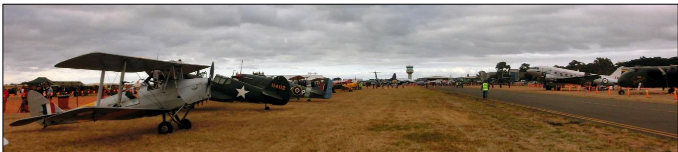
Above, part of the line up of civvy aircraft on display.

This particular aircraft is owned by Judith Pay.