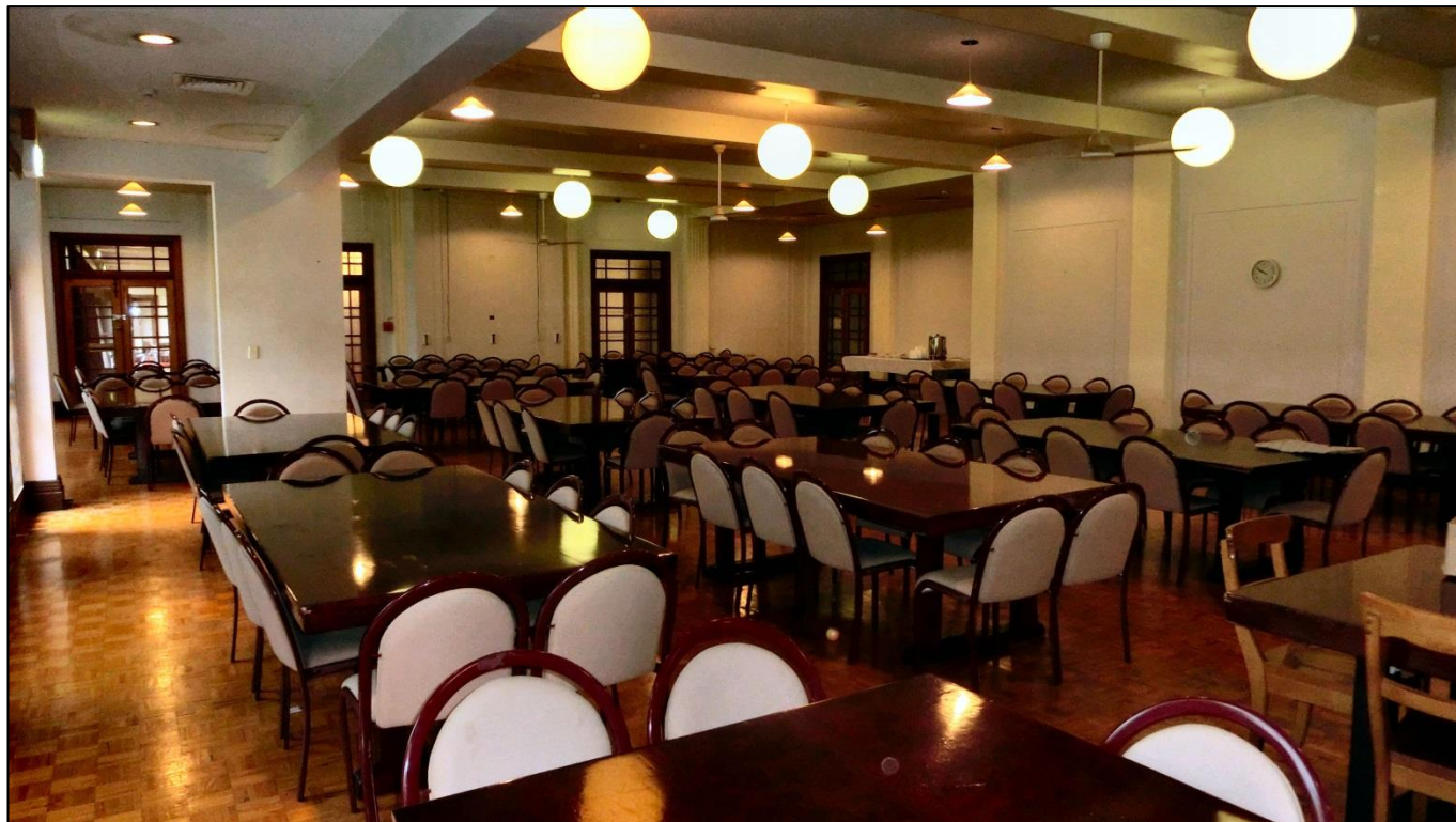
Old Officer's Mess dining room, Point Cook.

were brought in, gas barbecues and ovens were found and assembled at the back of the mess, the dining room was cleaned up and from these rudimentary facilities, everyone was served up breakfast, lunch and dinner and there wasn't a complaint in the house. Well done to everyone involved.