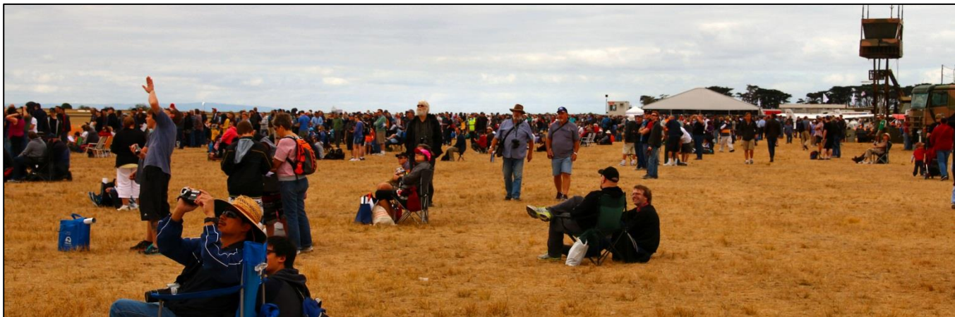
Part of the huge crowd that lined the runway to get a glimpse of the displays.

The Melbourne God turned on some good weather, cool in the morning but blue sky and warm in the afternoon and all day they streamed in through the gates with their chairs, umbrellas, rugs, eskies, cameras, found a spot on the grass and watched the flying show that commenced at 10.00am and continued non-stop until 4.00pm.