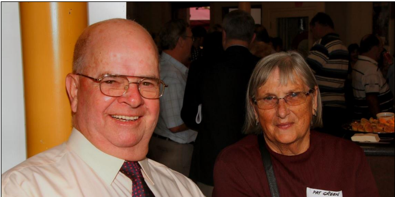
L-R: Ray "RG" Thompson, Pat Green.