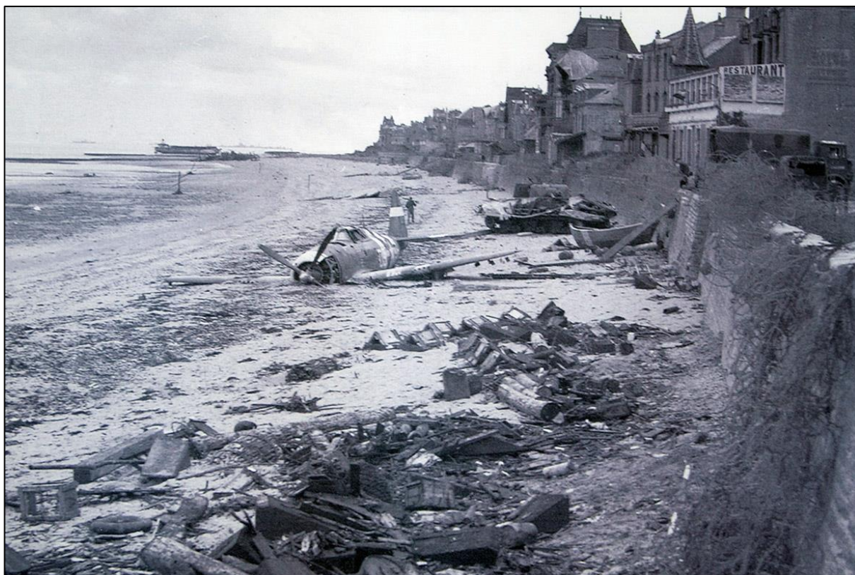
June 1944: A crashed US fighter plane is seen on the waterfront some time after Canadian forces came ashore on a Juno Beach D-Day landing zone in Saint-Aubin-sur-Mer, France.