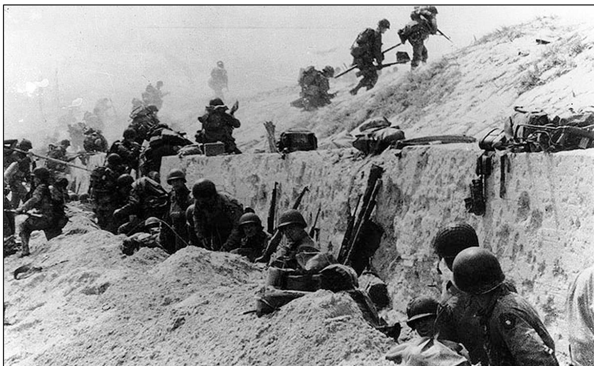
June 6, 1944: US Army soldiers of the 8th Infantry Regiment, 4th Infantry Division, move out over the seawall on Utah Beach after coming ashore in front of a concrete wall near La Madeleine, France.