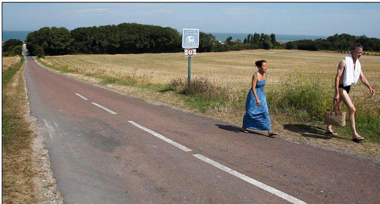
A couple walk inland from the former D-Day landing zone of Gold Beach where British forces came ashore in 1944, in Ver-sur-Mer, France.