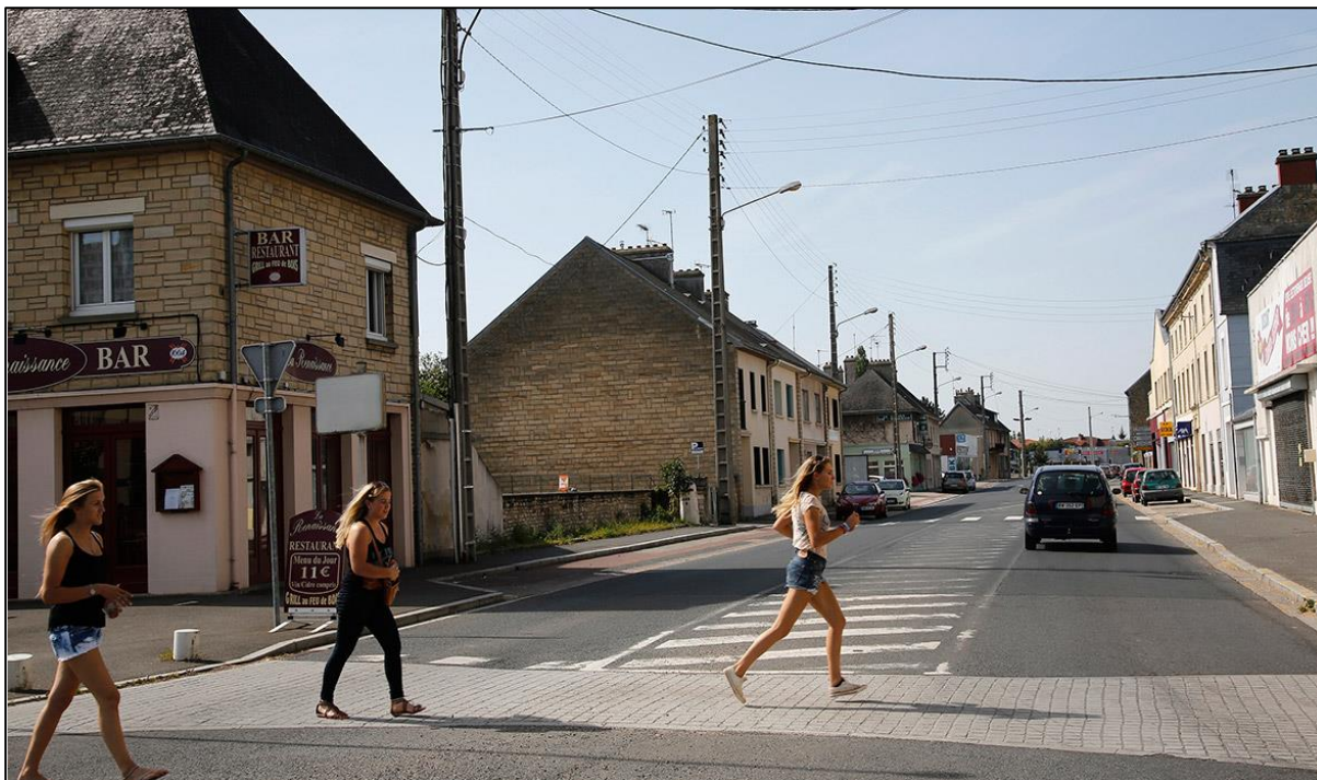
Girls run across the street at the junction of Rue Holgate and RN13 in the Normandy town of Carentan, France.