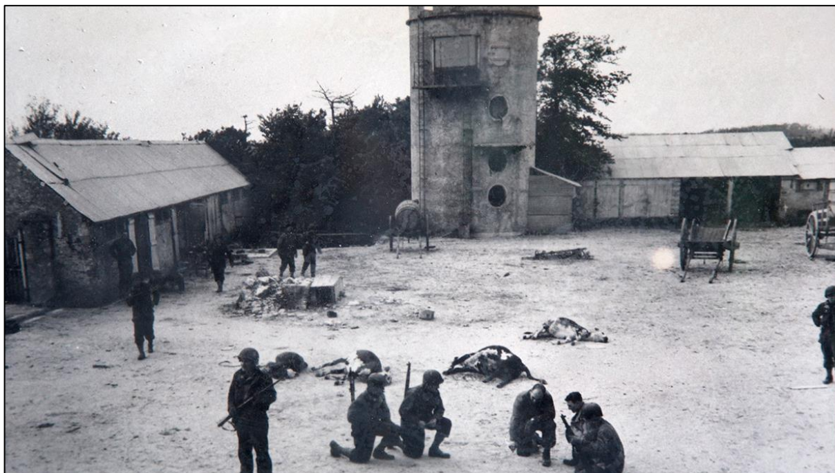
June 6, 1944: US Army troops make a battle plan in a farmyard amid cattle, killed by artillery bursts, near the D-Day landing zone of Utah Beach in Les Dunes de Varreville, France.