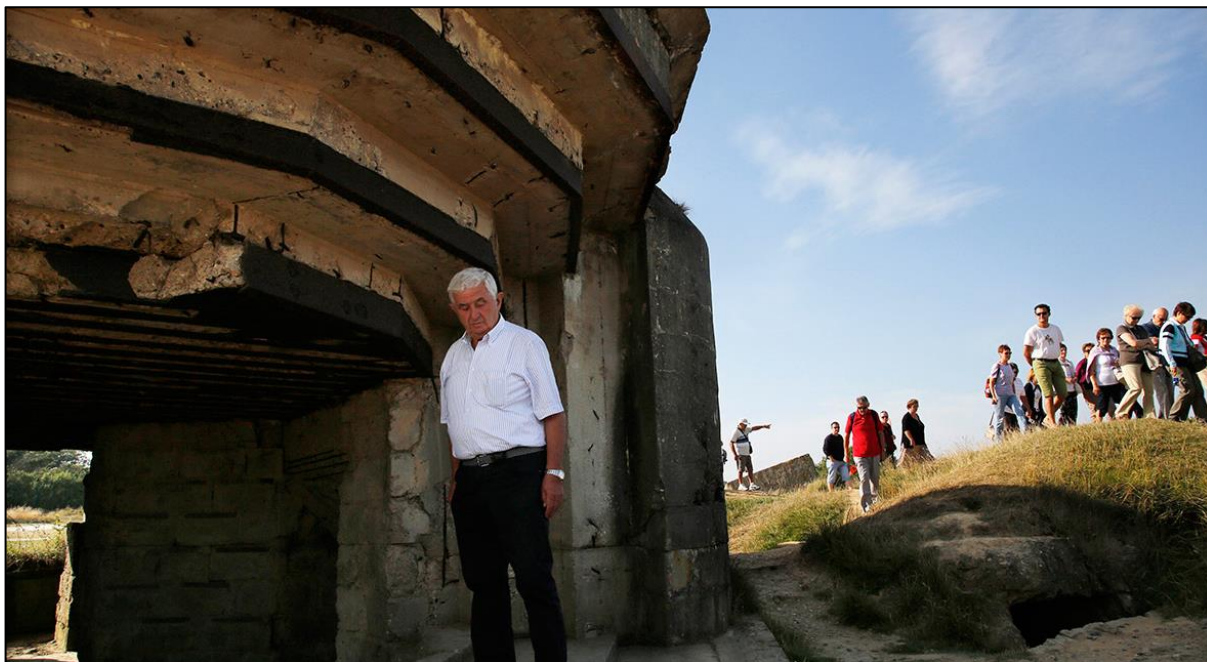
An Italian tourist views a bunker at a strategic site overlooking the D-Day beaches which had been captured by US Army Rangers at Pointe du Hoc, France.