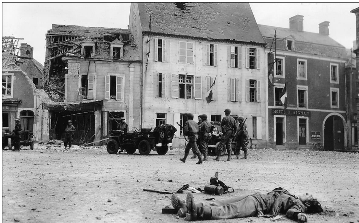
June 15, 1944: The body of a dead German soldier lies in the main square of Place Du Marche in Trevieres after the town was taken by US troops who landed at nearby Omaha Beach.