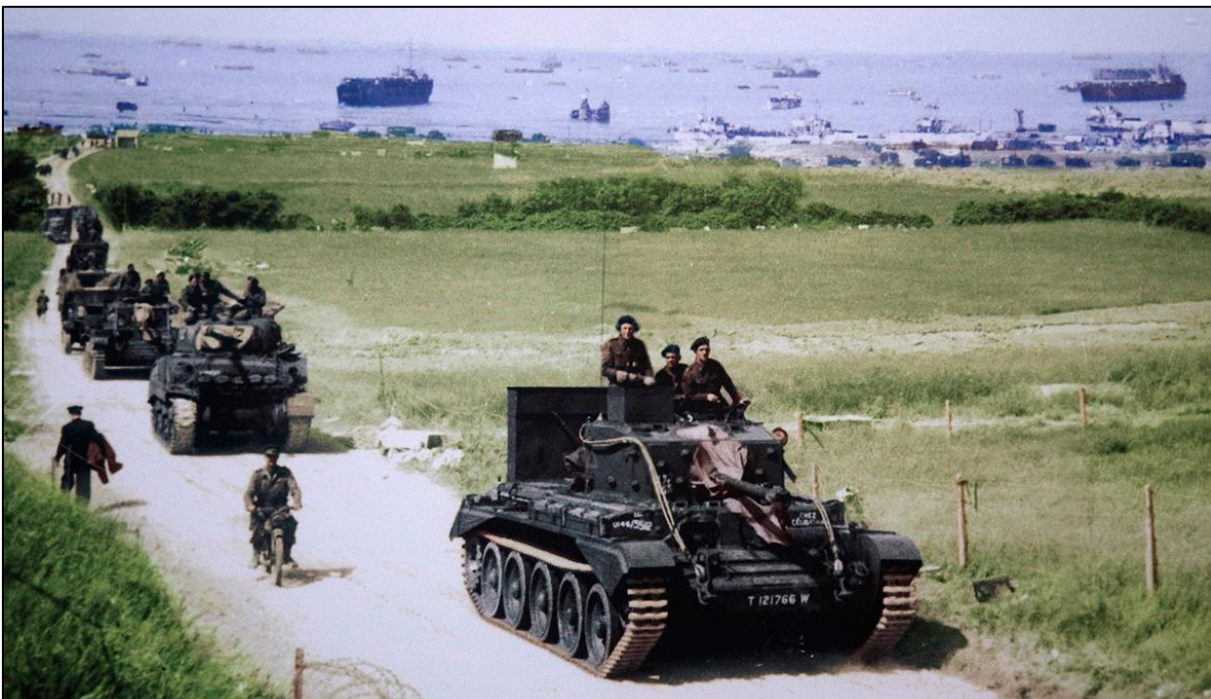
June 6, 1944: A Cromwell tank leads a British Army column from the 4th County of London Yeomanry, 7th Armoured Division, after landing on Gold Beach on D-Day in Ver-sur-Mer, France.