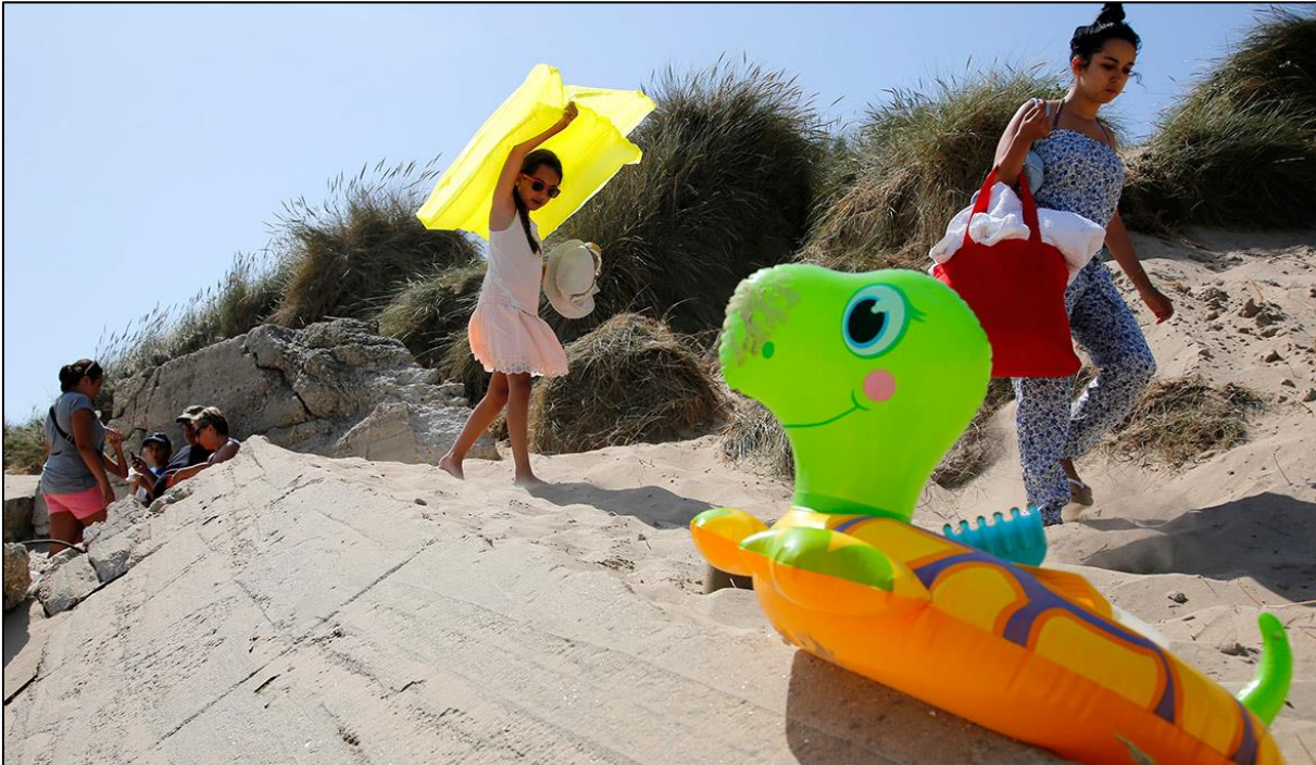
Children walk over the remains of a concrete wall on the former Utah Beach D-Day landing zone near La Madeleine, France.