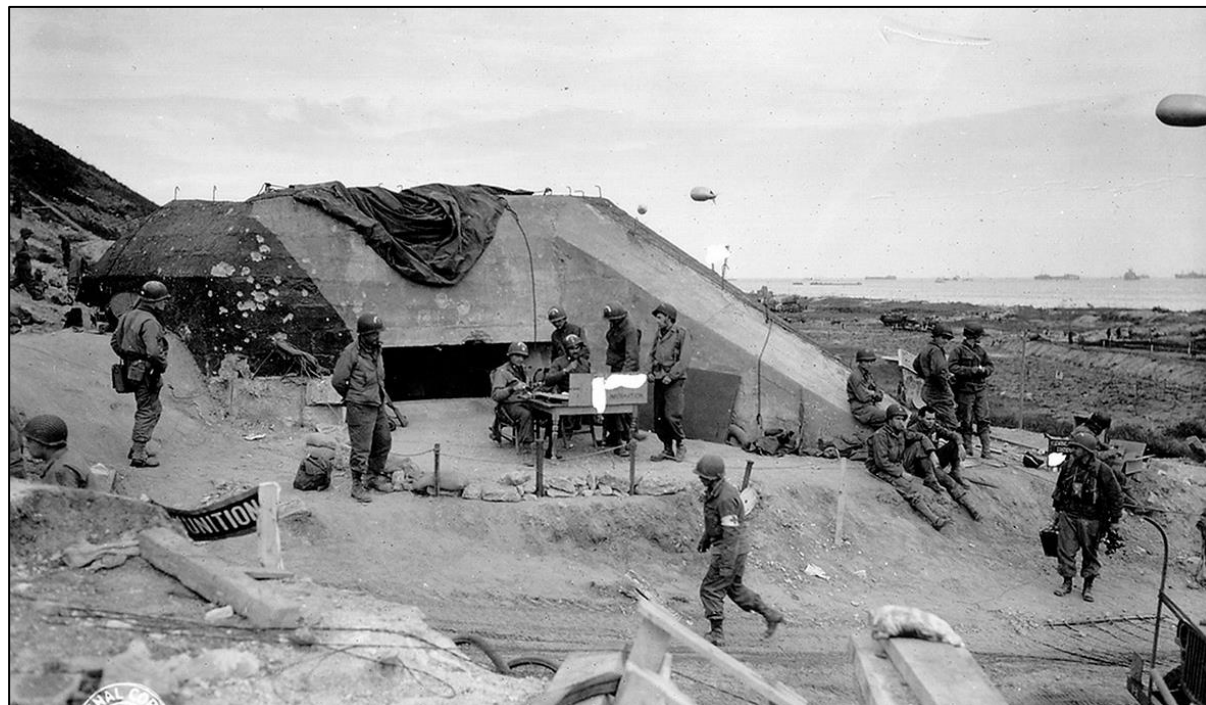
June 7, 1944: US Army troops congregate around a signal post used by engineers on the site of a captured German bunker overlooking Omaha Beach after the D-Day landings near Saint Laurent sur Mer.