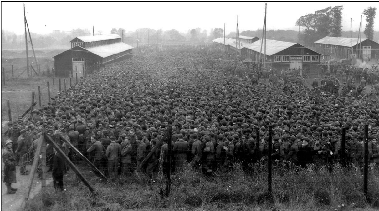
August 21, 1944: German prisoners of war captured after the D-Day landings in Normandy are guarded by US troops at a camp in Nonant-le-Pin, France.