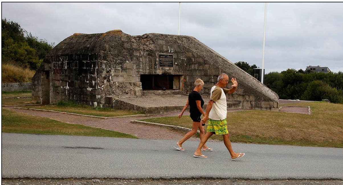
Tourists walk past a former German bunker overlooking the D-Day landing zone on Omaha Beach near Saint Laurent sur Mer, France.