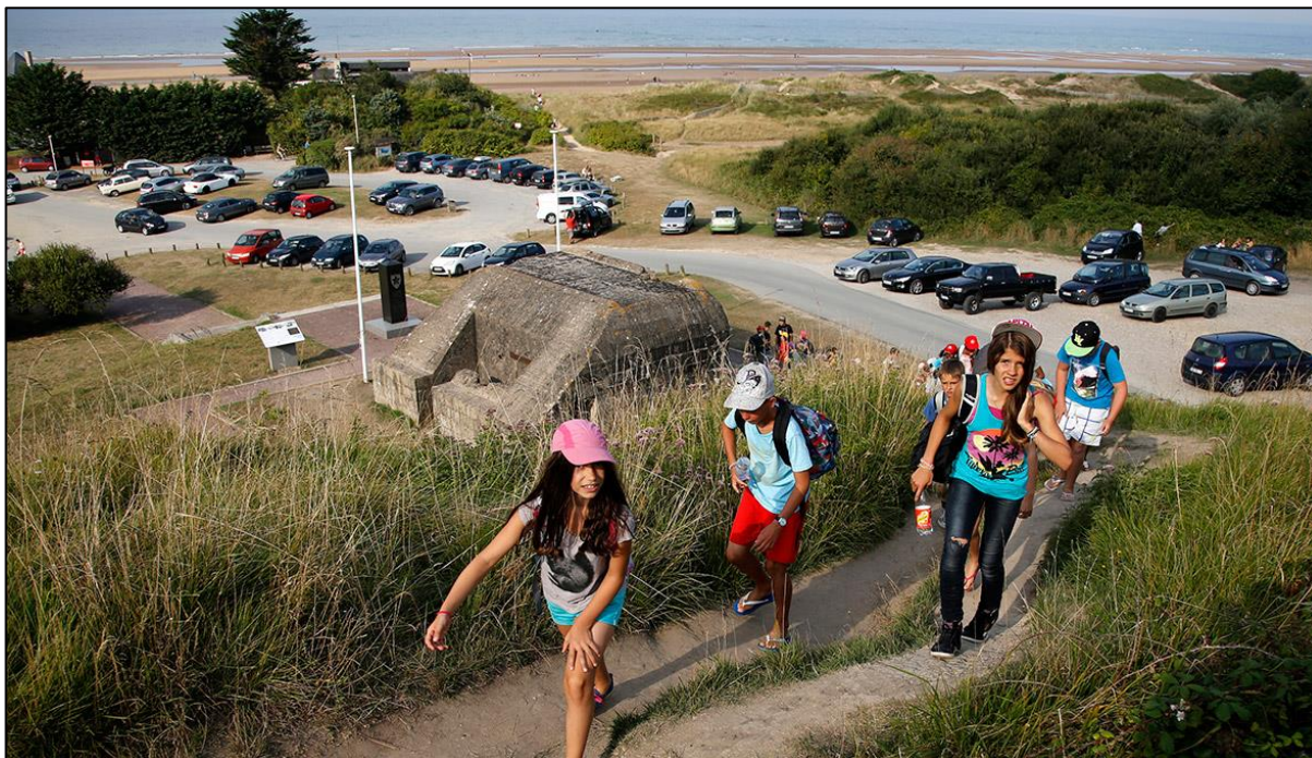
Youths hike up a hill past an old German bunker overlooking the former D-Day landing zone of Omaha Beach near Colleville sur Mer, France.