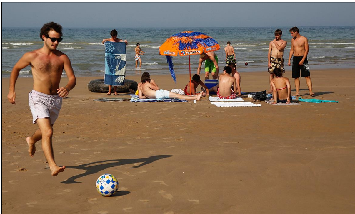
Holidaymakers enjoy the sunshine on the former D-Day landing zone of Omaha beach near Vierville sur Mer, France