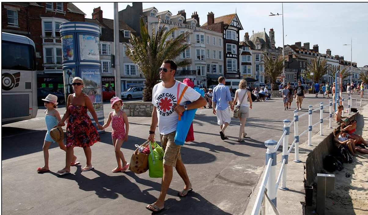
Tourists walk along the beach-front in the Dorset holiday town of Weymouth. The port was the departure point for thousands of Allied troops who took part in the D-Day landings