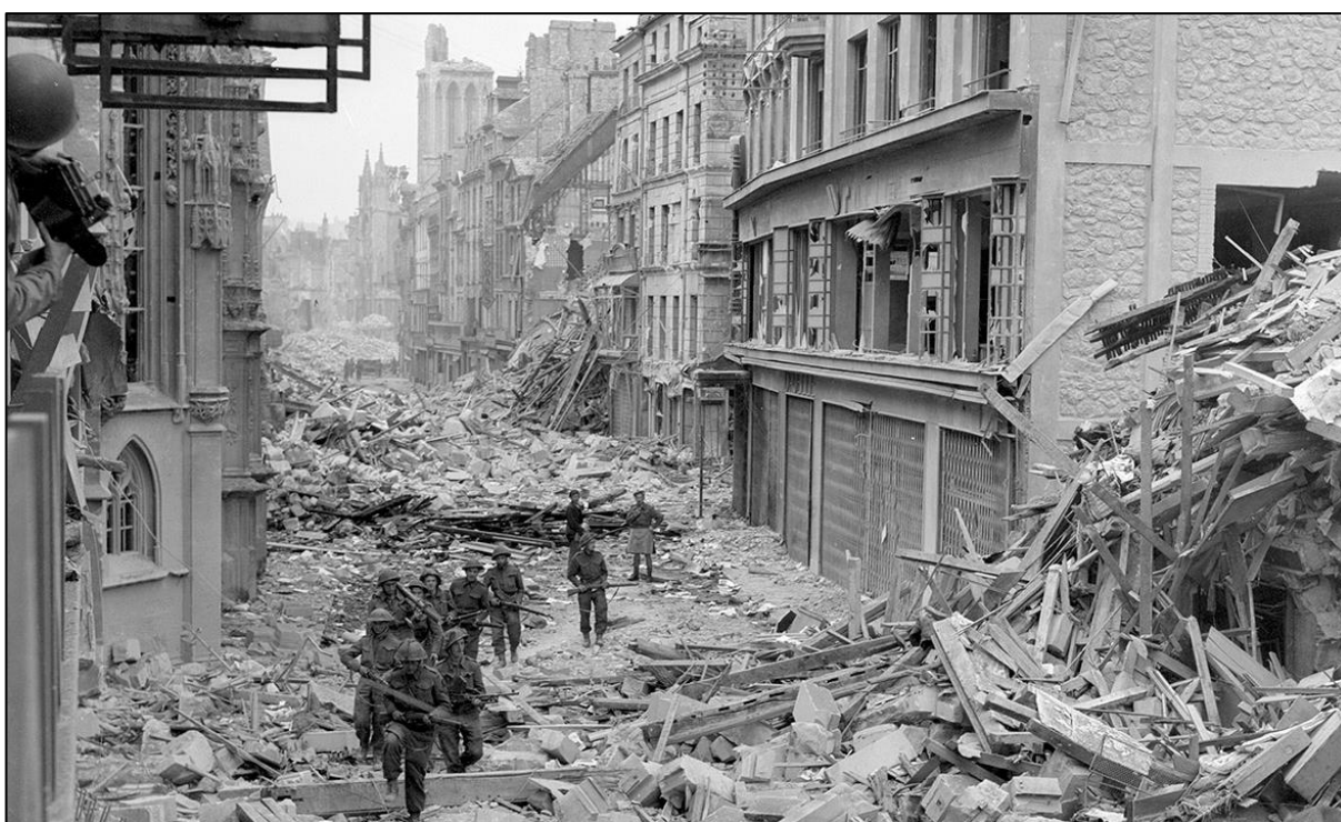
July 1944: Canadian troops patrol along the destroyed Rue Saint-Pierre after German forces were dislodged from Caen.