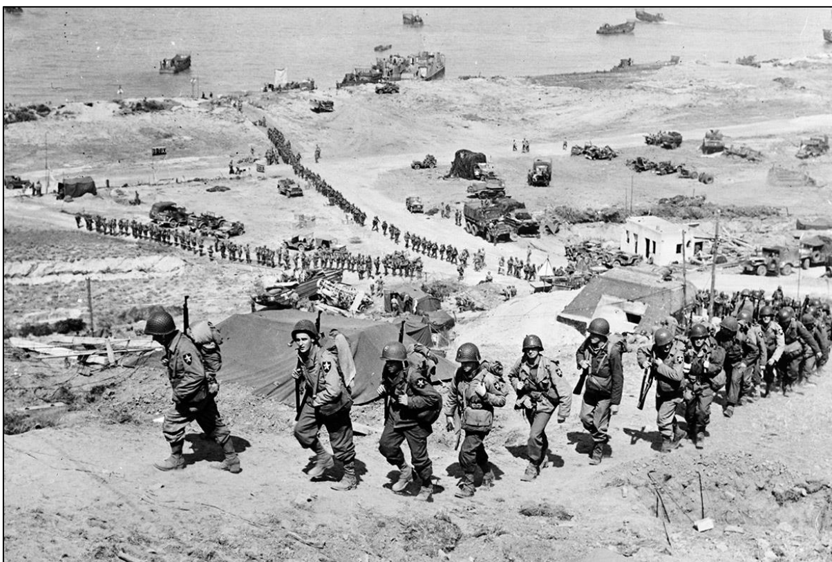
June 18, 1944: US Army reinforcements march up a hill past a German bunker overlooking Omaha Beach after the D-Day landings near Colleville sur Mer, France.