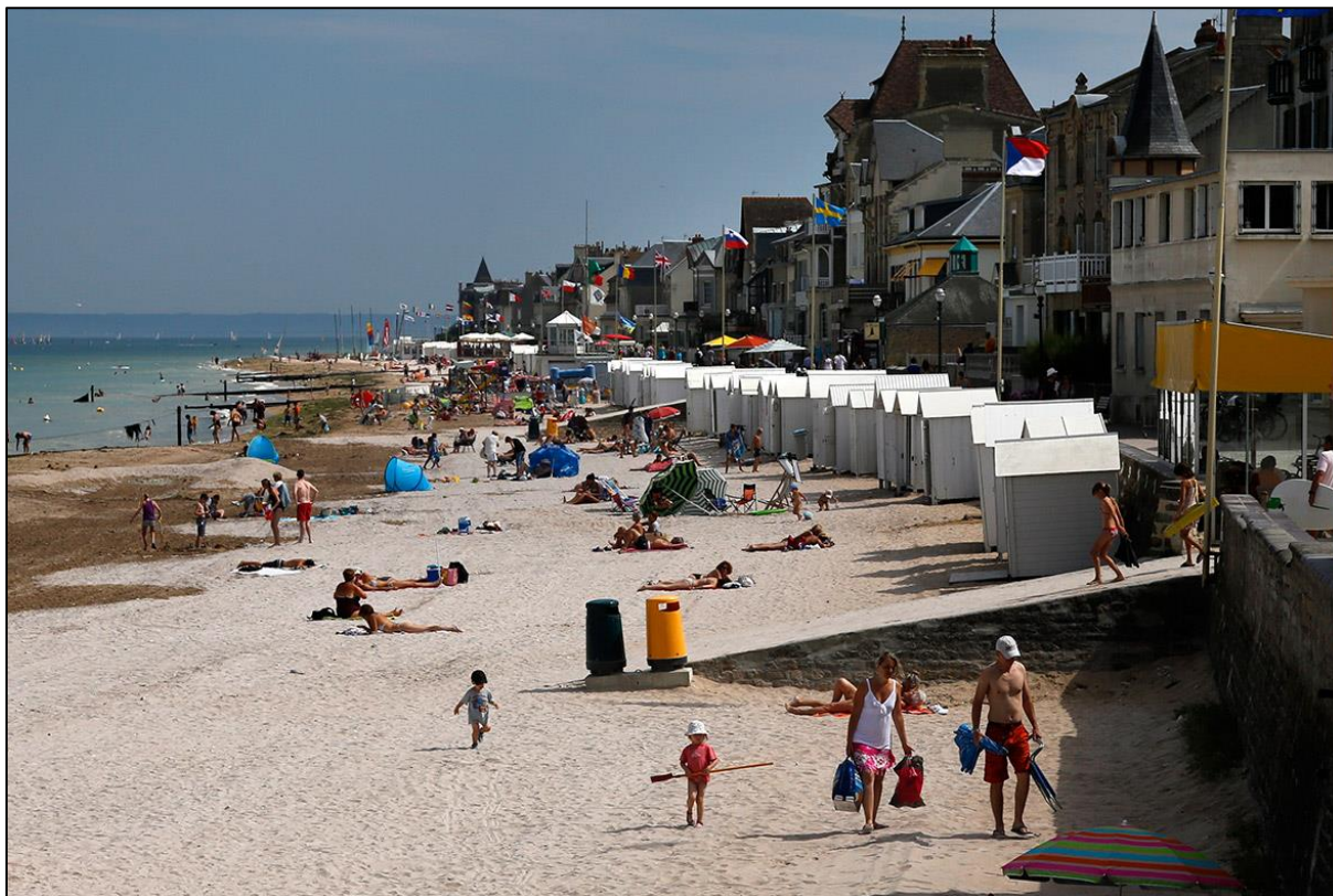
Tourists enjoy the sunshine on the former Juno Beach D-Day landing zone, where Canadian forces came ashore, in Saint-Aubin-sur-Mer, France.