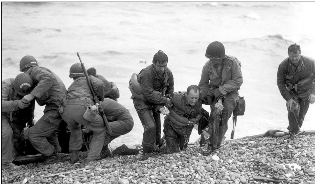
June 6, 1944: Members of an American landing party assist troops whose landing craft was sunk by enemy fire off Omaha beach, near Colleville sur Mer, France