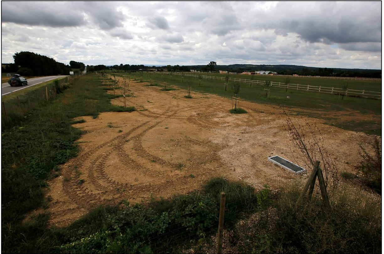
A farm field remains where German prisoners of war were interned following the D-Day landings in Nonant-le-Pin, Normandy.

Yesterday, I went on a diet... Thank God that's over.