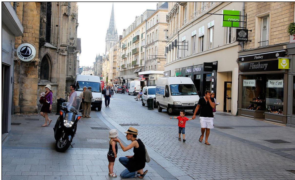
Shoppers walk along the rebuilt Rue Saint-Pierre in Caen, which was destroyed following the D-Day landings.