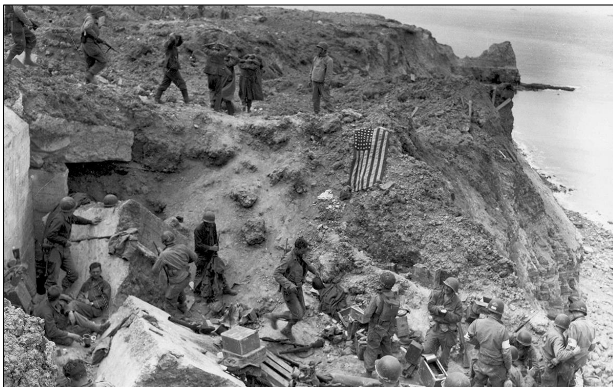
June 8, 1944: A US flag lies as a marker on a destroyed bunker two days after the strategic site overlooking D-Day beaches was captured by US Army Rangers at Pointe du Hoc, France.