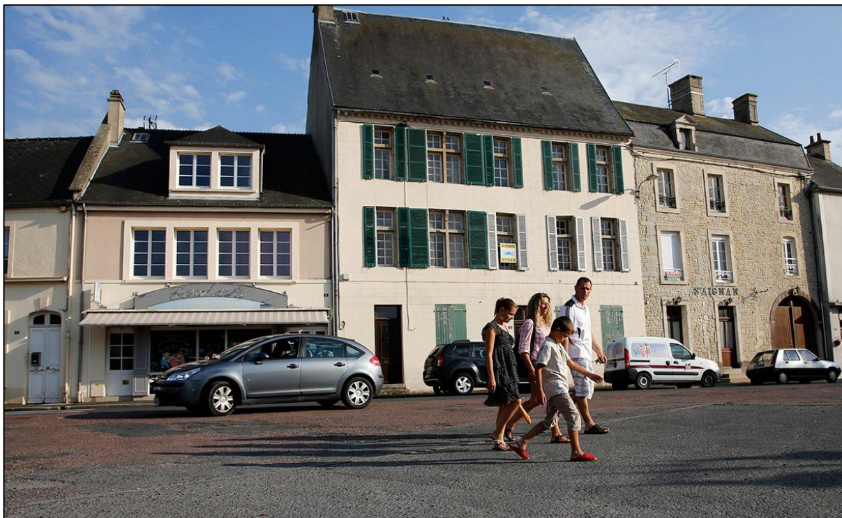
Tourists walk across the main square of Place Du Marche in Trevieres, near the former D-Day landing zone of Omaha Beach.