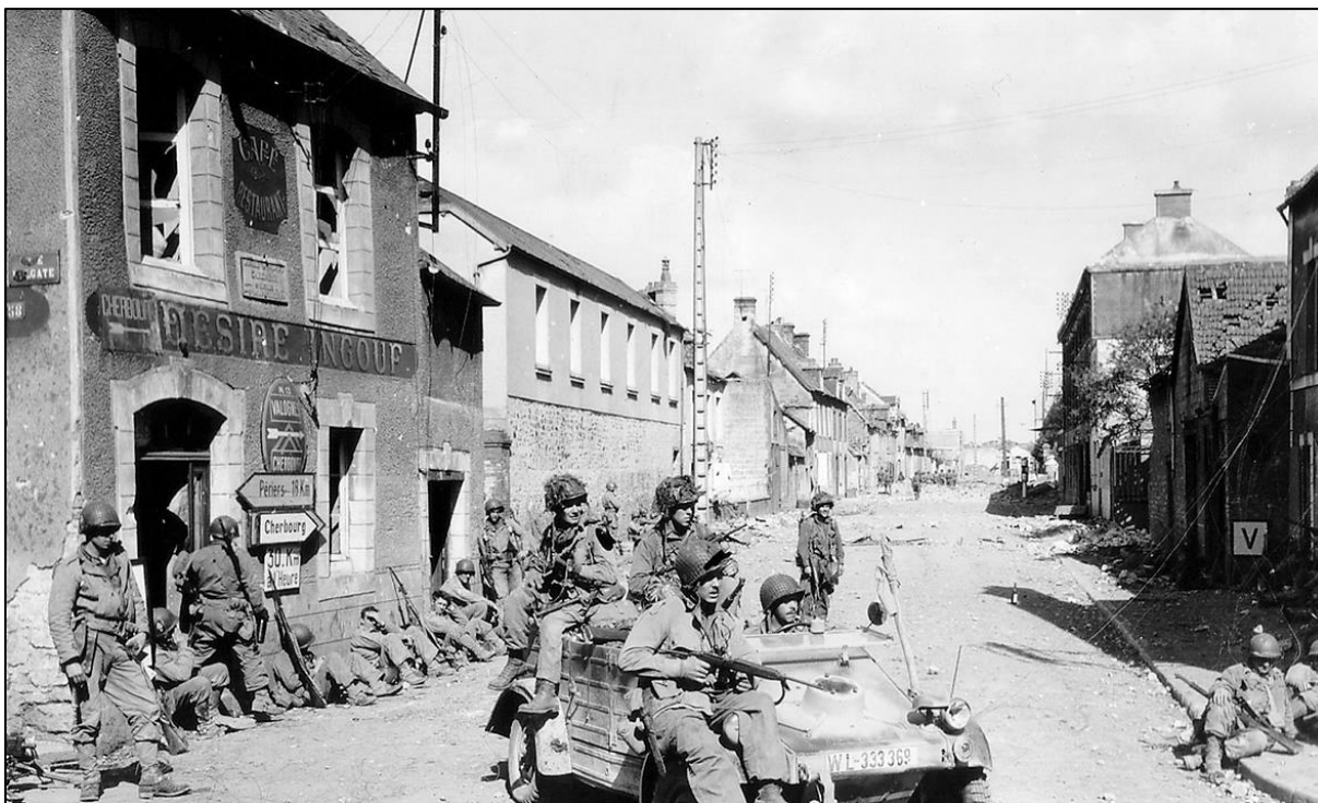
June 6, 1944: US Army paratroopers of the 101st Airborne Division drive a captured German Kubelwagen at the junction of Rue Holgate and RN13 in Carentan, France.