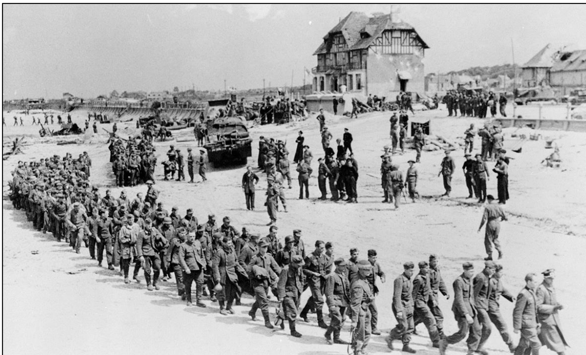
June 6, 1944: German prisoners-of-war march along Juno Beach landing area to a ship taking them to England, after they were captured by Canadian troops at Bernieres Sur Mer, France.