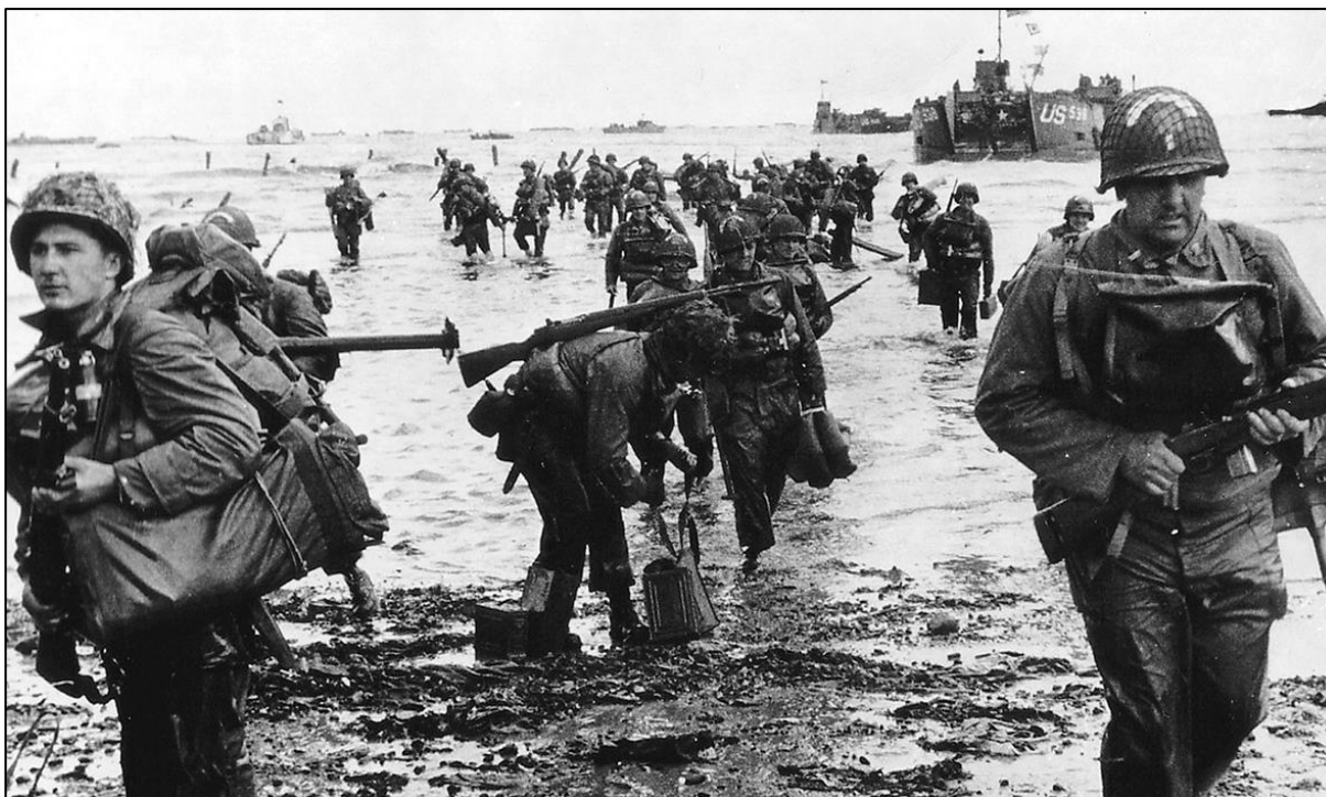
June 6, 1944: US reinforcements land on Omaha beach during the Normandy D-Day landings near Vierville sur Mer, France