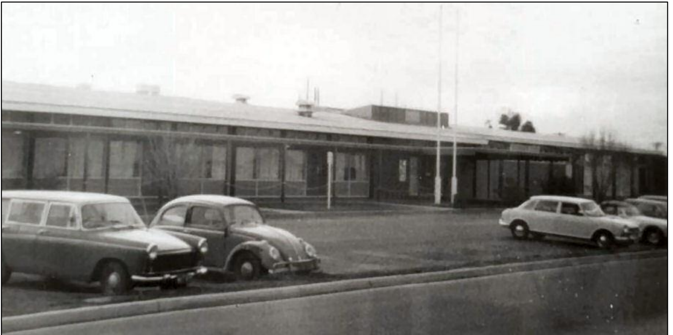
The ASCO Block.