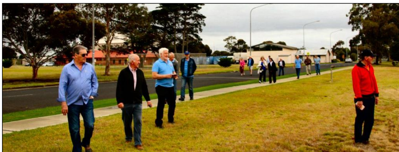
Memories! Returning from the morning “jog” to CPE and checking out the “huts” opposite the oval. Central Band building in the background.