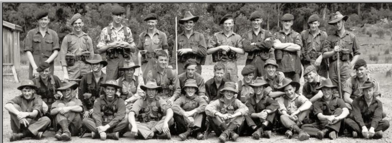
This photo was taken late in 1966 at Big Mountain during one of the "bonding" camps.