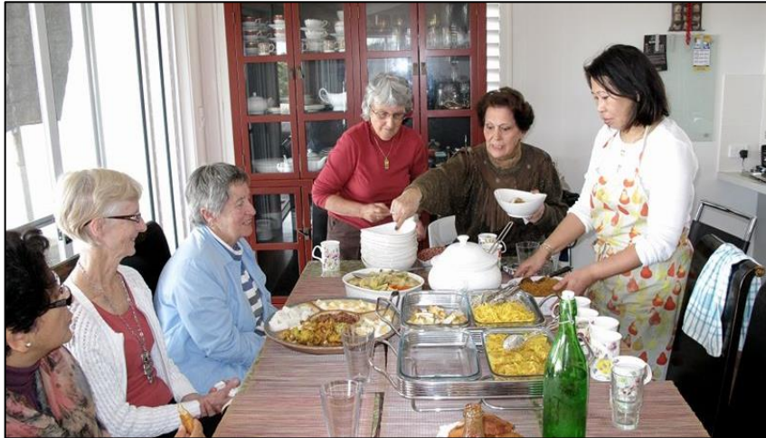
Some of the food set out at our multi-cultural lunch at the Malaysian woman's home..

I often help them with pronunciation, explanations and other relevant aids to improving their English. Lately I have been copying their VHS home movies (some dating back to 1989) to DVDs.