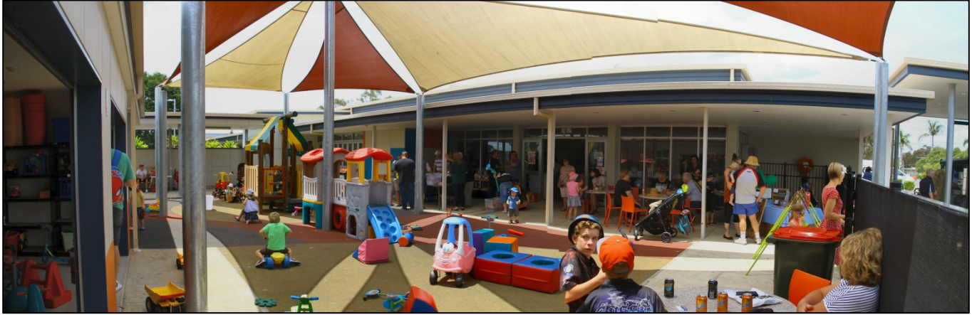
The Gallipoli Barracks Welfare Centre.

The Army, in their wisdom, arranged for some of their vehicles to be available and some of the kids were lucky enough to get a ride around the block in one of the Bushmasters.