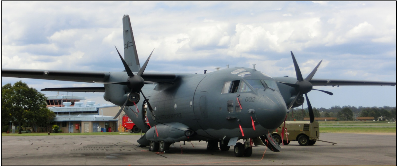
Spartan number 2, number 1 had left for home earlier in the day.