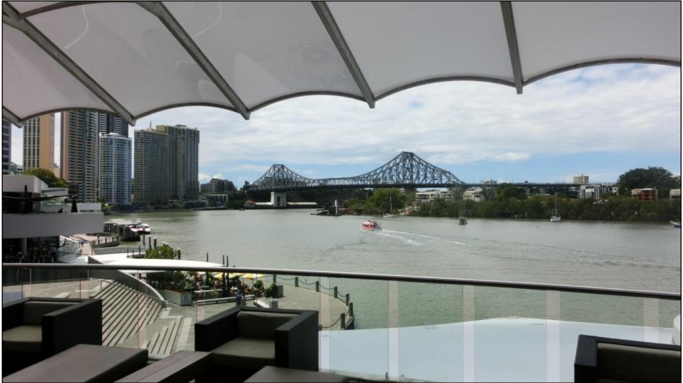
The view from the balcony.