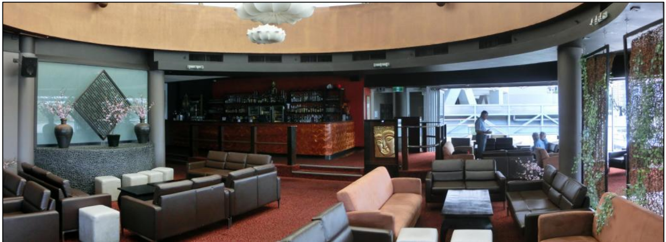
Interior of the Jade Buddha.

RTFV-35Sqn has got together with 9 Sqn and they propose to hold the "get together" under the "RAAF Vietnam" banner.