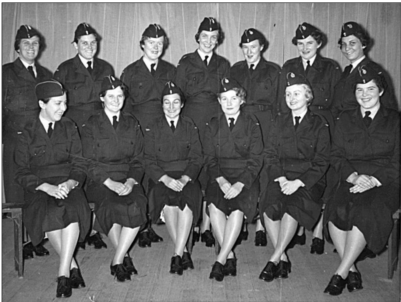
3 TPRINOP COURSE - Ballarat 3 March-15 May 1959

at RAAF Point Cook, Victoria before she was posted to RAAF School of Radio, Ballarat, Victoria to undergo training as a Teleprinter Operator. She commenced training with No 2 Teleprinter Operator Course (16 Dec 58 – 7 Mar 59) but her training was suspended on 19th January 1959 due to her hospitalisation in 6 RAAF Hospital, Laverton. She went on to complete her training with No 3 Teleprinter Operator Course (2 Mar 59 – 4 Jun 59).