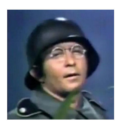
Velly Intelesting - but stupid!!!!