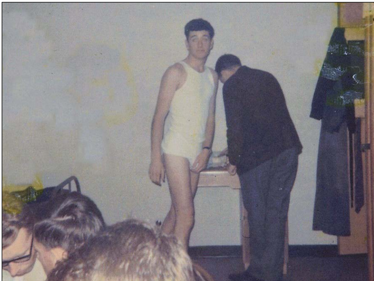
At Laverton, August 1967.