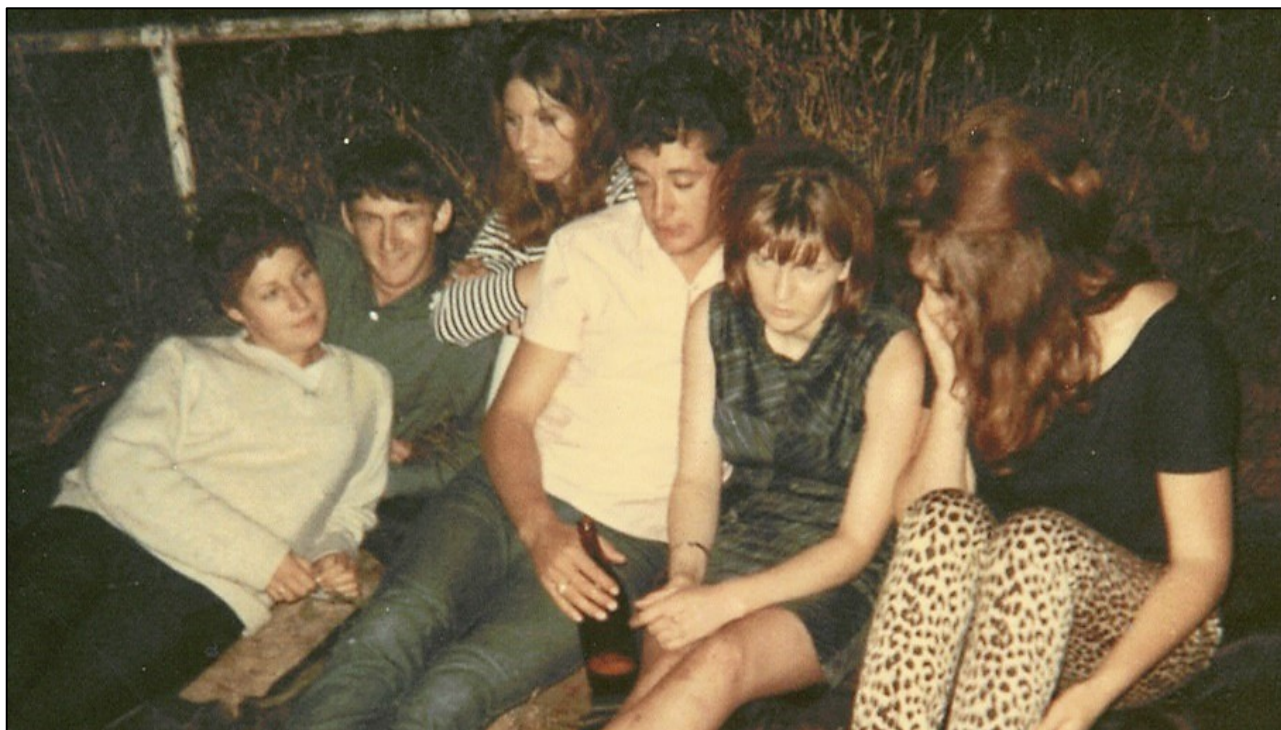
At the "Boulevard" (Melbourne) with the girls. 1967.