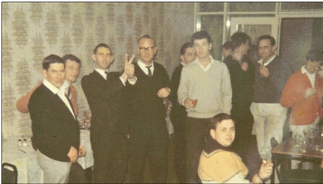
41 RTC break up party, Altona Hotel August 1967.