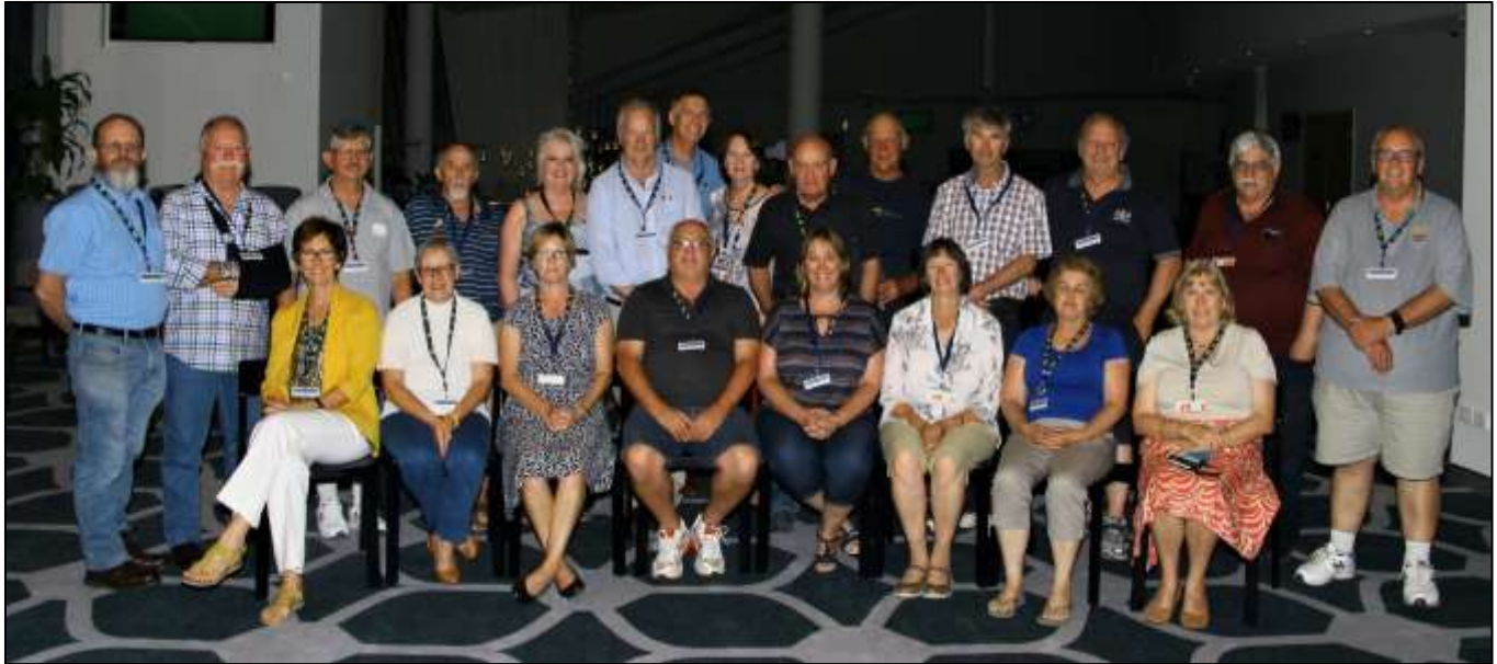
The troops and their ladies.