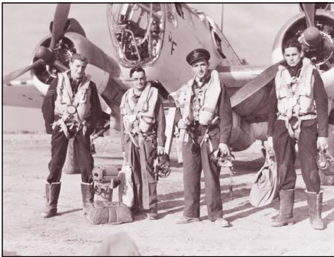
At the RAAF Museum, you'll find tales of Australia's military aviators and their daring deeds.