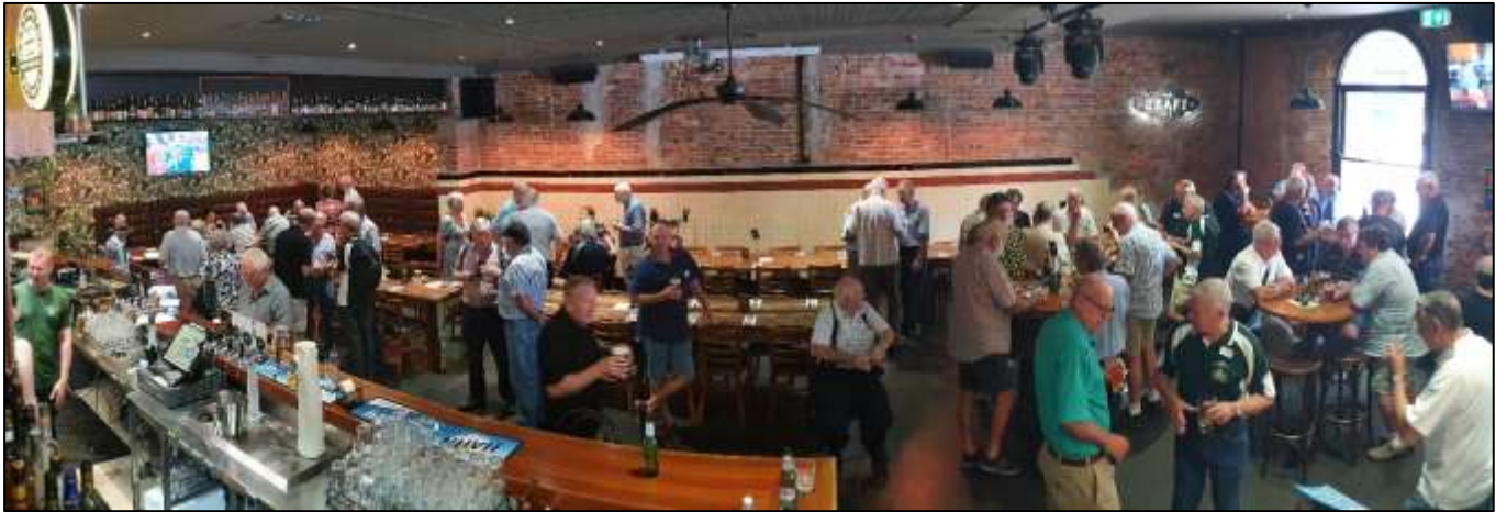
Everyone grabbing a drink and taking up a position.