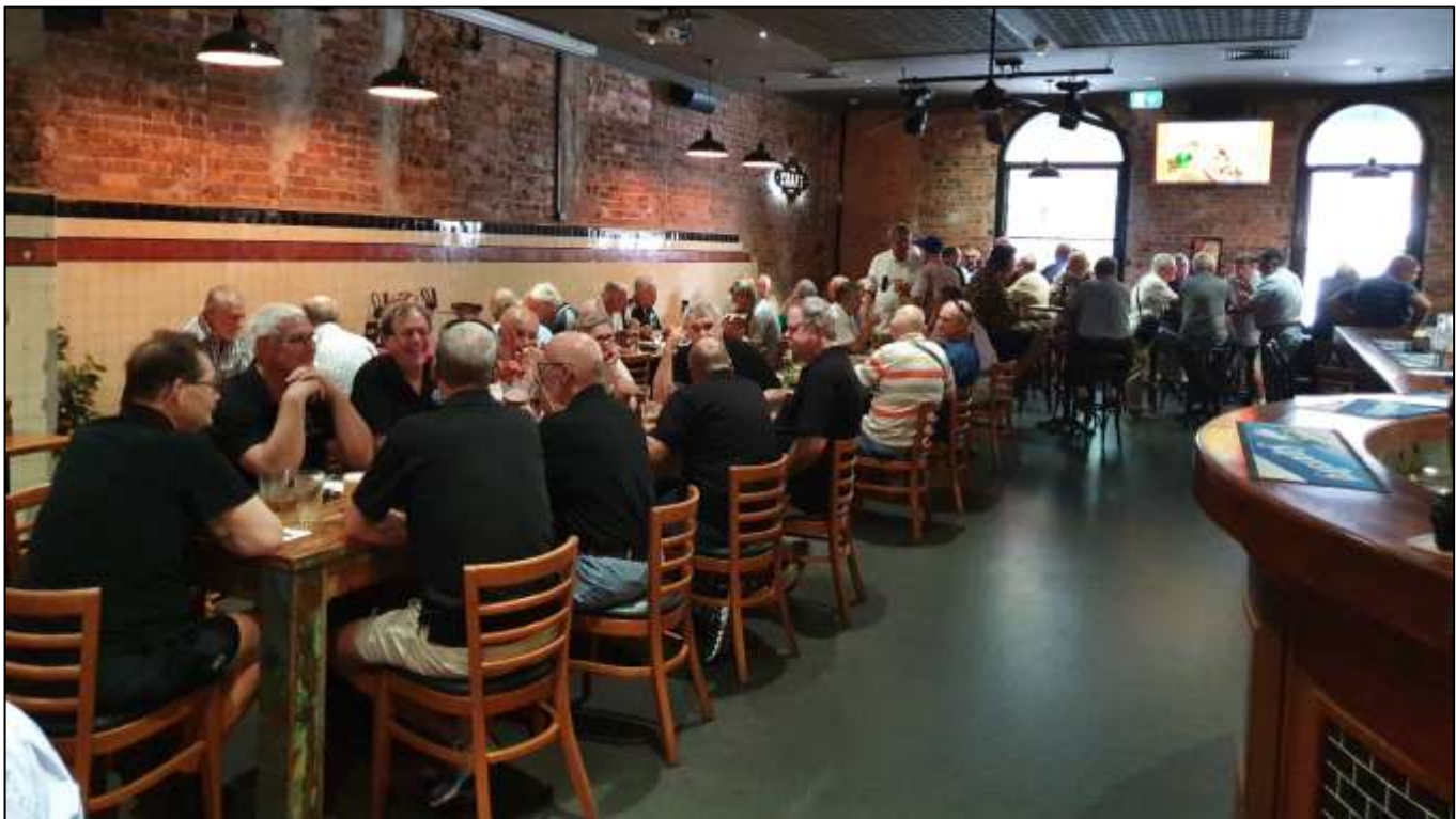
All's quiet, lunch is being served.