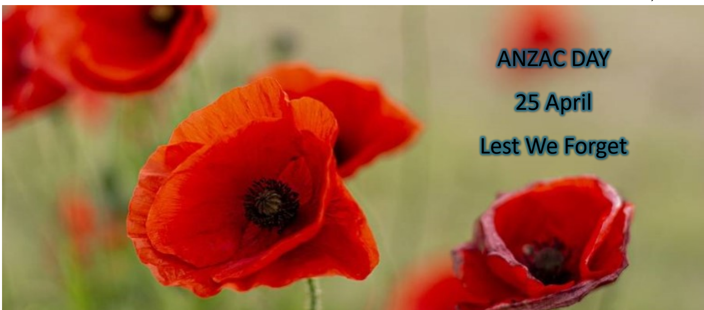
ANZAC Day is a day of remembrance. At dawn on 25 April 1915 a contingent of Australian and New Zealand Soldiers landed on Turkey's Gallipoli Peninsula. It was with this landing that there began to emerge the tradition of ANZAC with the ideals of mateship and sacrifice that distinguish and unite all Australians irrespective of their origins.