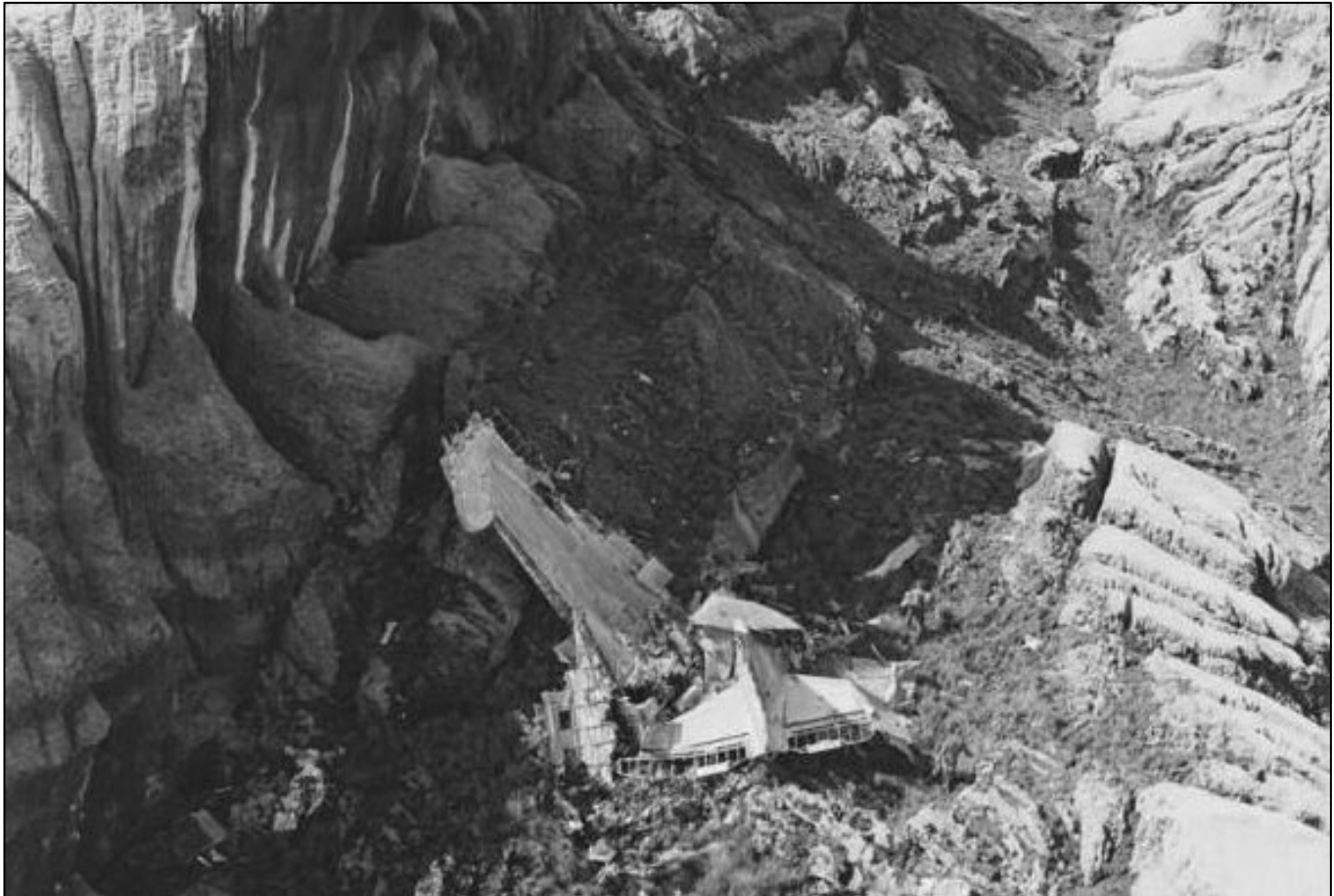
The remains of RAAF Dakota A65-61 aircraft that crashed into a mountain in West Irian.