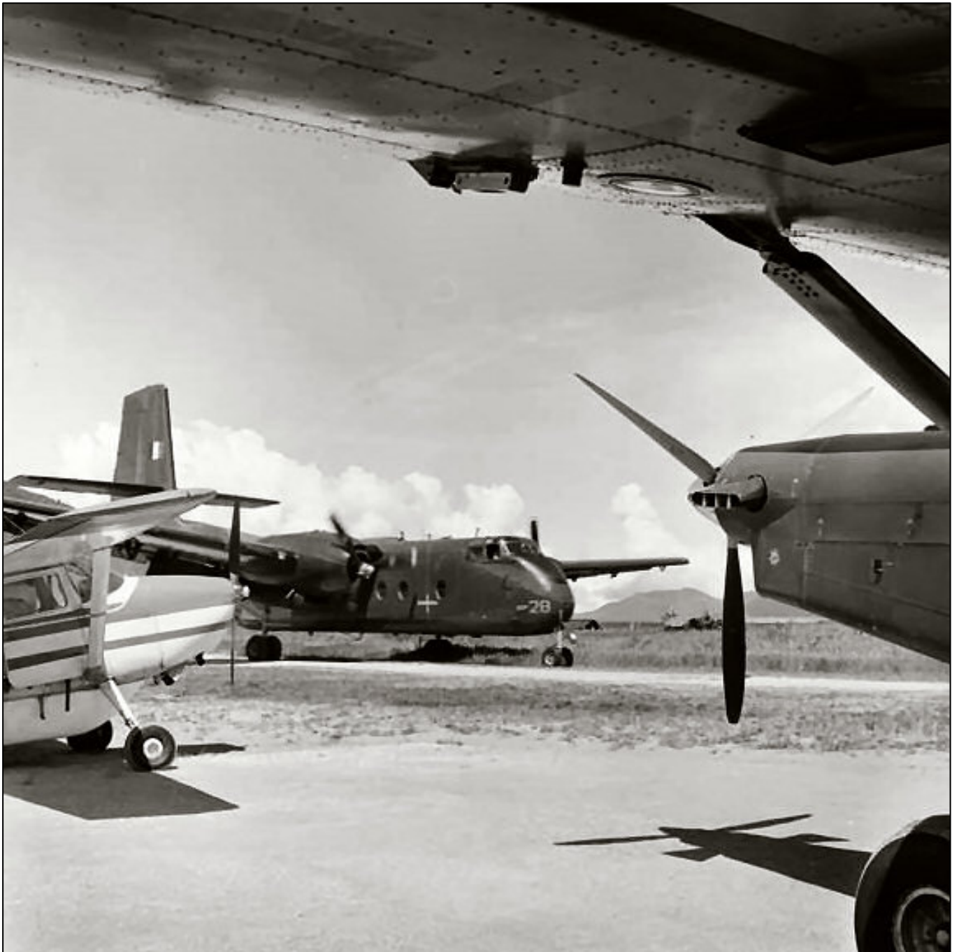
RAAF Caribou with Army Porter.