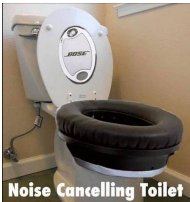
Noise Cancelling Toilet