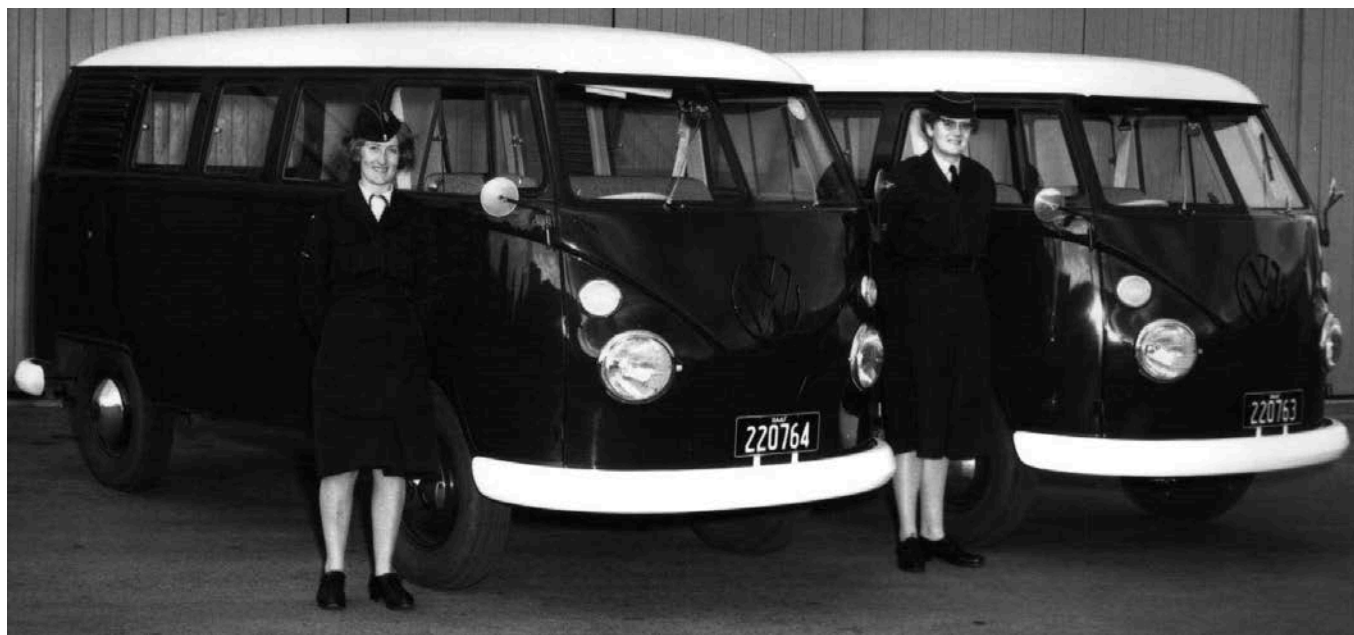
Lindsay Cheal and Paty Rice with the 2 new Combies they were to drive from Melbourne to Richmond back in 1966.