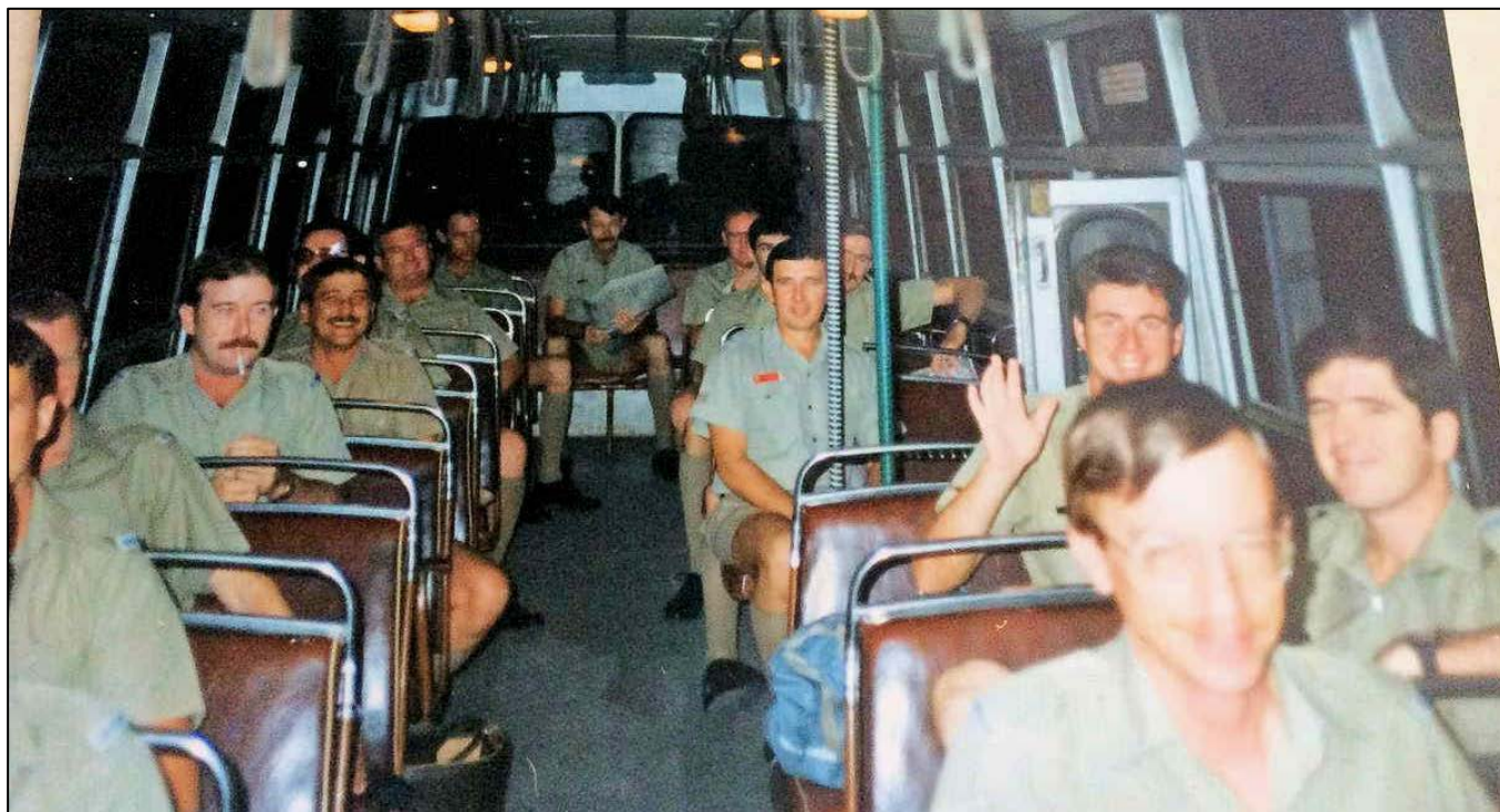
Who remembers the bus trips to work from Penang to Butterworth? On the bus 78/79