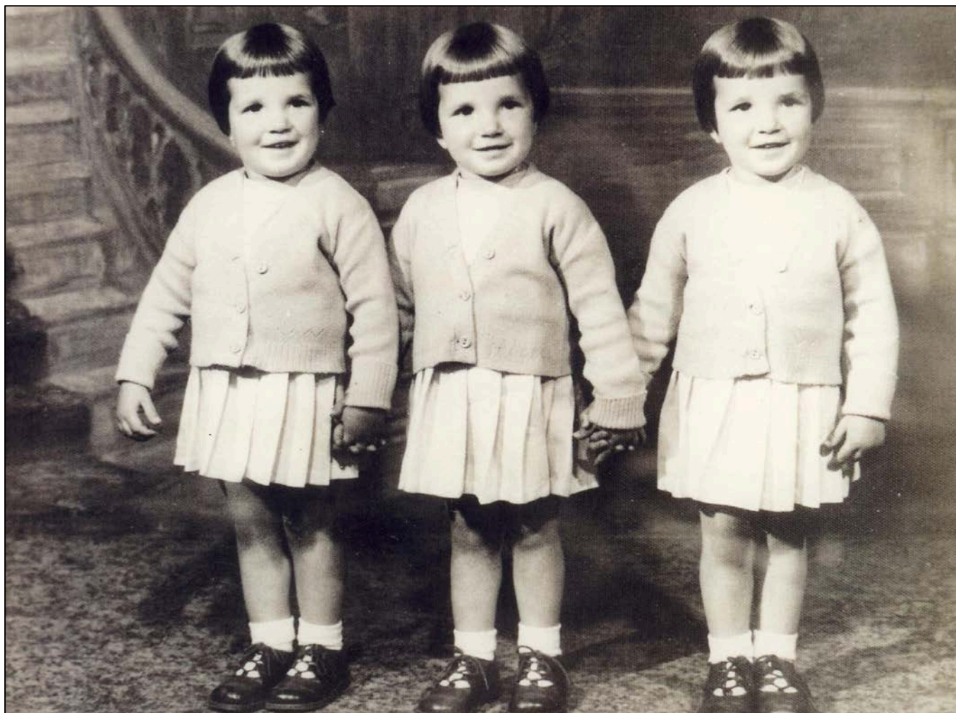
The Bishop triplets – at age 6

In 1992 they rented their house out and hit the road in their Caravan to do a coastal trip around Australia which turned into 21 years on the road, so there is not much of Australia that they have not seen.