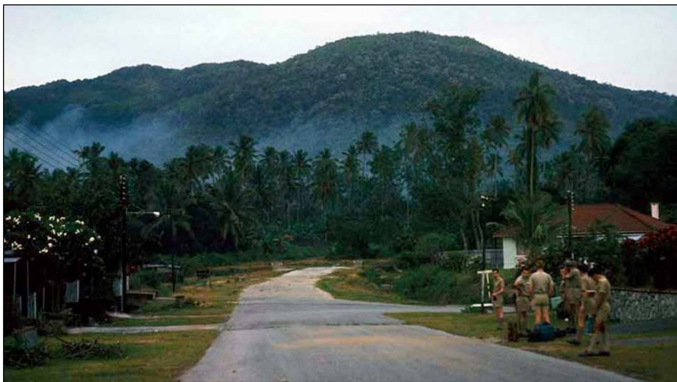
Waiting for the morning bus to the ferry. Corner of Jalan Cheah Seng Kim and Jalan Sungia Kevin.