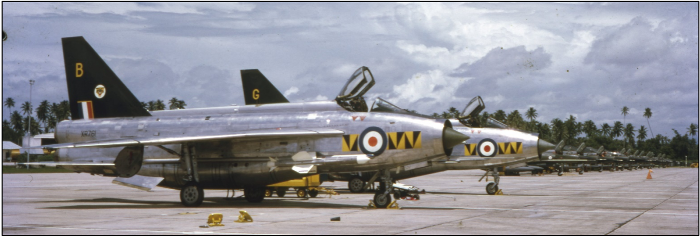
RAF Lightnings on exercise, 1970