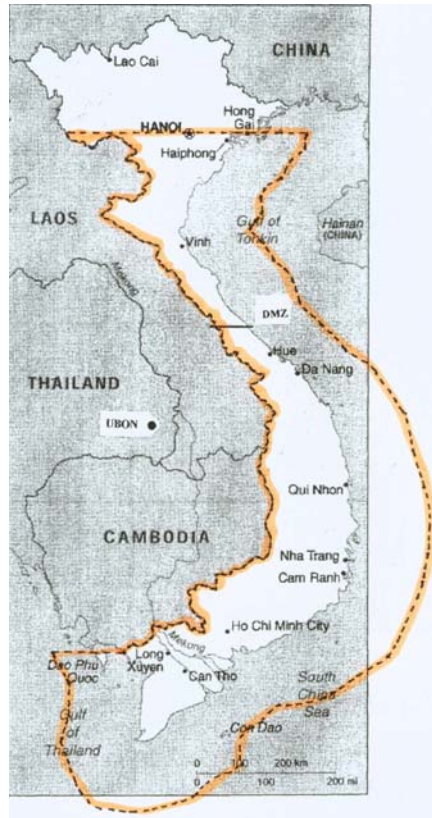
Figure 1: Area of Operations as determined by the Australian Department of Defence.

months in the operational area. The matter of allotment for travel to and from the operational area is not relevant in determining eligibility for medallic recognition. 15 The prescribed operational area included that land mass of North and South Vietnam and the off-shore waters to a distance of 100 nautical miles (185.2 kilometres) (see map).