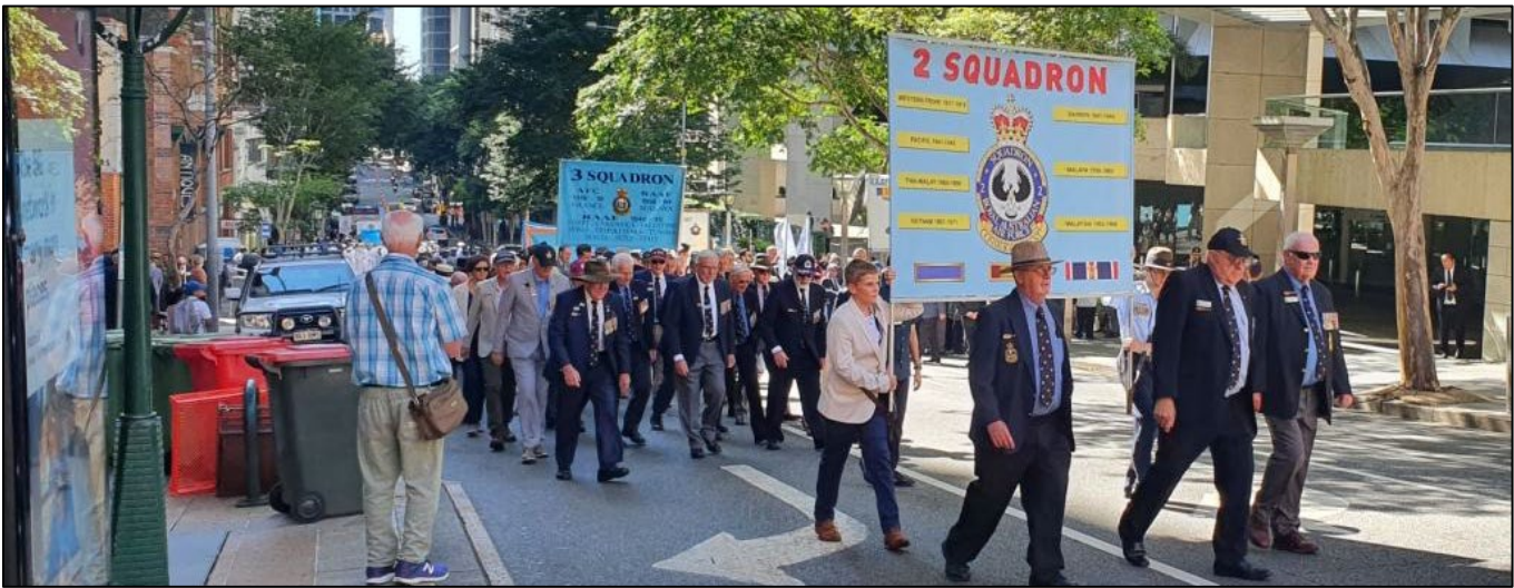
The next 3 pics are from RAAF image link

After waiting patiently for the signal to fall in, the Squadron Associations headed off. Click the pic below to see an example of precision marching drill. Who said the RAAF can't march?