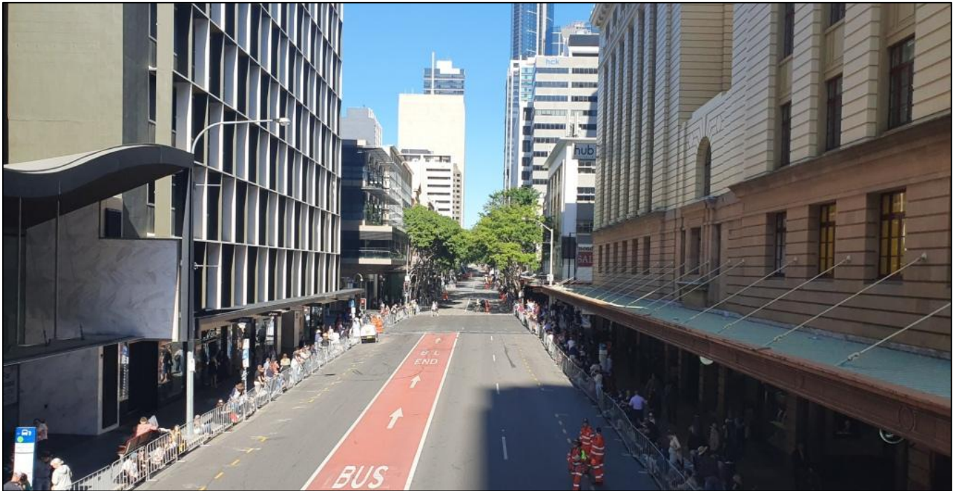
Adelaide Street, Brisbane, early on ANZAC Day morning, with crowds starting to take up positions to give thanks.

In Brisbane a number of CBD streets are closed to vehicle traffic from 3.00am until 3.00pm to allow the parade to take place and to allow the many thousands of people of Brisbane and surrounds to line the streets to give thanks to both current and ex-service people.