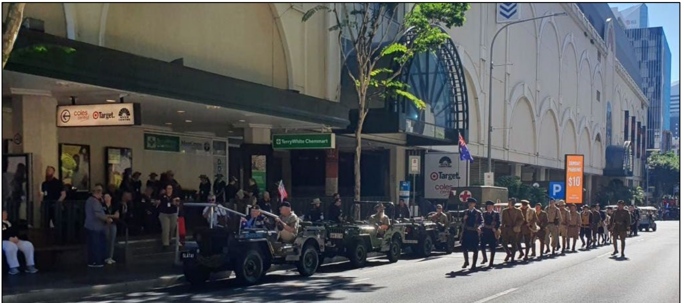
Jeeps line up in Elizabeth St, behind the Myer Centre, awaiting their passengers.

Those with too many birthdays under their belts, or who are unable to march the one kilometre down Adelaide St due to illness, are offered a ride in either a Jeep or golf buggy. The organising Committee seamlessly blend the Jeep carrying the Veteran into the march behind the Veterans' Squadron or Unit.