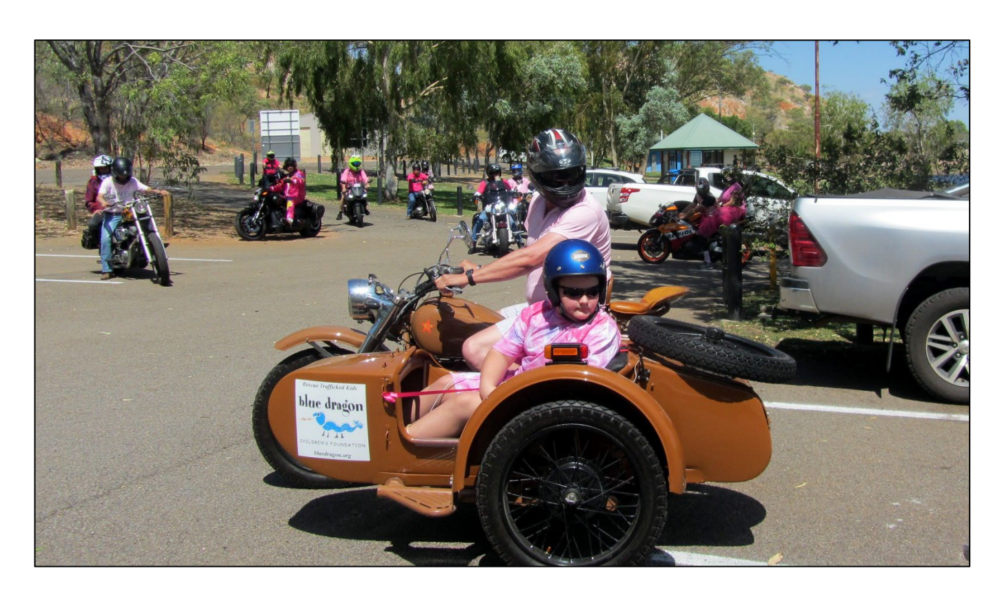
Well done mate – Scootaville 2023 is happening in August, now that you're retired, have another go?